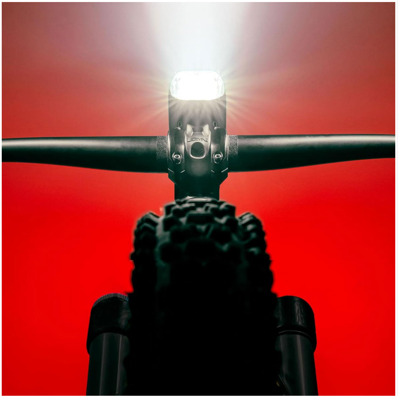
Image: The LEZYNE Mega Drive 2400+ light illuminated and mounted on a bicycle handlebar, demonstrating its operational state.