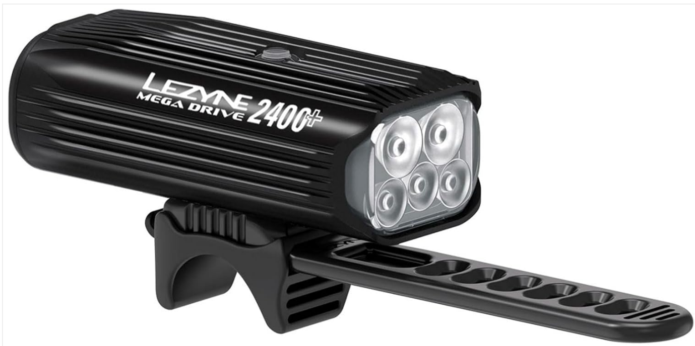
Image: The LEZYNE Mega Drive 2400+ light attached to a bicycle handlebar using its integrated silicone strap mount.