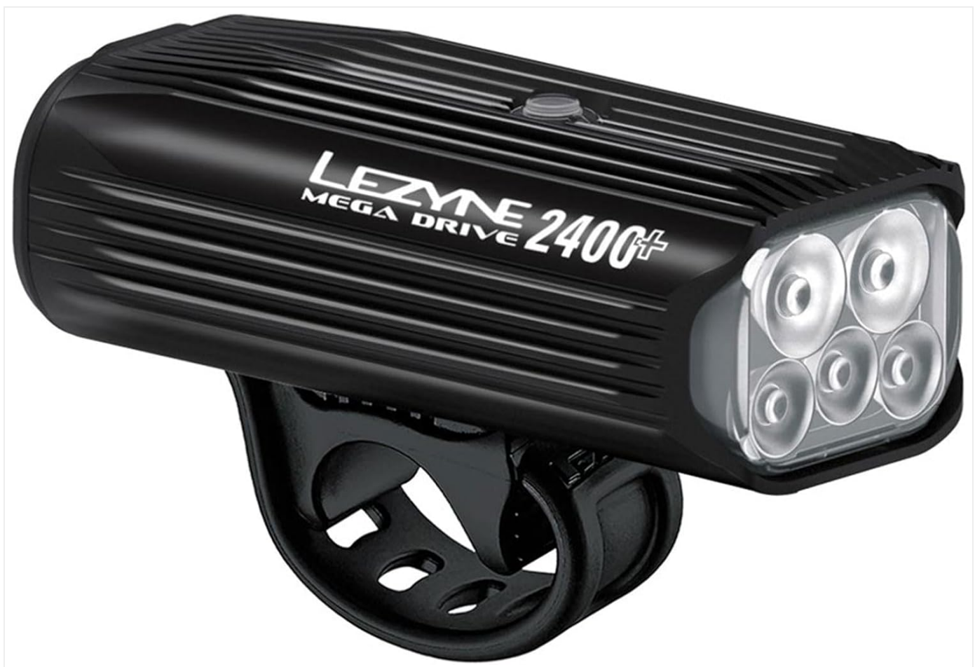
Image: The LEZYNE Mega Drive 2400+ front light, showcasing its sleek black aluminum body and multi-LED design.