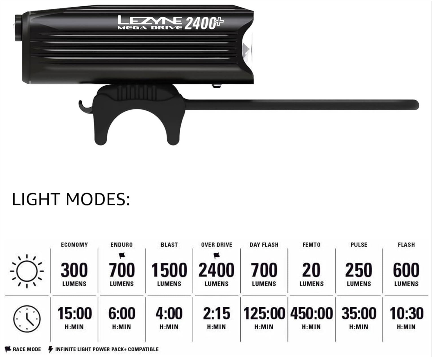
Image: A table illustrating the various light modes, lumen outputs, and corresponding runtimes for the LEZYNE Mega Drive 2400+.