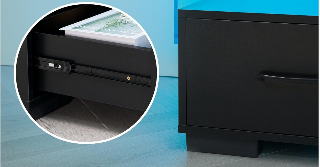
Figure 4.1: Detail of drawer slides and acrylic panel.

Your browser does not support the video tag.