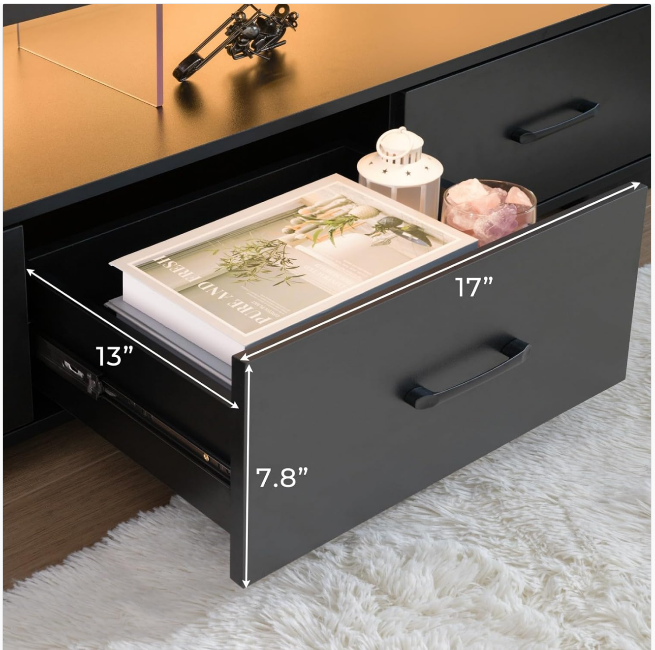
Figure 2.3: Detailed view of a storage drawer with internal measurements.