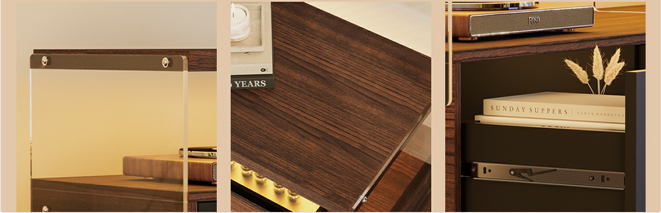
Figure 3.1: The entertainment center with its storage features.

It is a perfect choice for creating a stylish and neat living room.