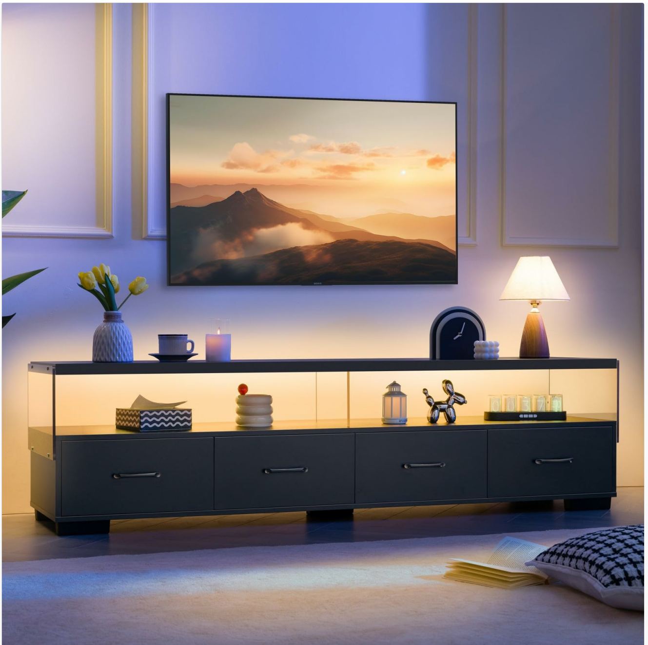
Figure 2.1: Overall view of the Cubehom 71-inch Black LED TV Stand.