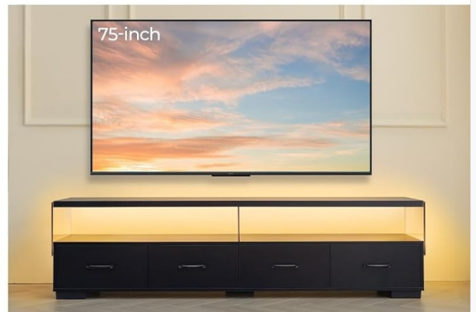
Figure 2.2: Product dimensions and TV size compatibility.