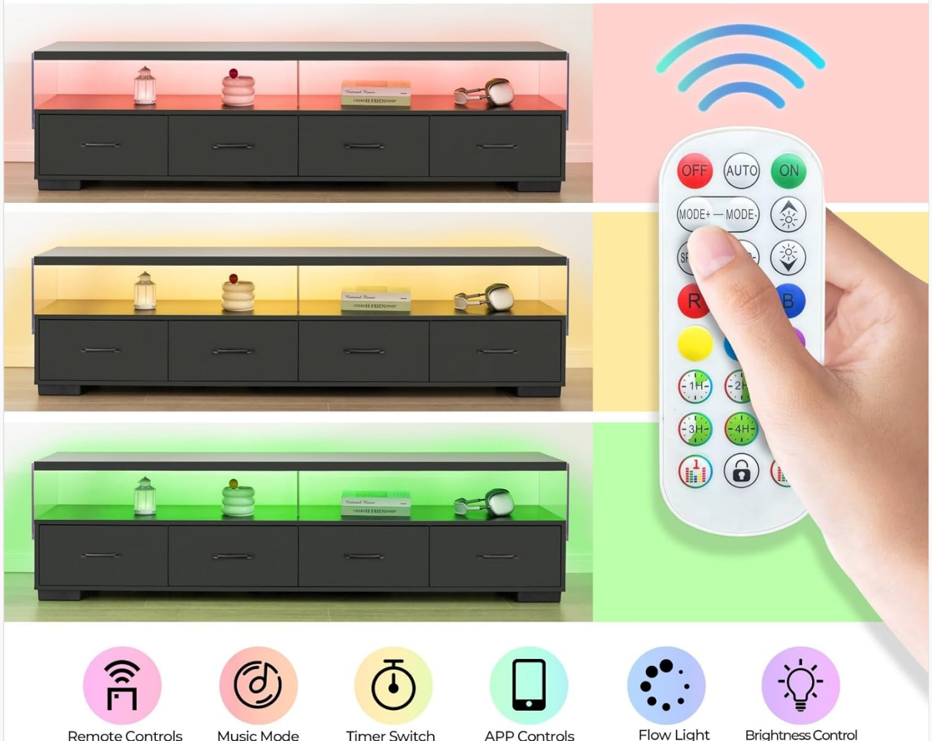
Figure 5.1: LED light remote control and color options.