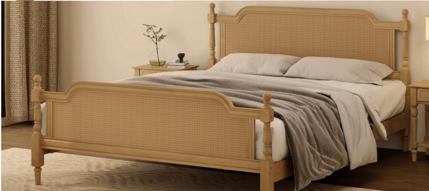
Image: A detailed view of the natural rattan weave, highlighting the material that requires specific care to maintain its appearance.

The headboard and footboard crafted from high-quality natural rattan for a stylish look.