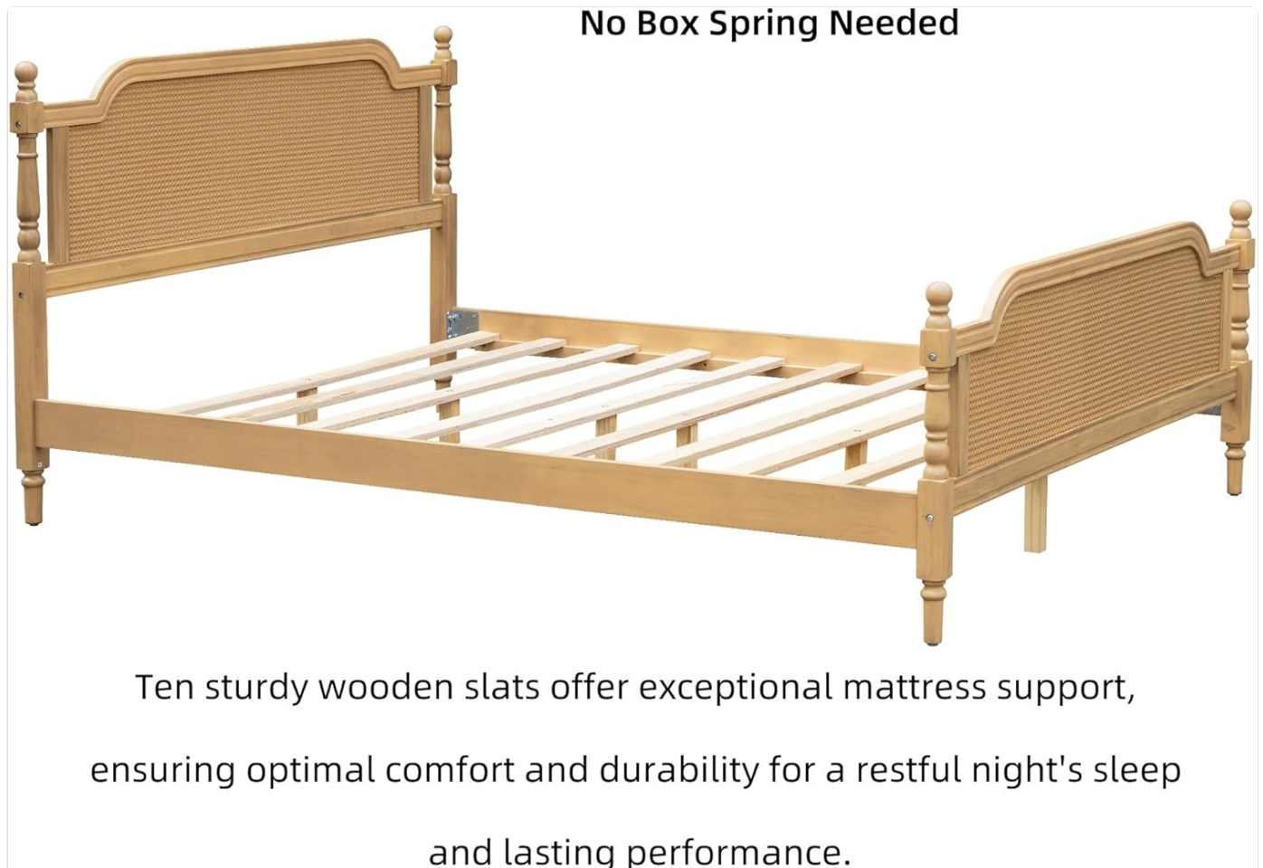
Image: The Merax bed frame structure showing the sturdy wooden slats designed to support a mattress directly, eliminating the need for a box spring.