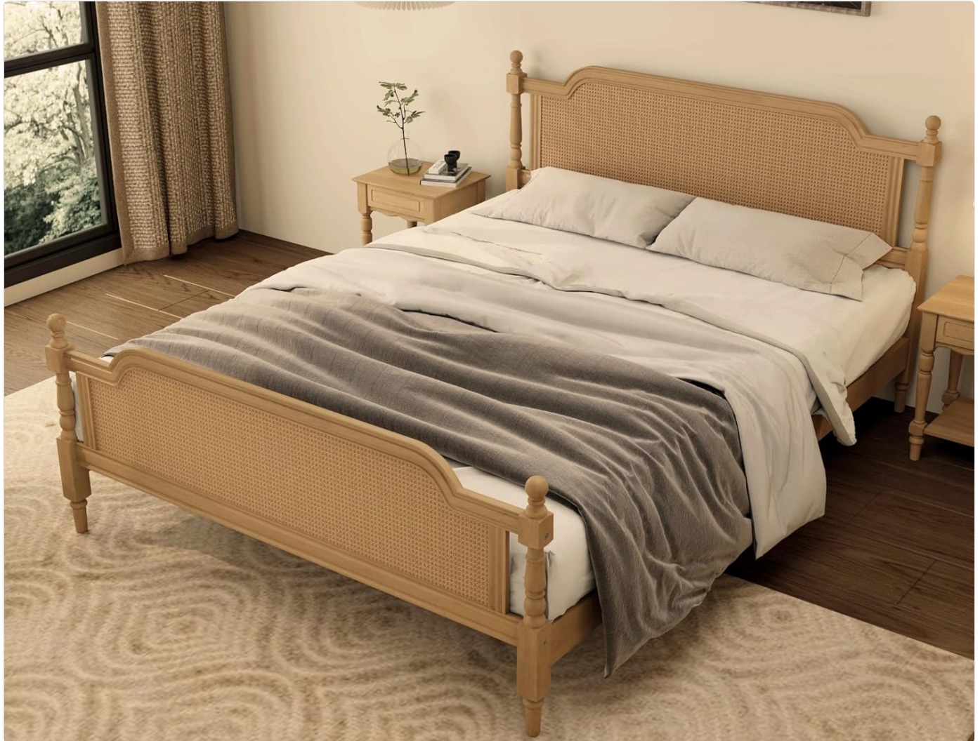
Image: The Merax Queen Platform Bed Frame fully assembled with a mattress and bedding, demonstrating its intended use in a bedroom environment.