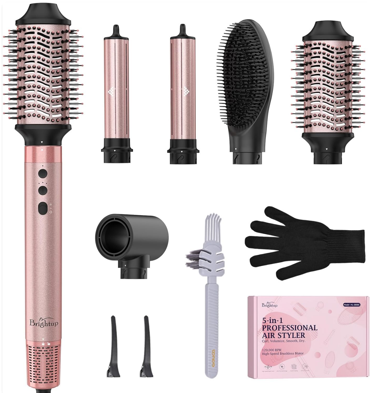
Image: All components of the Brightup 5-in-1 Air Styler, including the main unit, various brush heads, curling barrels, and accessories.

Your Brightup 5-in-1 Air Styler package includes the following components: