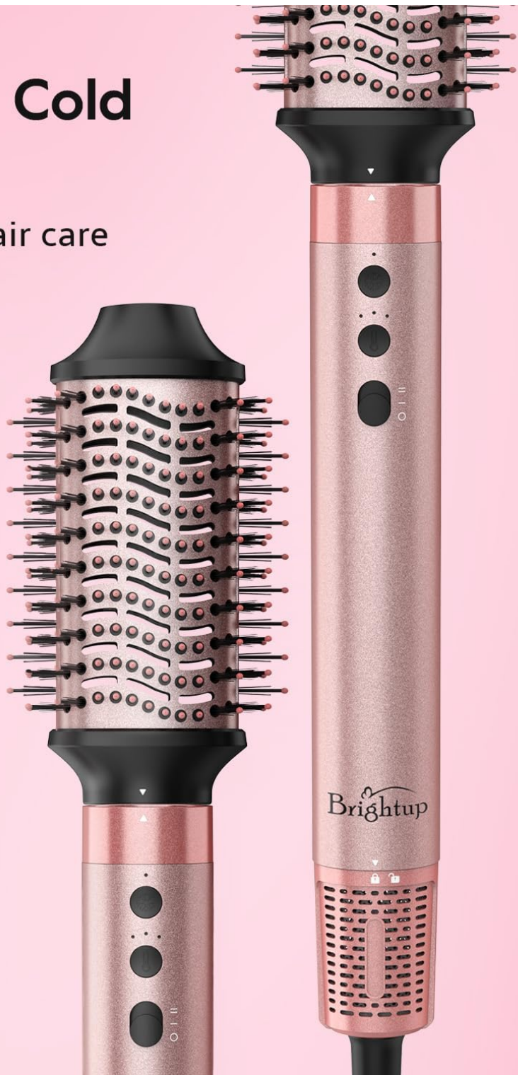
Image: Visual representation of the advantages of using Cool-Air Tech, including 50% less heat damage, 50% more hair volume, and 50% longer lasting style.