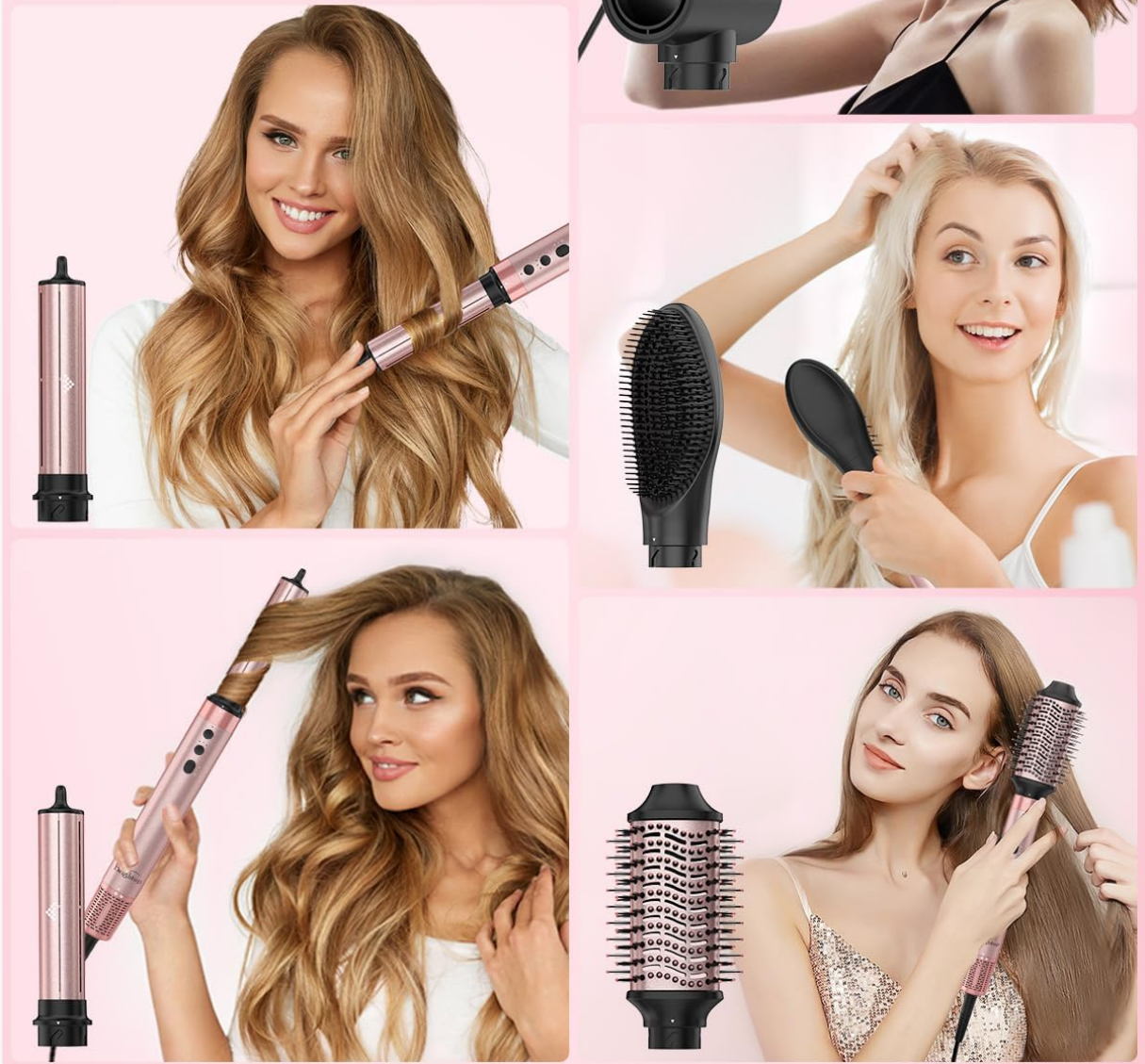
Image: Overview of the Brightup 5-in-1 Air Styler showcasing its multifunctional capabilities and various styling outcomes.