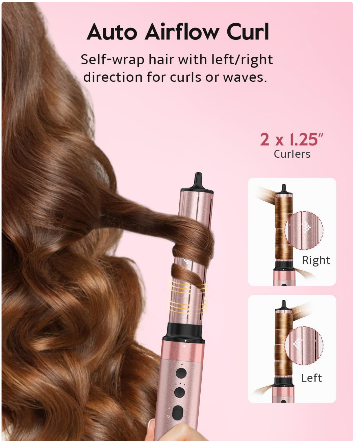
Image: Close-up of hair being styled into curls by the automatic curling iron, demonstrating the Coanda airflow.