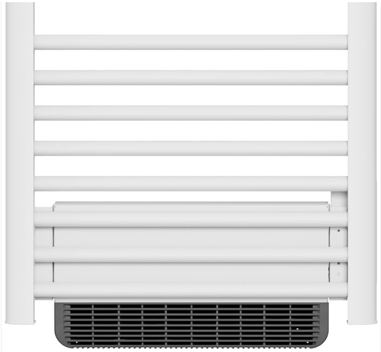
Figure 1: Front view of the BESTHERM HESTIA Electric Towel Dryer.