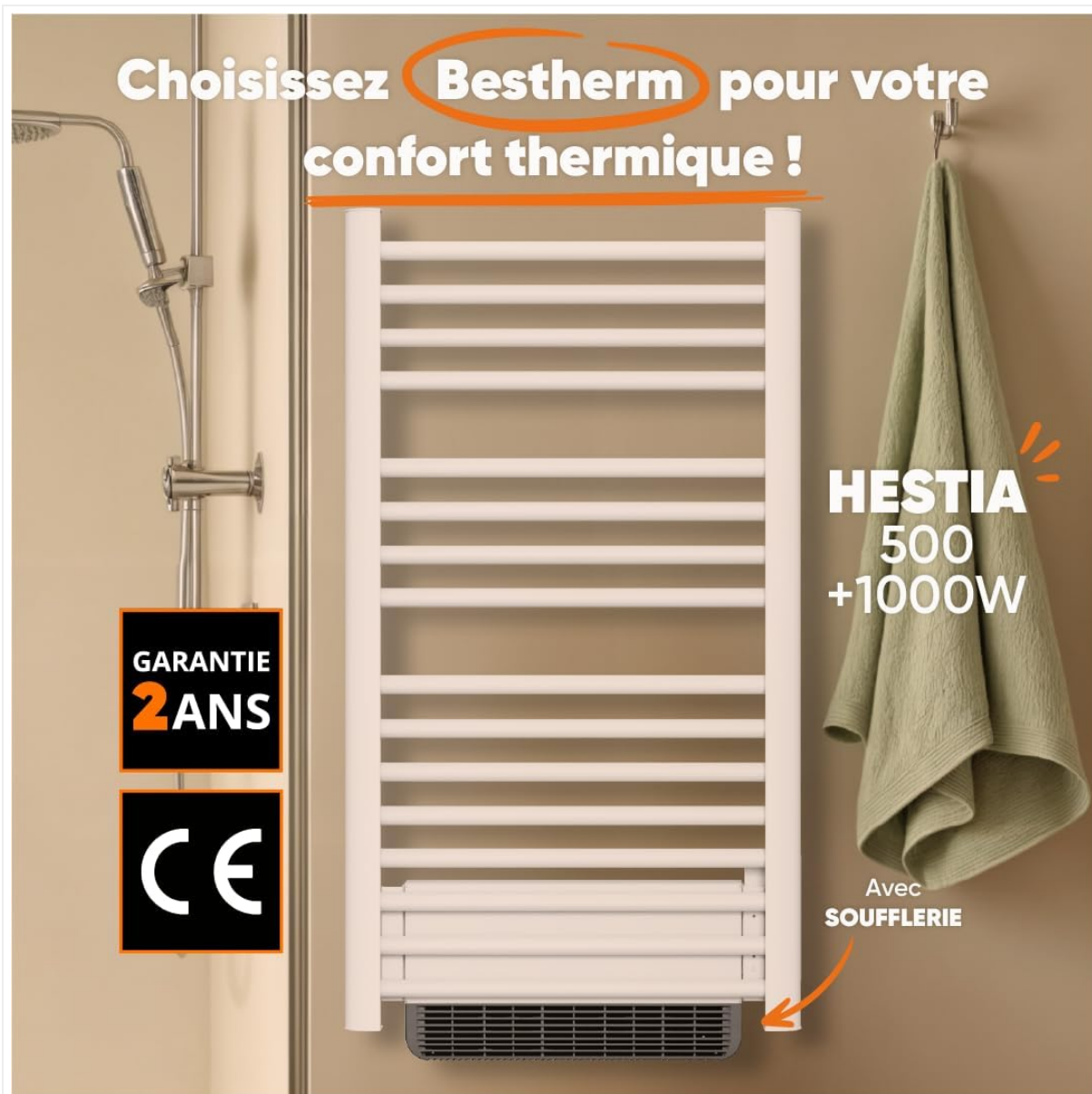
Figure 2: The BESTHERM HESTIA Electric Towel Dryer installed in a bathroom setting.