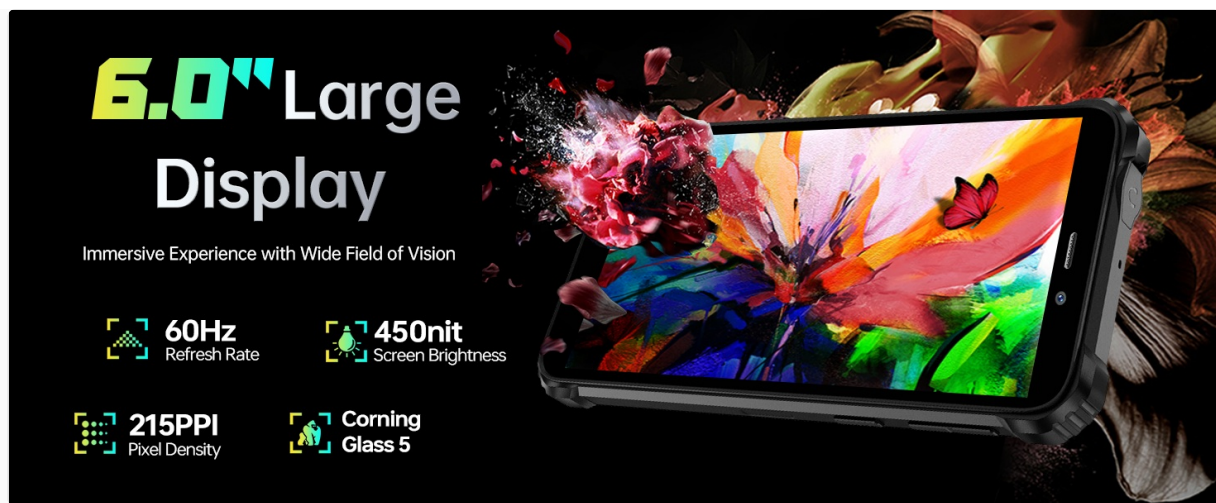
Image: The OUKITEL WP32 PRO displaying the Android 14 operating system interface.