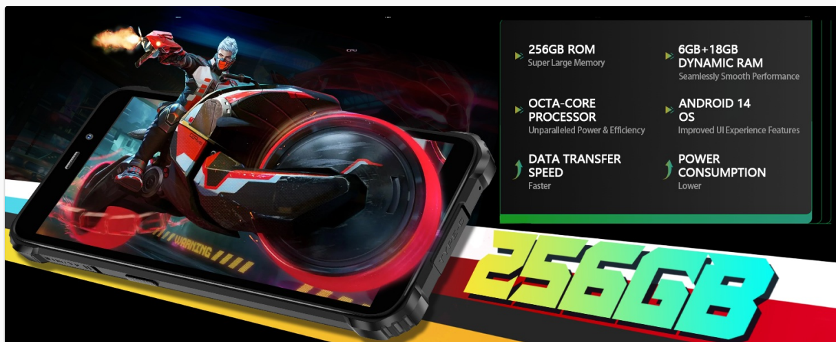
Image: Illustration of the 24GB RAM and 256GB ROM for smooth multitasking and storage.

The phone operates on Android 14, offering an optimized user experience. It features 24GB RAM (6GB physical + 18GB virtual) and 256GB internal storage, expandable up to 1TB with a TF card.