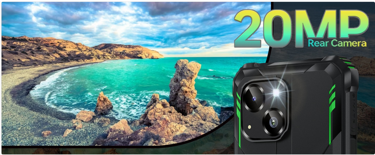
Image: Details of the 20MP rear and 5MP front cameras on the OUKITEL WP32 PRO.