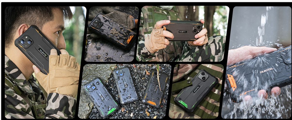
Image: Overview of the OUKITEL WP32 PRO Rugged Smartphone highlighting its robust design and features.

This manual provides essential information for the safe and efficient use of your OUKITEL WP32 PRO Rugged Smartphone. Please read it thoroughly before operating the device.