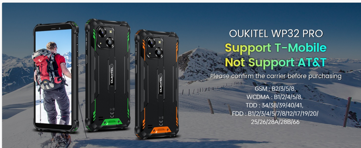
Image: The OUKITEL WP32 PRO in outdoor settings, emphasizing its rugged design.