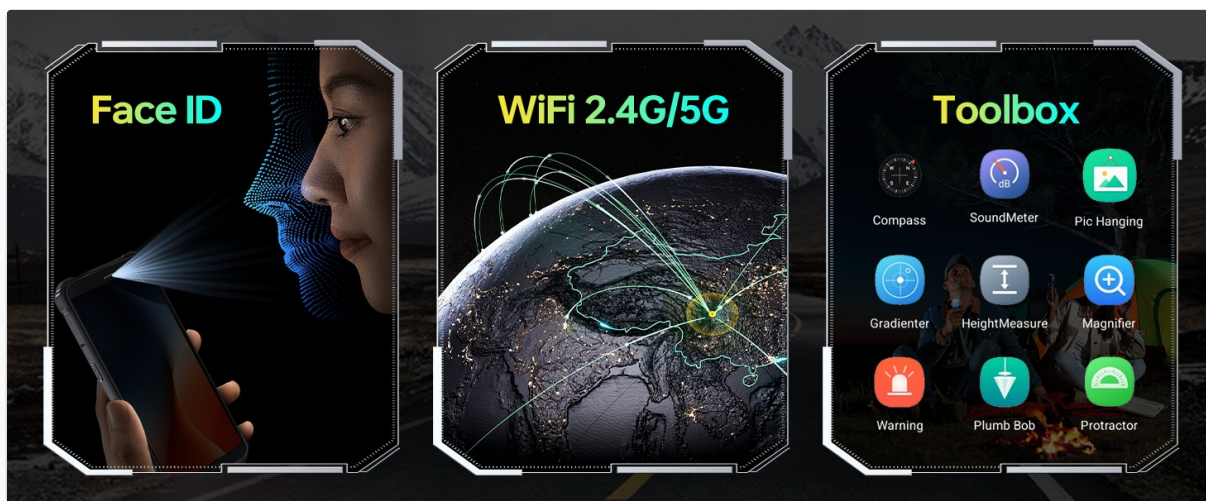
Image: Information regarding supported network bands and carrier compatibility for the OUKITEL WP32 PRO.

Your browser does not support the video tag.