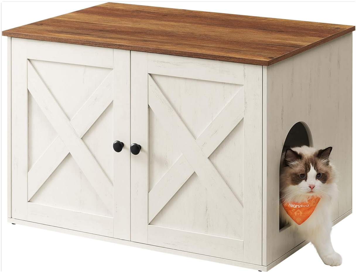
Image 1.1: The Feandrea Cat Litter Box Enclosure, shown as an end table with a cat using the side entrance.