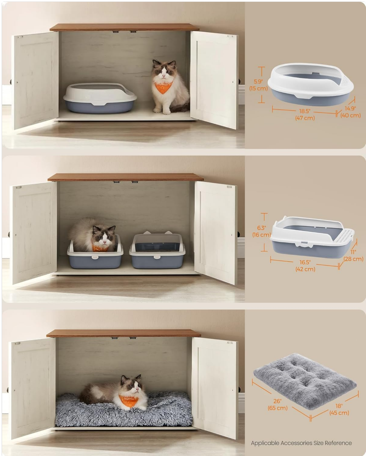
Image 4.1: The enclosure interior, demonstrating space for a litter box and a cat.