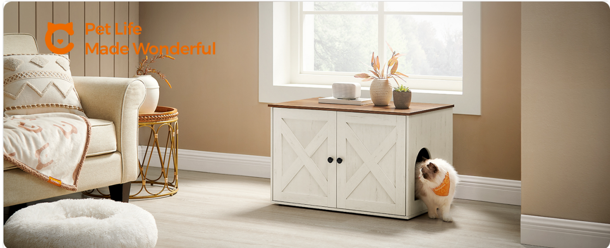
Image 4.3: The enclosure functioning as an end table in a home environment.

The robust top surface can be utilized as an end table for decorative items, lamps, or books, seamlessly integrating into your living space.