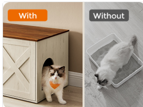
Image 4.2: Visual comparison of a litter box with and without the enclosure, highlighting the benefit of concealment.