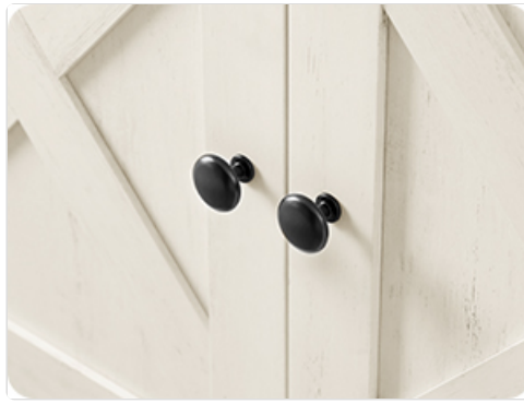
Image 3.1: Detail of the door handles, which are part of the assembly process.