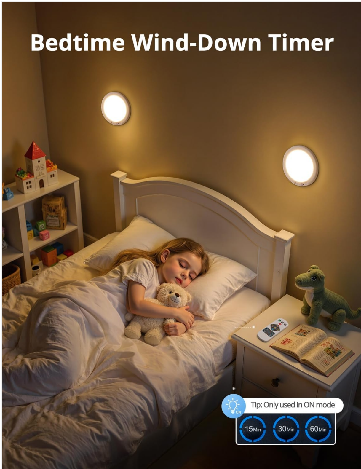
Image: A child sleeping in a bedroom with two lights on the wall, illustrating the bedtime wind-down timer feature with 15, 30, and 60-minute options.