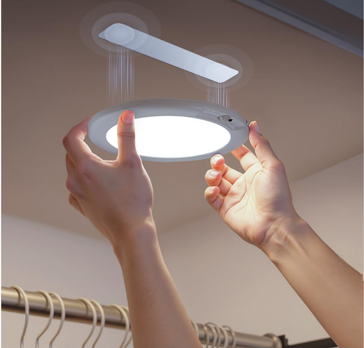
Image: A person demonstrating the magnetic installation of the Combuh T070 light onto a ceiling-mounted metal strip.