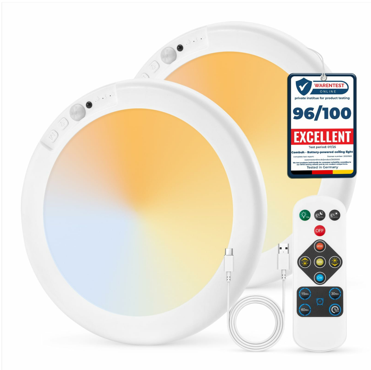
Image: The Combul T070 Rechargeable Motion Sensor Ceiling Light, a round, white fixture with integrated motion sensor and control buttons.