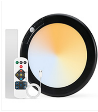
Image: A visual slider demonstrating smooth dimming from 30% (Soft Nighttime) to 100% (Crisp & Clear) brightness.