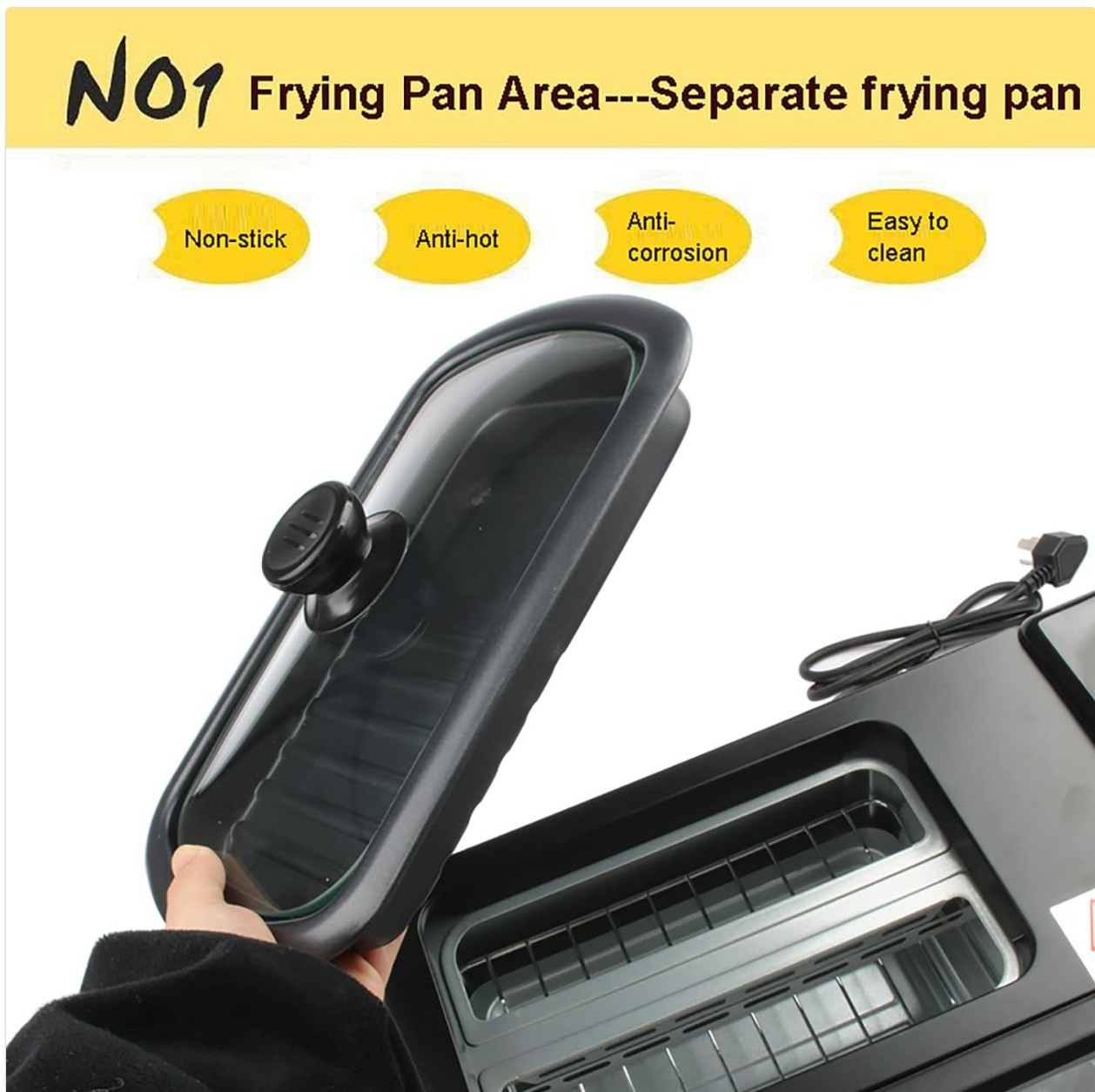
Image 5.2.1: Close-up of the frying pan area, highlighting its non-stick, anti-hot, anti-corrosion, and easy-to-clean properties. The image shows the pan with its glass lid.

The non-stick frying pan is located on top of the oven and is ideal for cooking eggs, bacon, sausages, and other breakfast meats. It shares the same temperature control as the oven.