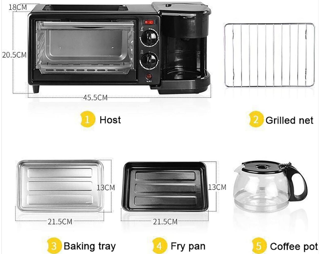
Image 3.1: Diagram showing the main unit and included accessories with dimensions. The image labels the main unit as "Host", the wire rack as "Grilled net", the baking tray as "Baking tray", the fry pan as "Fry pan", and the coffee pot as "Coffee pot".