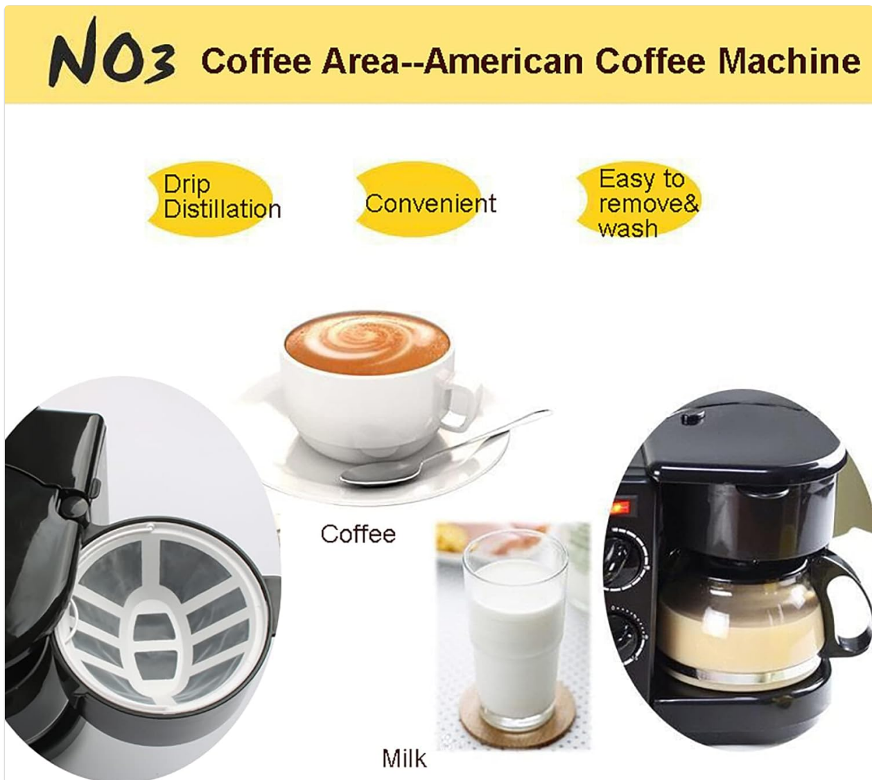
Image 5.3.1: View of the coffee machine area, illustrating its drip distillation method, convenience, and ease of cleaning. The image shows the filter basket and the glass coffee pot.

The integrated coffee machine has a 600ml capacity and uses a drip distillation method for brewing coffee. It can also be used for tea or boiling water.