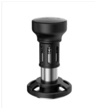
Image: Visual guide for tamper size compatibility, highlighting the 51mm option.