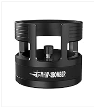
Image: Step-by-step guide on how to use the tamper for optimal espresso preparation.

The tamper's design ensures that it automatically adapts to the height of the coffee grounds, requiring no manual adjustment for depth. The maximum tamping depth is 13mm.