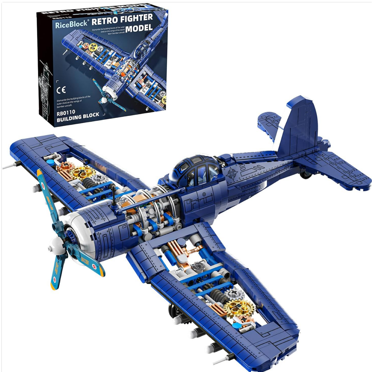
Figure 4.1: The RiceBlock Military F4U Plane Building Set, showing the completed model and its packaging.

The assembly process involves constructing the fuselage, wings, tail, cockpit, and engine components. Pay close attention to the orientation of pieces and the connection points to ensure structural integrity and proper functionality of moving parts.