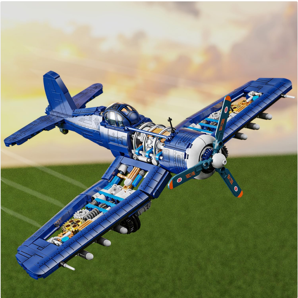
Figure 4.2: The fully assembled RiceBlock Military F4U Plane, showcasing its detailed design and flight-ready appearance.