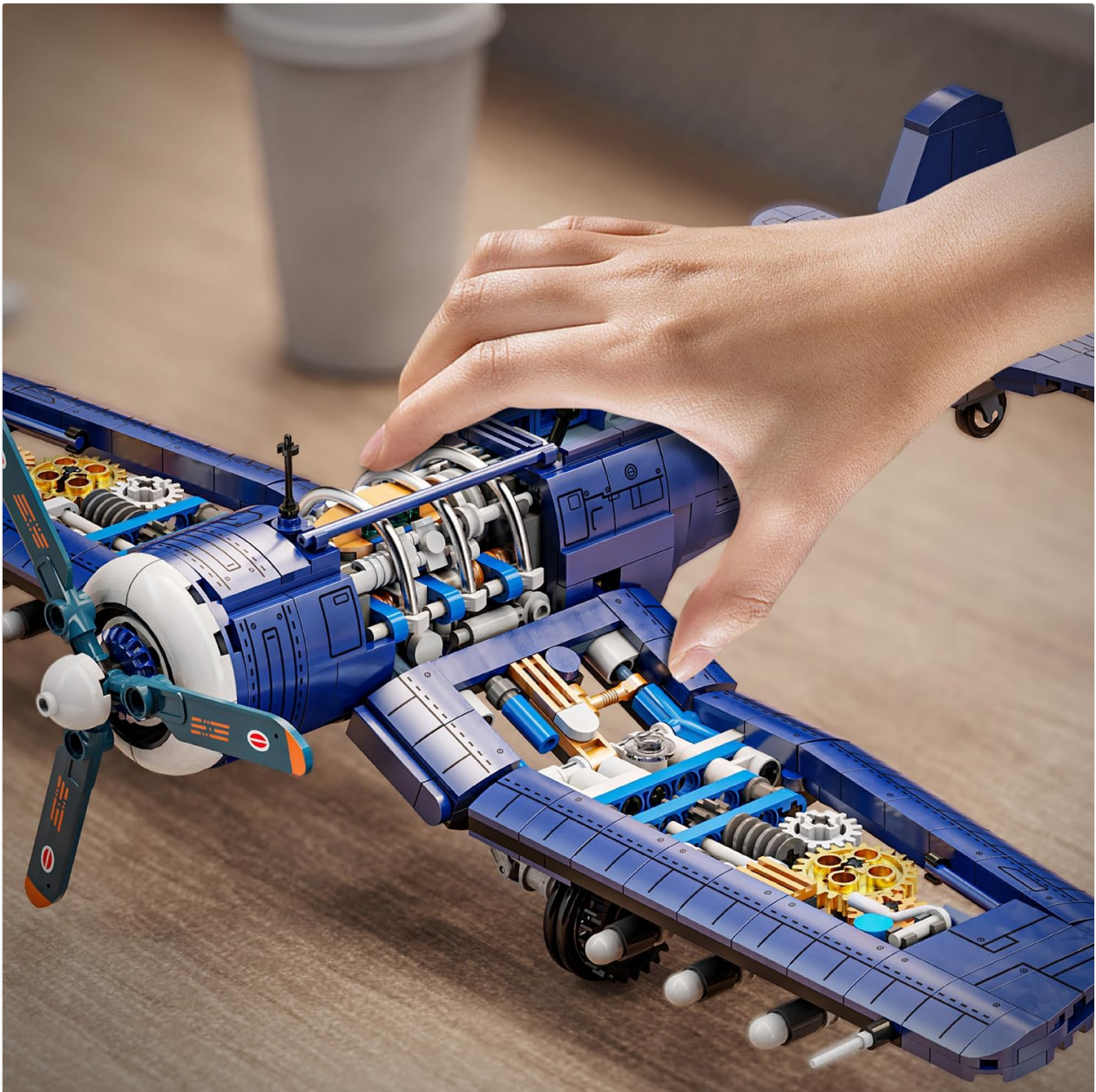
Figure 5.1: A hand demonstrating the functional cockpit door of the assembled F4U plane model.

The set also includes additional accessories like road signs and plants to enhance imaginative play scenarios.