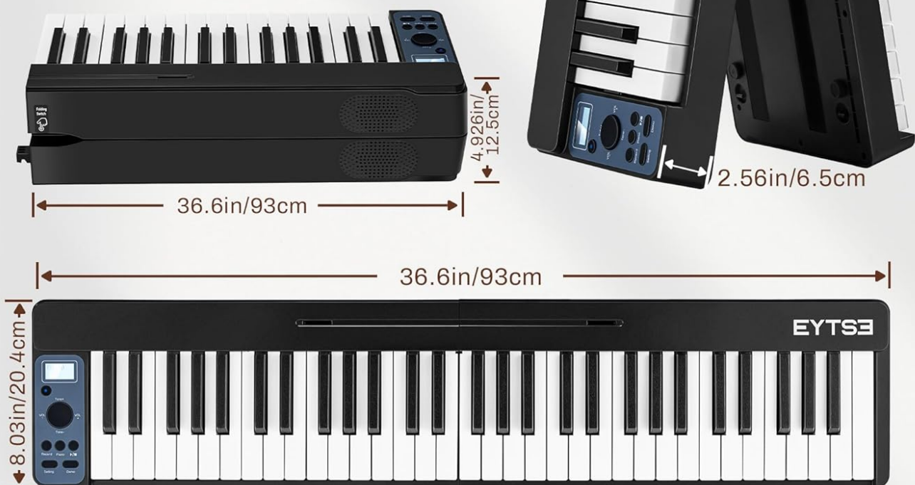
Figure 9.1: Detailed dimensions of the keyboard in both its unfolded and folded states, highlighting its compact and portable design.