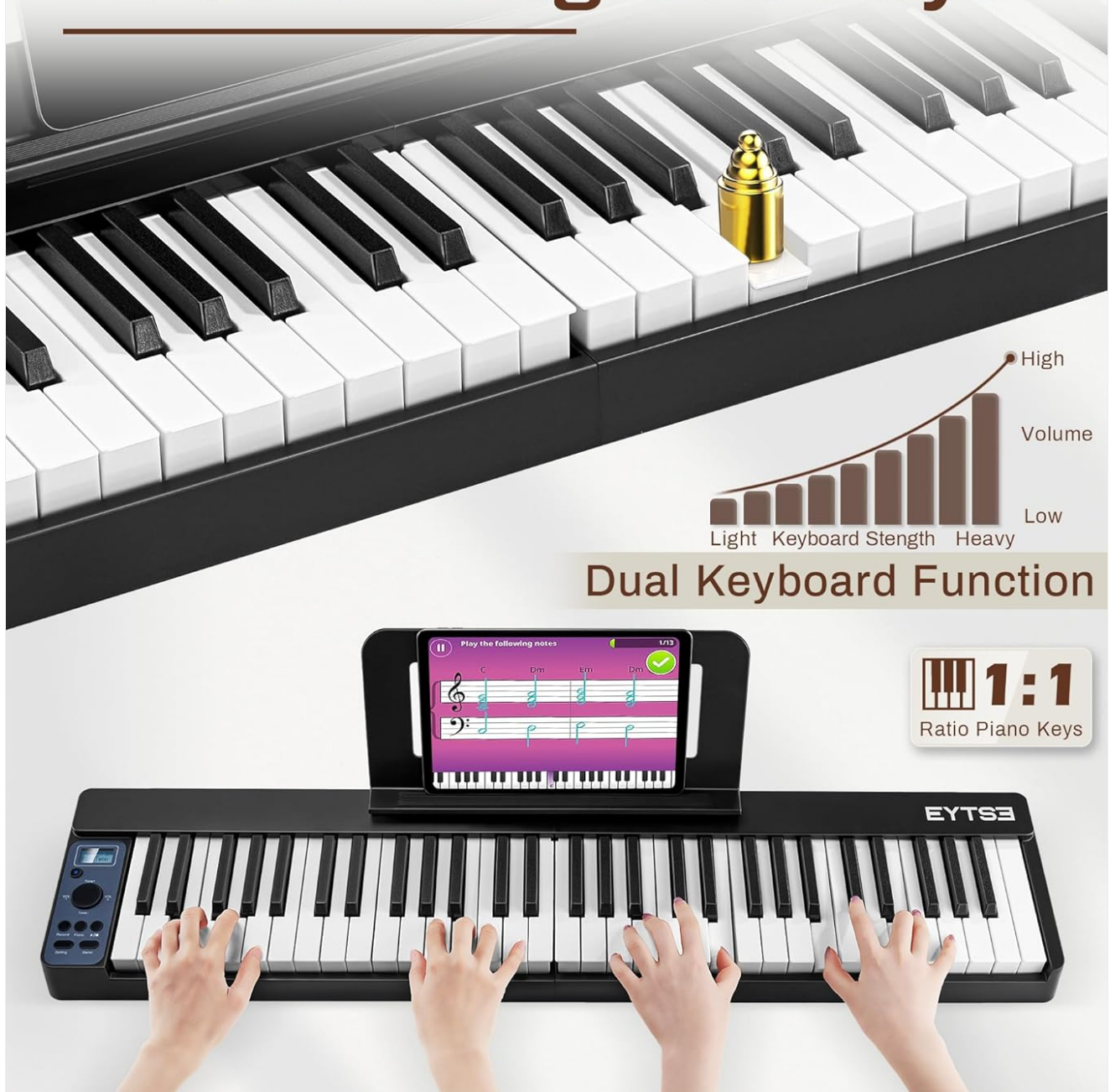
Figure 4.3: A detailed view of the semi-weighted keys, illustrating their design and responsiveness for a realistic playing feel.