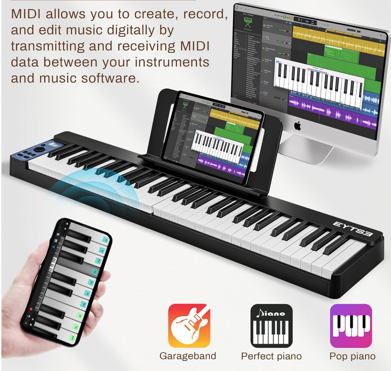
Figure 5.1: The keyboard demonstrating its wireless MIDI capabilities, connecting to a tablet displaying a music app and a smartphone with a piano interface.

MIDI allows you to create, record, and edit music digitally by transmitting and receiving MIDI data between your instruments and music software.