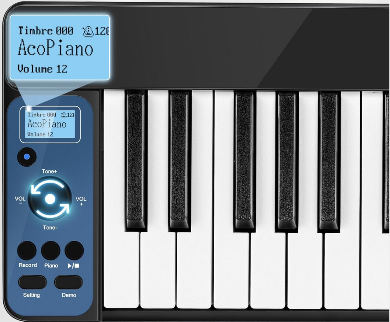
Figure 4.1: The control panel showing the LCD display, volume and tone controls, and function buttons for recording, piano mode, and demo tracks.

Clear LCD shows piano functions and settings for easy adjustments.