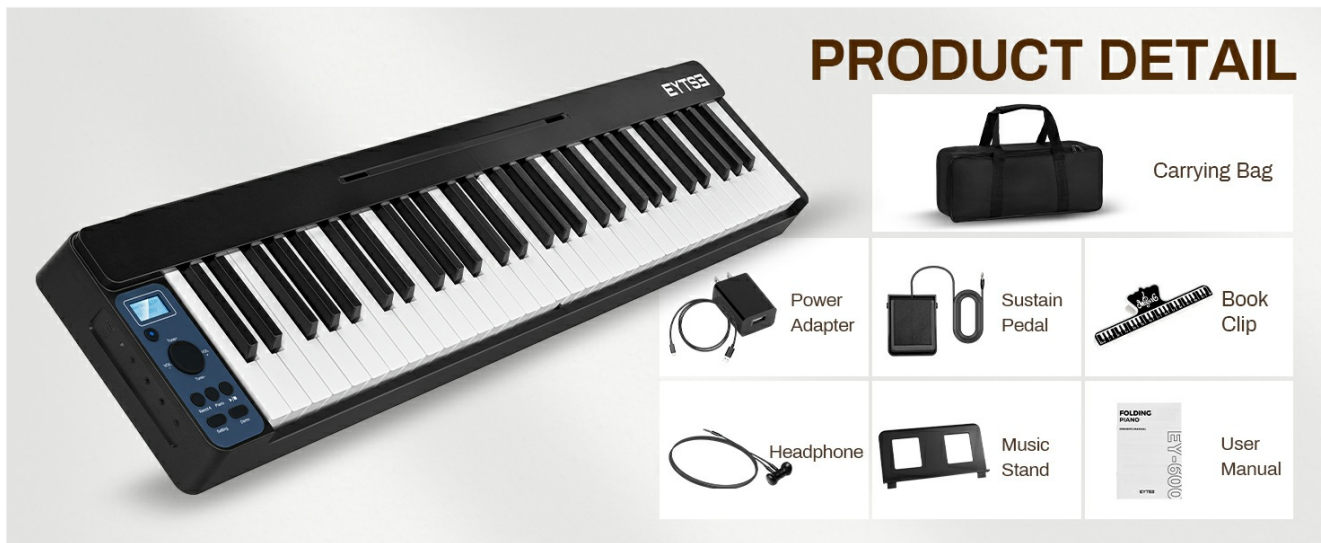
Figure 2.1: The EYTSE EY600 61-Key Folding Piano Keyboard shown with its included accessories: a carrying bag, sustain pedal, power adapter, music stand, headphones, USB cable, and user manual.