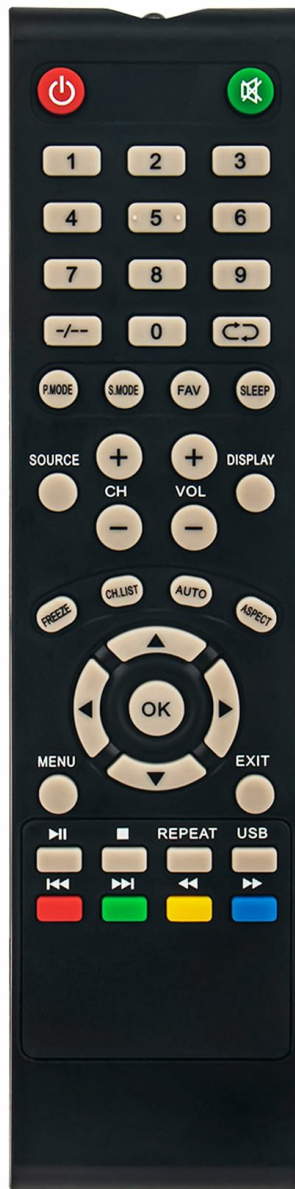
Image: Front view of the remote control, displaying all buttons and their labels.