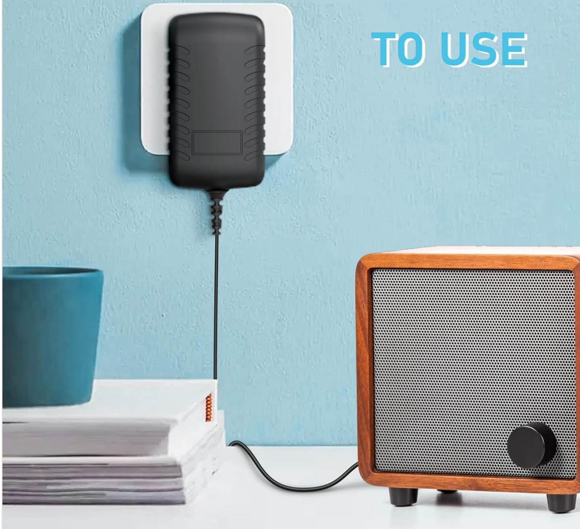
Image: The adapter securely plugged into a wall outlet, ready for use.