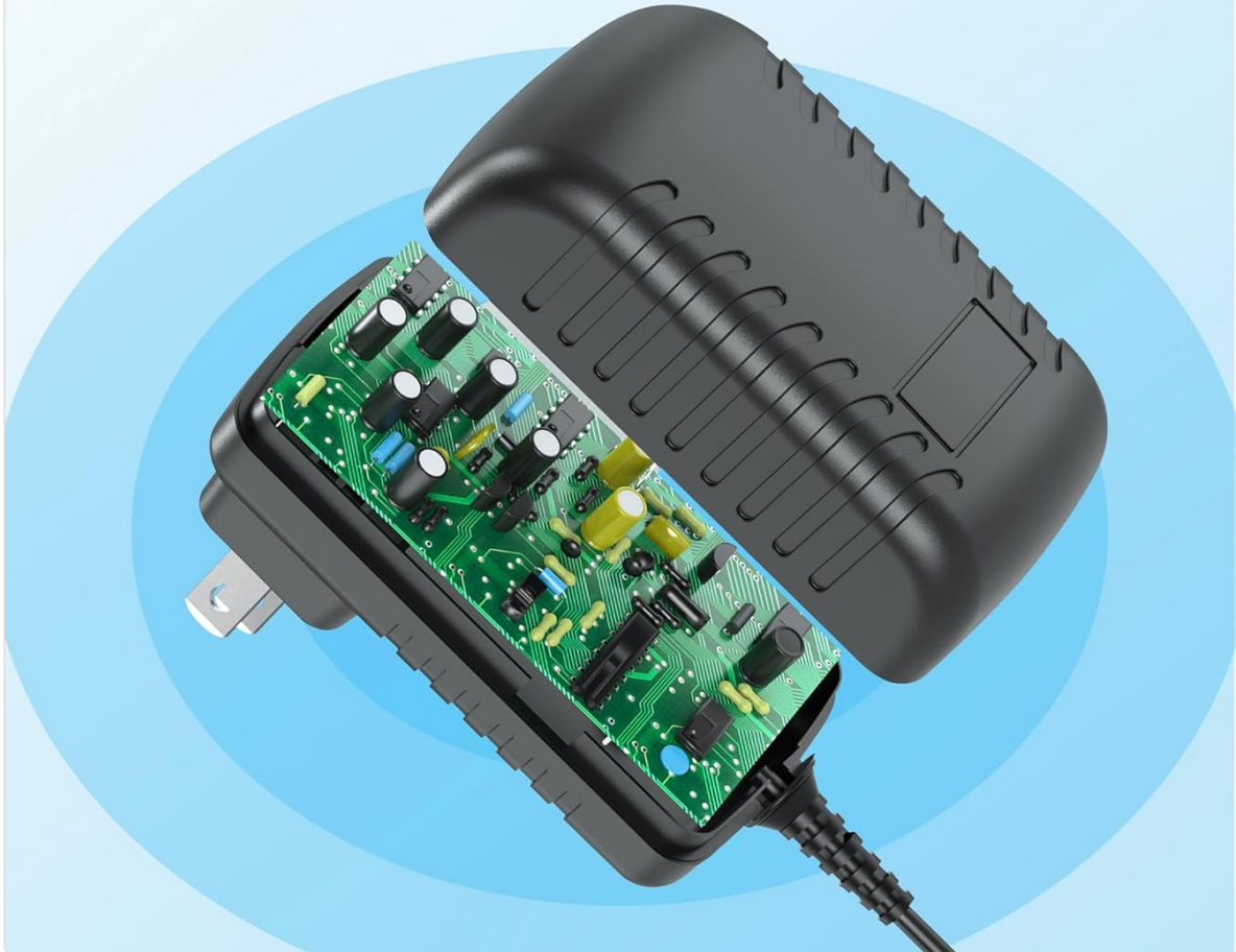
Image: The adapter's internal design incorporates multiple safety protections for reliable use.

Proposition 65 Warning: This product may contain chemicals known to the State of California to cause cancer and birth defects or other reproductive harm. For more information, go to www.P65Warnings.ca.gov .