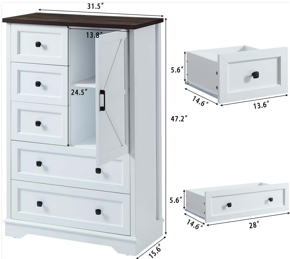
Image 3.1: Detailed dimensions of the dresser and its components, including drawer and cabinet measurements.