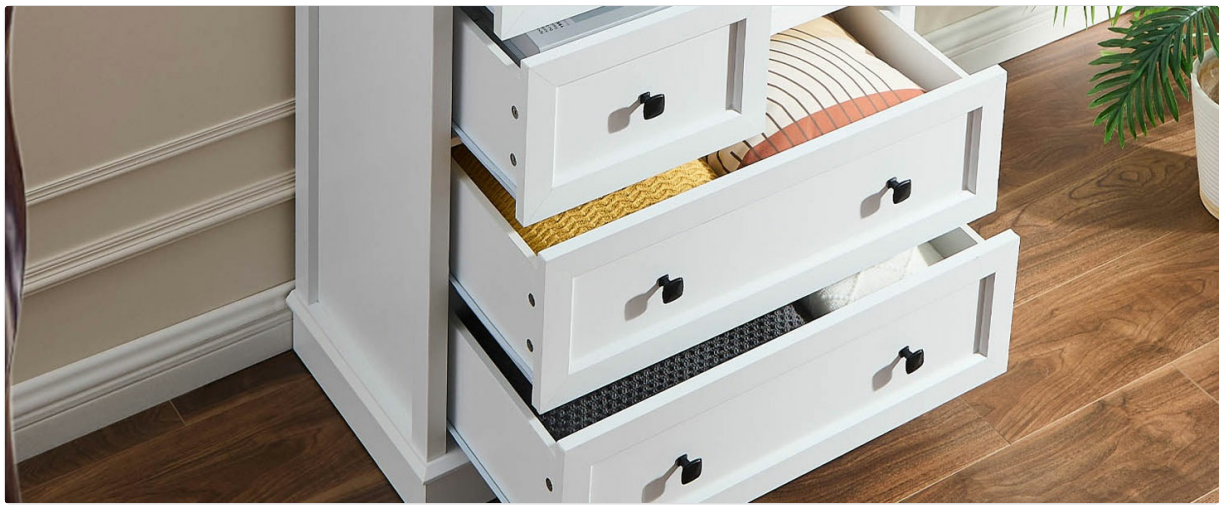
Image 5.2: A close-up view of the bottom drawers, demonstrating their depth and suitability for various folded garments.