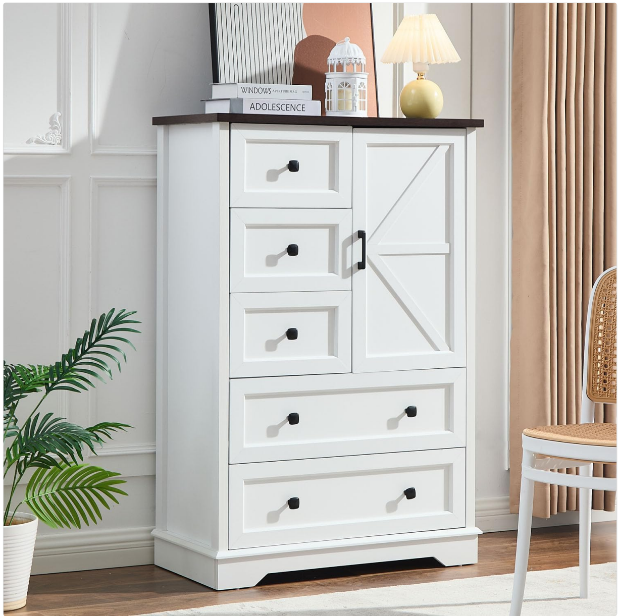
Image 1.1: The SOOWERY Farmhouse Dresser, featuring a white finish and dark top.