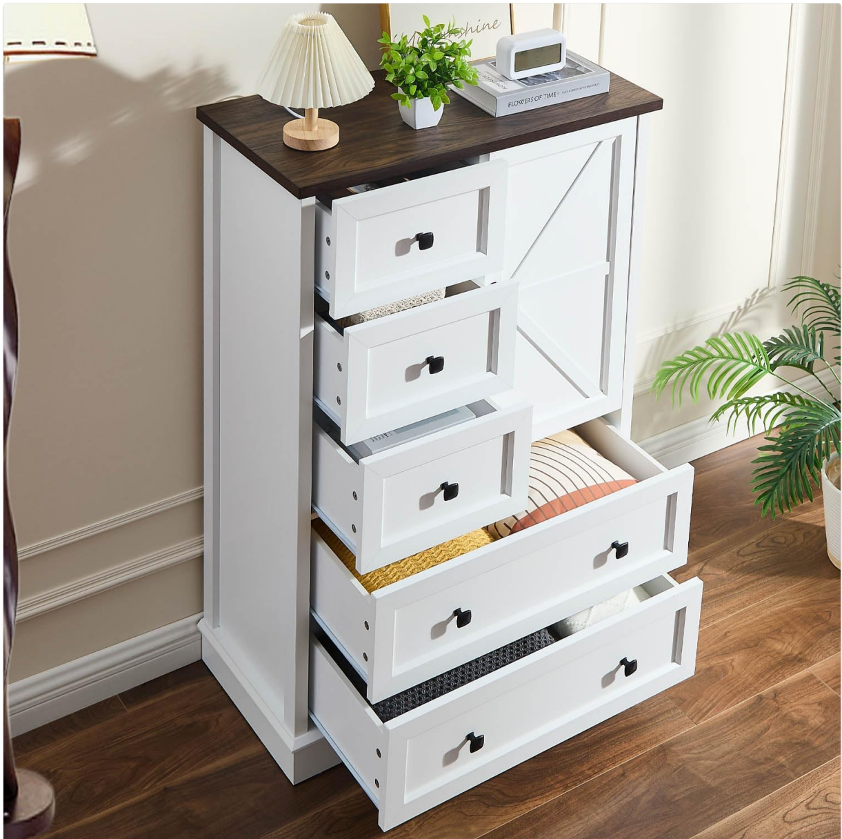
Image 5.1: The dresser with its drawers partially open, illustrating the internal storage capacity.