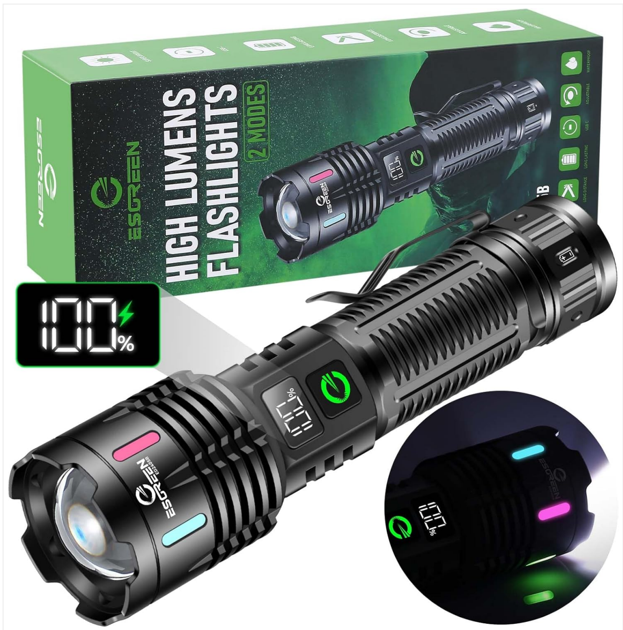
Image: The Esgreen ED2405B flashlight shown with its retail packaging, highlighting the product and its accessories.