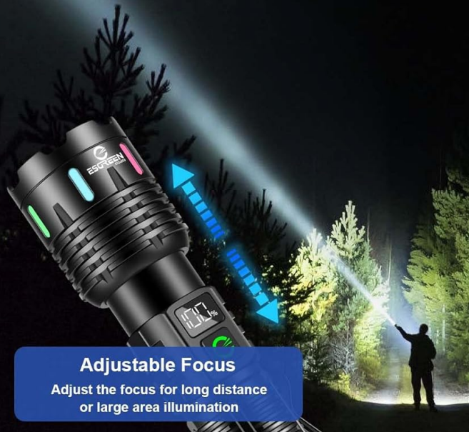
Image: The flashlight's adjustable focus feature, showing how to switch between a wide floodlight and a concentrated spotlight beam.