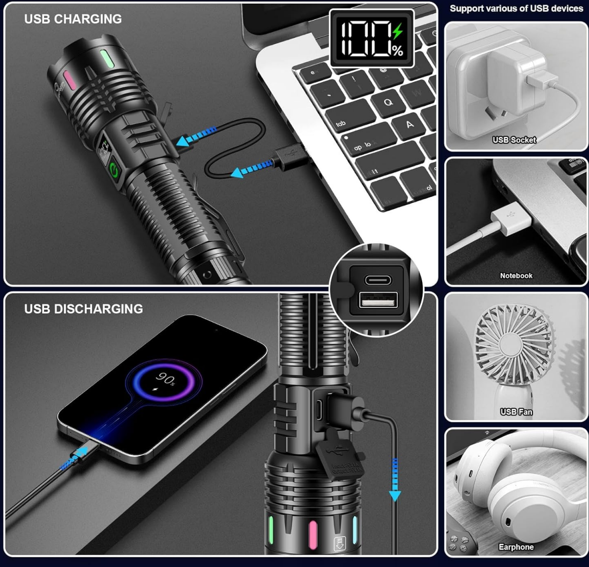
Image: The flashlight's multi-functional USB ports, illustrating its ability to be charged via USB-C and to charge other devices via USB-A.