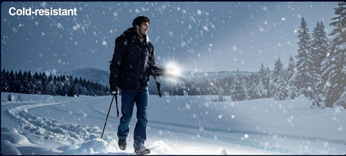
Image: The flashlight demonstrating its heavy-duty, waterproof, and cold-resistant properties in outdoor environments.