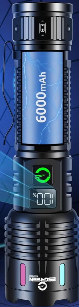
Image: Close-up of the flashlight's body, highlighting the LCD digital display that indicates the remaining battery charge.