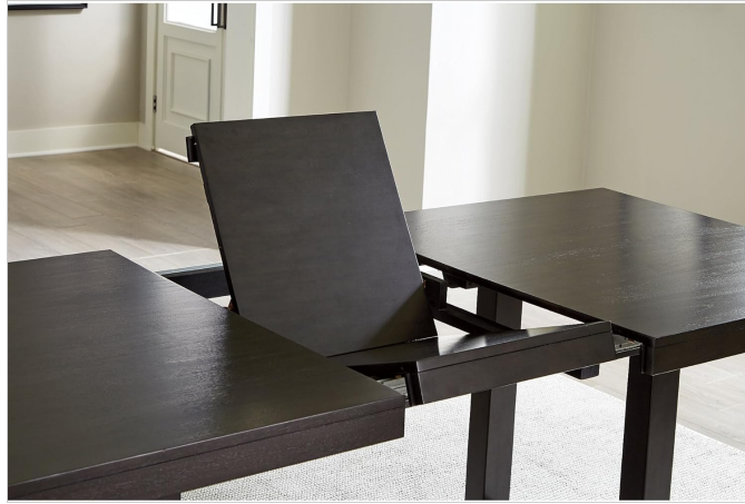
Image: A detailed view of the table's self-storing butterfly leaf mechanism as it begins to unfold, revealing the internal structure.