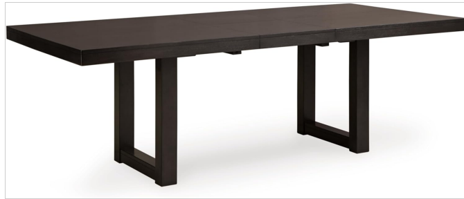
Image: The fully assembled Signature Design by Ashley Neymorton Dining Extension Table, showcasing its dark brown finish and sled base design.