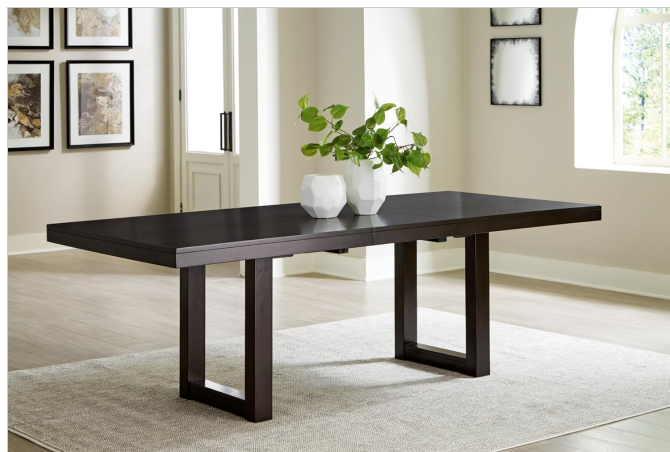
Image: The Neymorton Dining Extension Table positioned in a contemporary dining room, illustrating its scale and aesthetic.