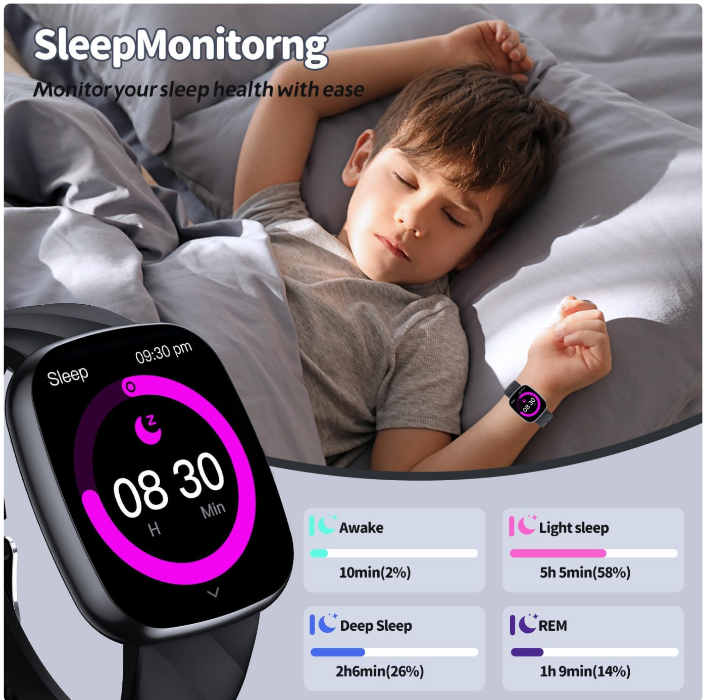
Image 4.3: A child sleeping while wearing the watch, with an overlay showing the watch's sleep tracking interface and sleep stage breakdown.

Wear the watch during sleep for automatic tracking of sleep patterns, including deep sleep, light sleep, and awake times. Detailed reports are available in the CO-FIT app.