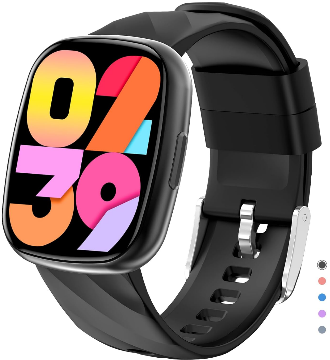
Image 1.1: The AYATAHA S60K Kids Smart Watch, featuring a black strap and a vibrant digital screen displaying time and other metrics.