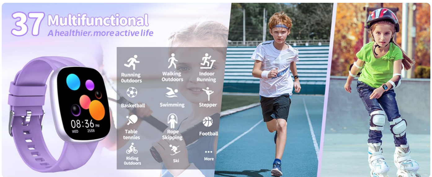
Image 4.4: Visual representation of the watch's multiple sport modes, showing children participating in different physical activities.