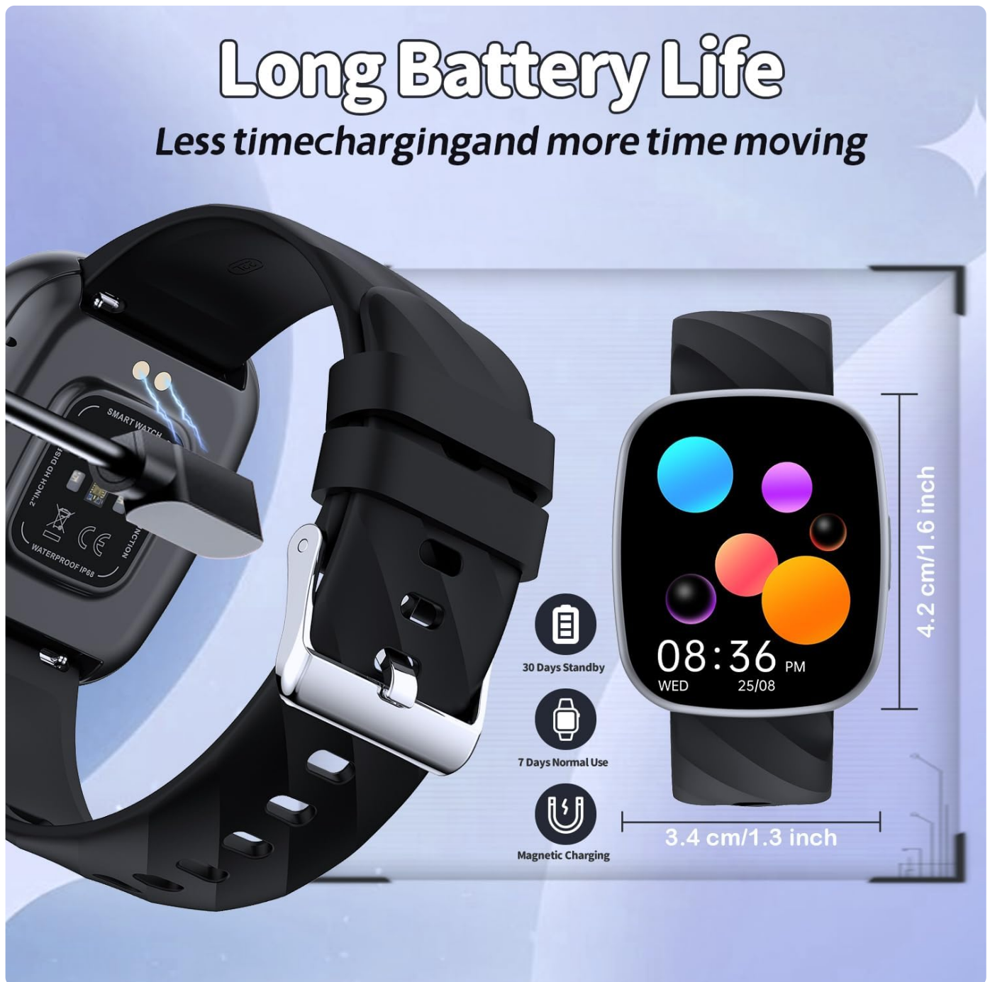
Image 3.1: The AYATAHA S60K Smart Watch connected to its magnetic charging cable, illustrating the charging process.

Before first use, fully charge the smart watch. Connect the magnetic charging cable to the charging port on the back of the watch and plug the USB end into a standard USB power adapter (not included) or a computer's USB port.