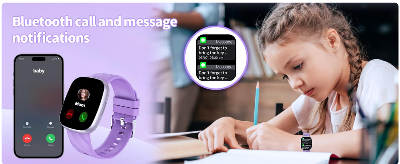
Image 4.7: The watch displaying an incoming call and a message, illustrating its notification capabilities.