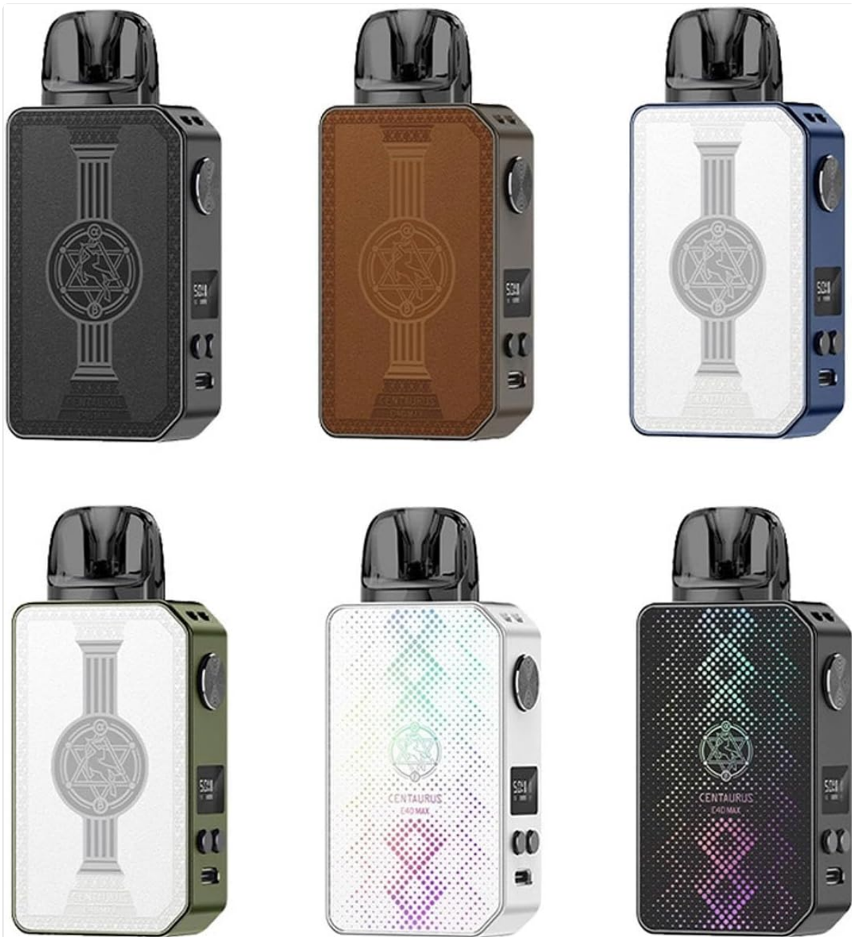
Image: Overview of the Lost Vape Centaurus E40 Max in multiple color variations. The image displays six different color options for the device, including solid colors like black, brown, blue, and green, as well as two versions with a gradient or speckled finish. Each device is shown with its pod attached, highlighting the compact design and the distinctive Centaurus branding on the main body.