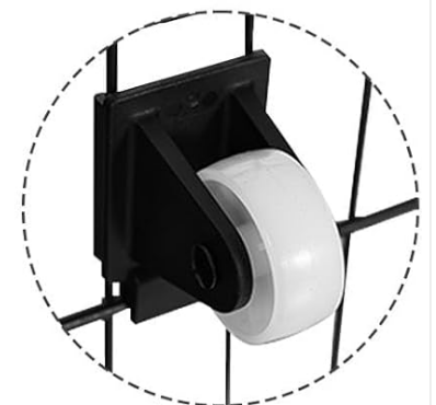
4 Under Drawers with Wheels