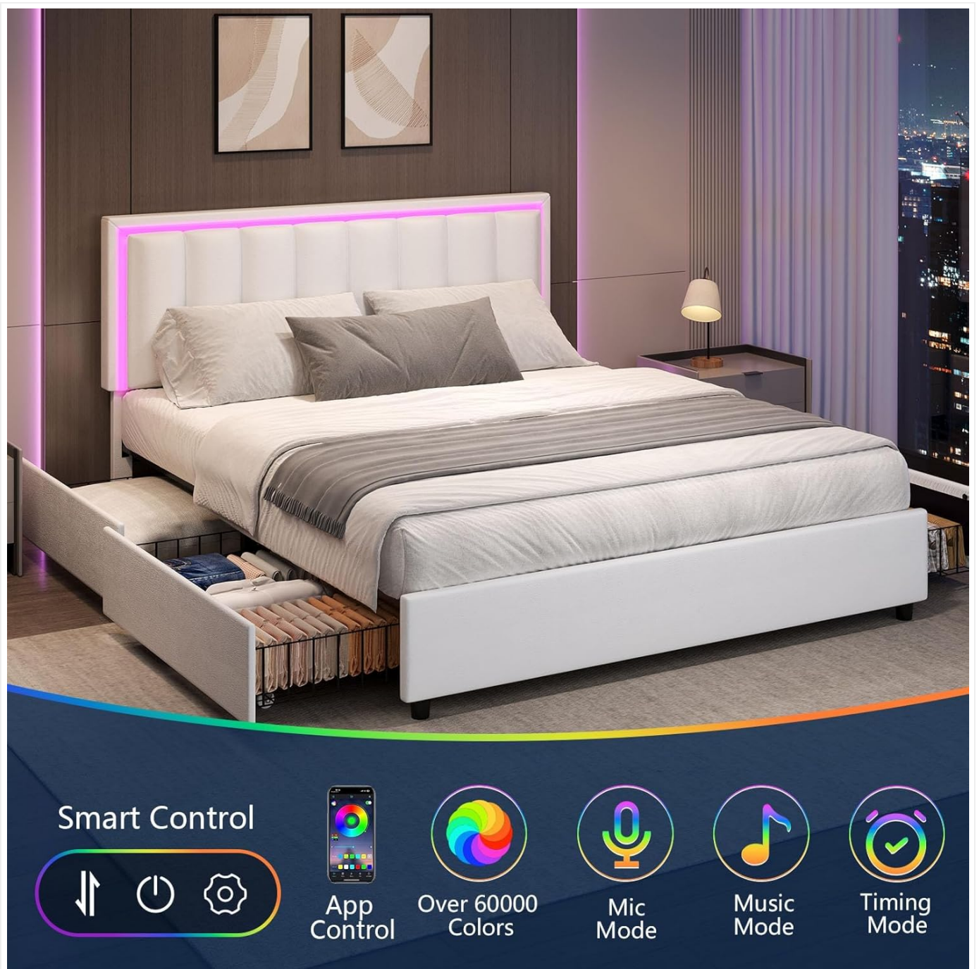
Figure 5: Smart Control Features of the LED Headboard. This graphic illustrates the various control options available through the mobile application, including app control, over 60,000 colors, mic mode, music mode, and timing functions.