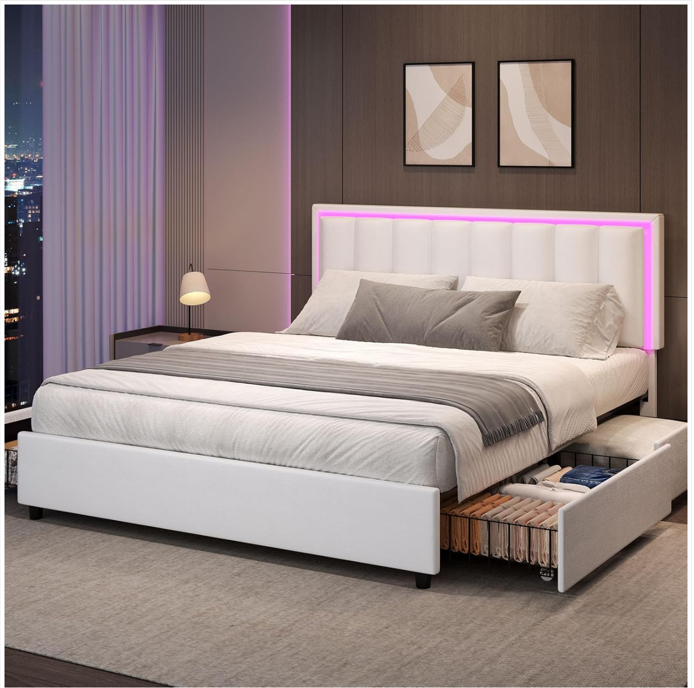
Figure 2: Assembled IMMERSTABLE Full Size Bed Frame. This image displays the complete bed frame in a bedroom setting, showcasing the upholstered headboard with illuminated LED lights and one of the four storage drawers pulled out, revealing stored items.