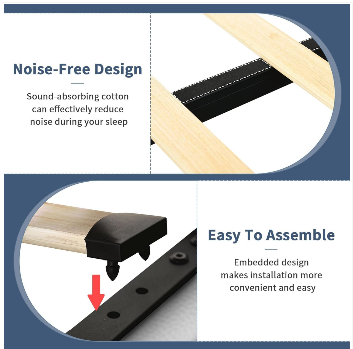
Figure 3: Noise-Free Design and Easy Assembly Details. This image highlights the sound-absorbing cotton for noise reduction and the