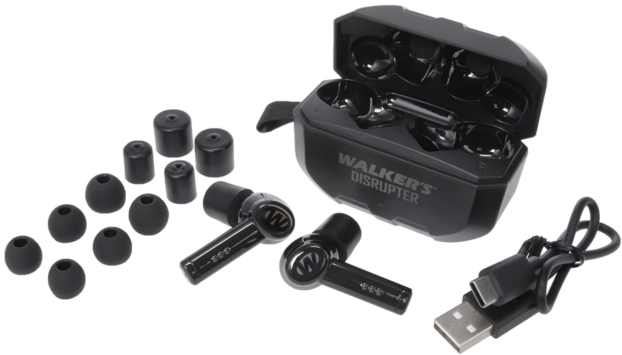
Image: All components included in the Walker's Disrupter Earbuds package: the earbuds, charging case, USB cable, and multiple sizes of foam and silicone ear tips.