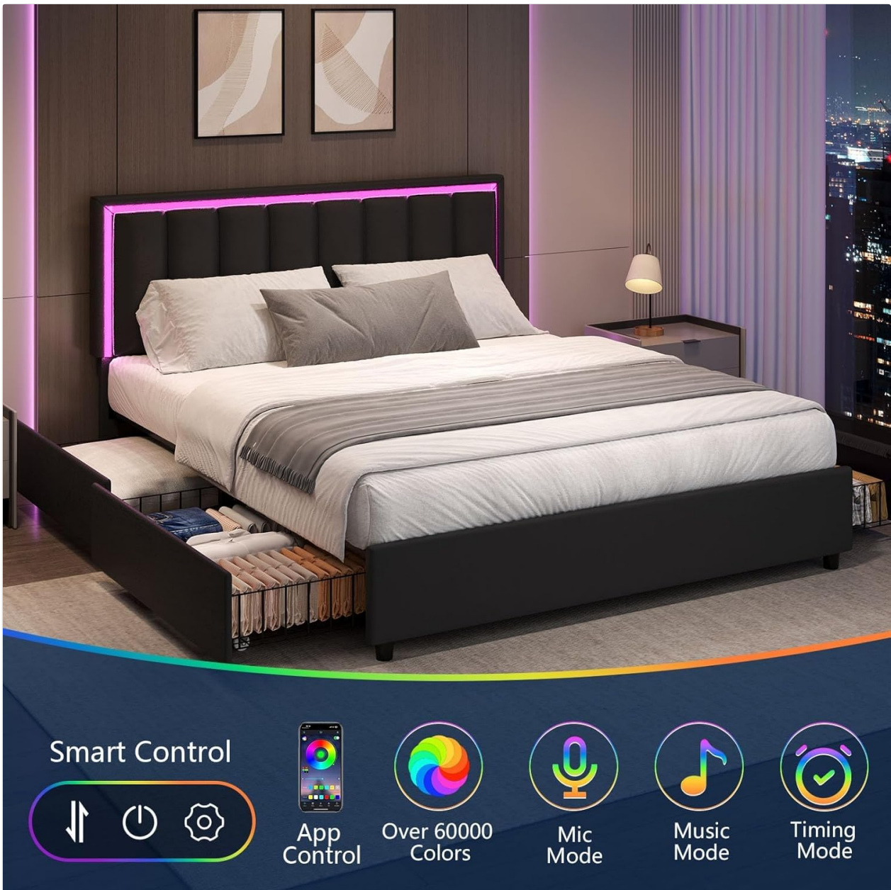
Figure 6.1: Overview of the smart control features for the LED headboard lights, including app control and various modes.