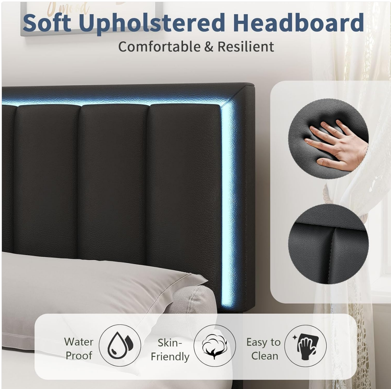
Figure 7.1: Features of the upholstered headboard, including its easy-to-clean and skin-friendly PU leather material.