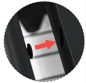
Locking Holes for Drawers