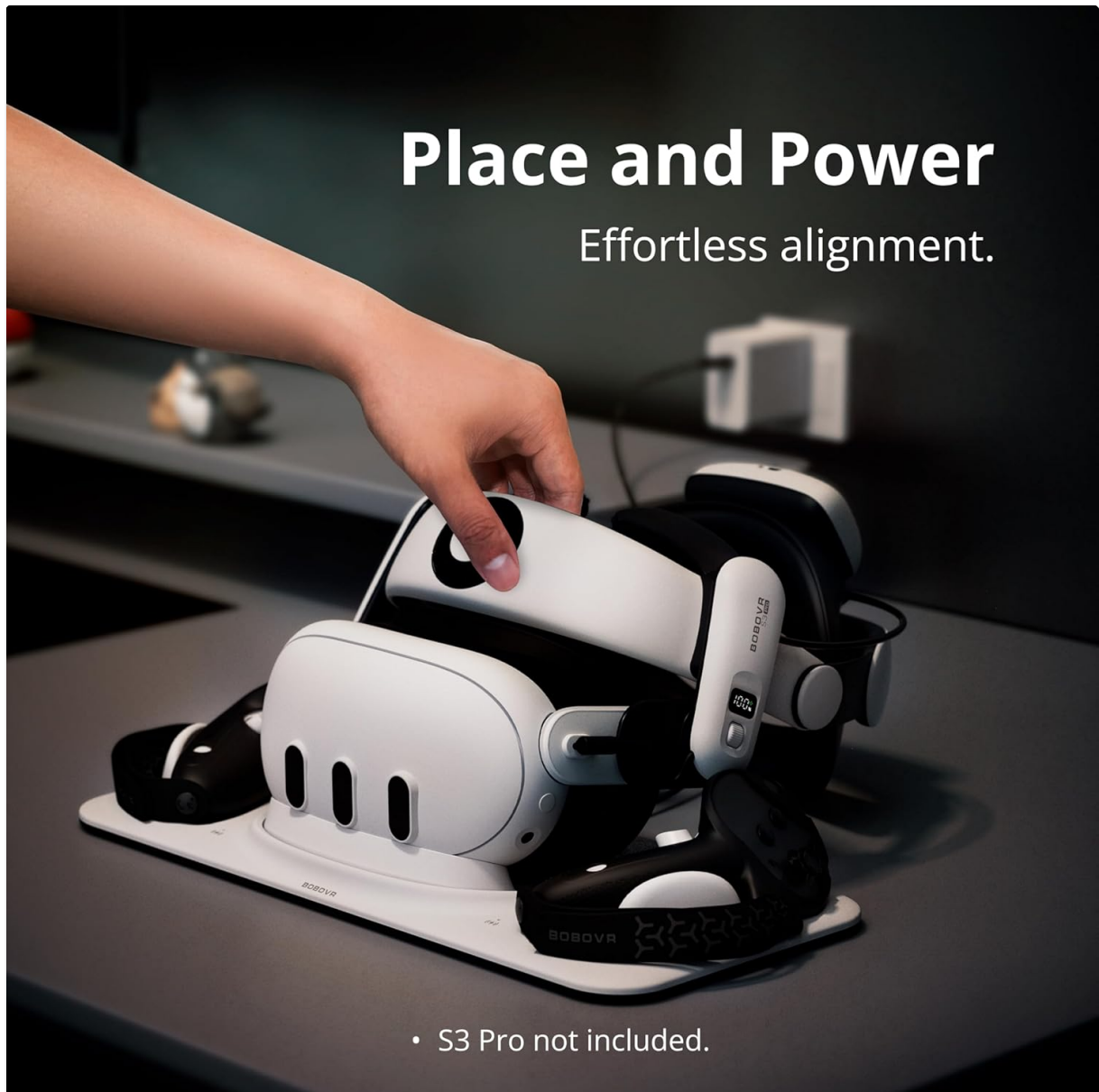
Image: Proper placement of the Quest 3 headset and controllers on the D3 Charging Dock for effortless alignment and charging.