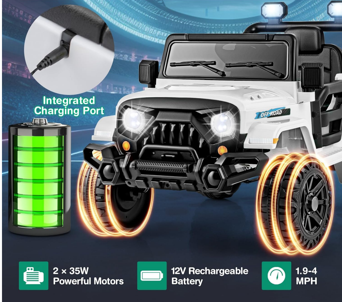
Image: Close-up of the integrated charging port and battery level indicator.