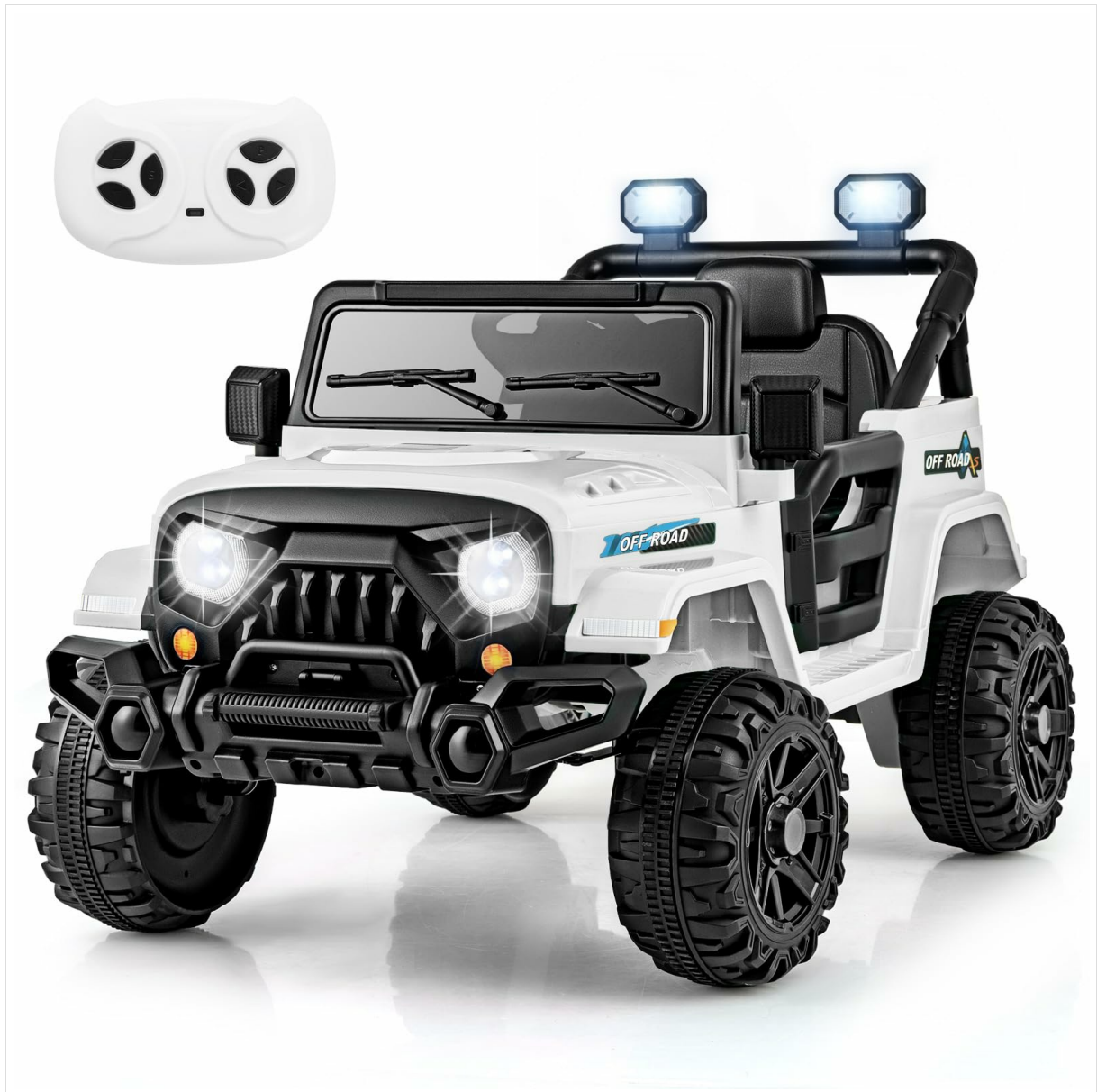
Image: The Costzon 12V Kids Ride on Truck Car, ready for assembly and use.