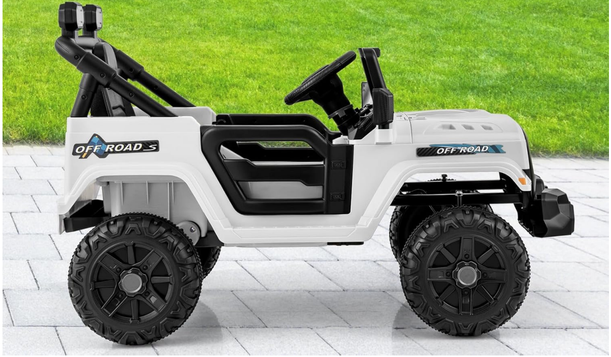
Image: Illustration of both Kids Driving Mode and Parental Remote Control Mode.