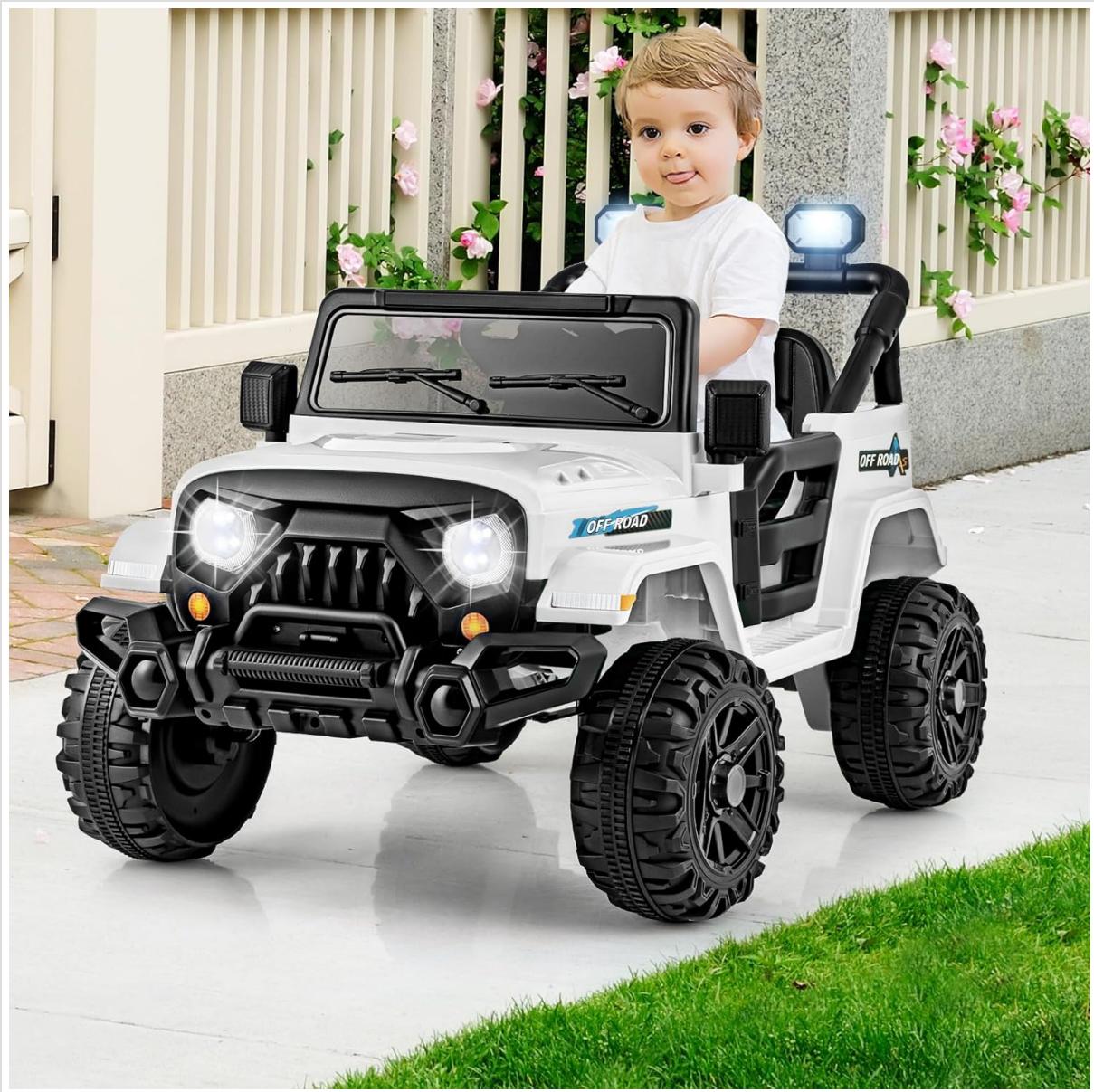
Image: Detail of the all-terrain wheels and various surfaces they can traverse.

Video: An overview of the Costzon 12V Kids Ride on Truck Car in operation, demonstrating its features.