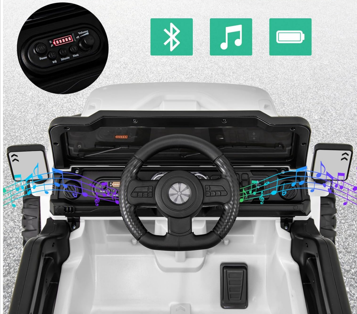
Image: View of the dashboard highlighting interactive entertainment features.