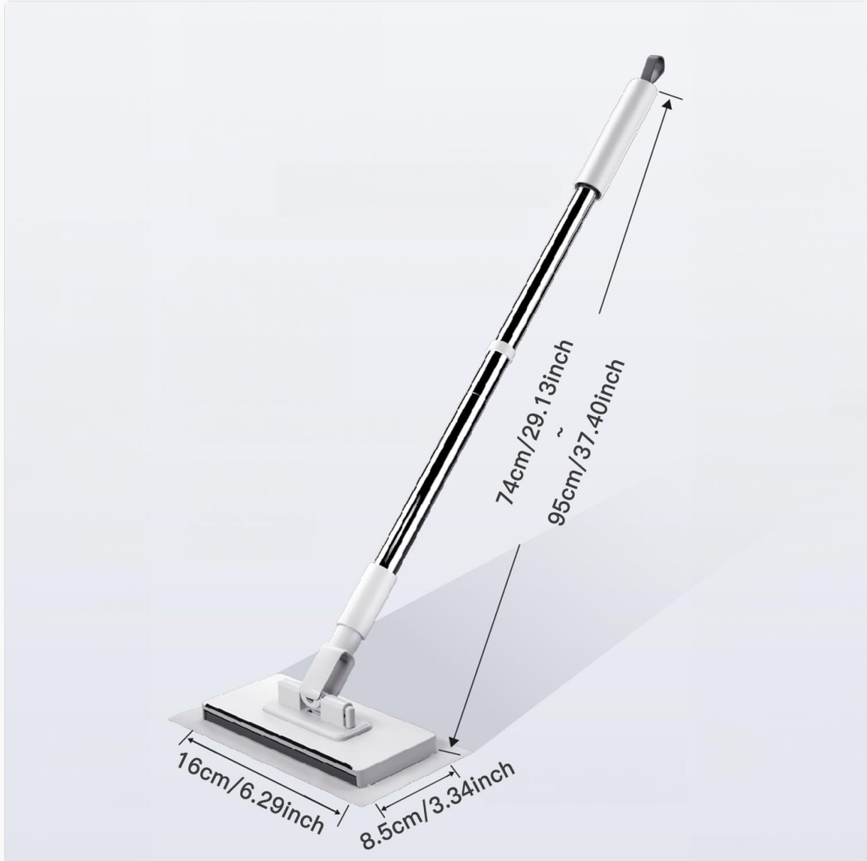
Figure 6: Product Dimensions