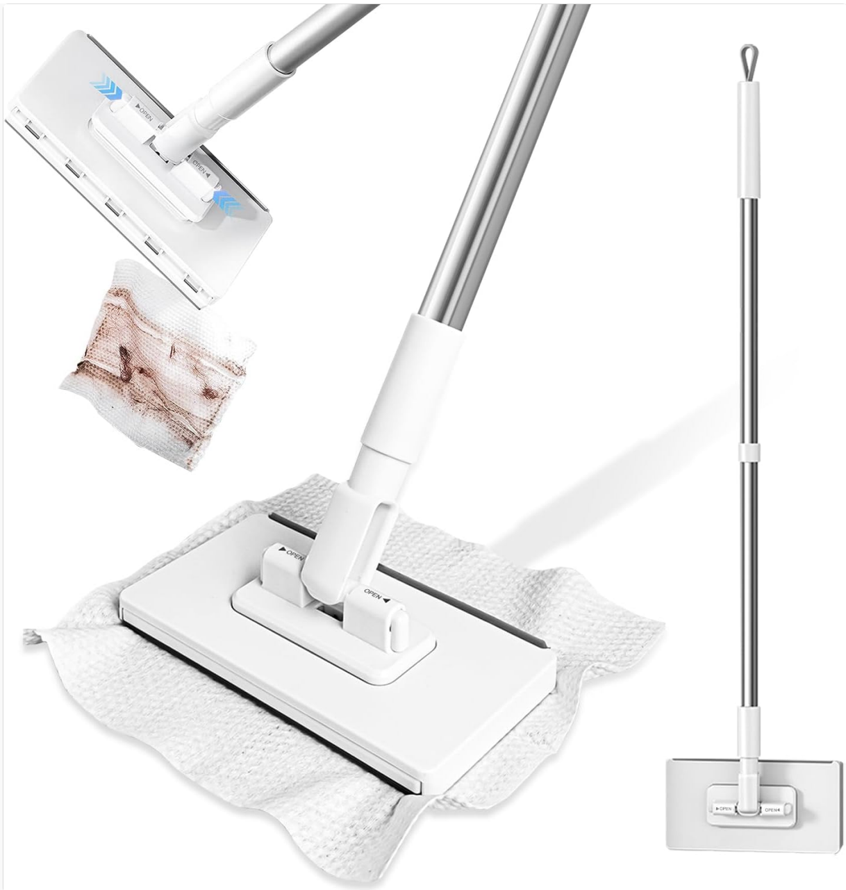
Figure 1: KZKR Snap Grip Mini Mop Overview