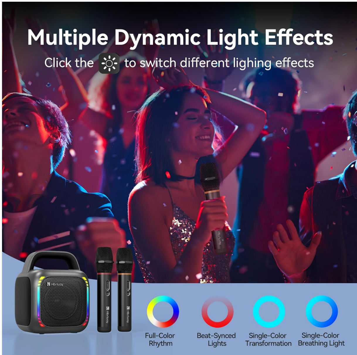
Image 6: Dynamic RGB lighting effects of the Hibriway K1 Karaoke Machine.