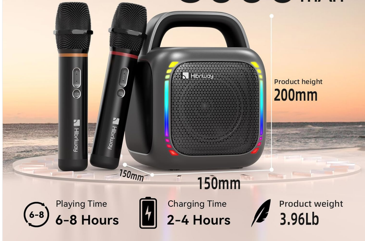
Image 2: Dimensions and battery specifications for the Hibriway K1 Karaoke Machine and microphones.