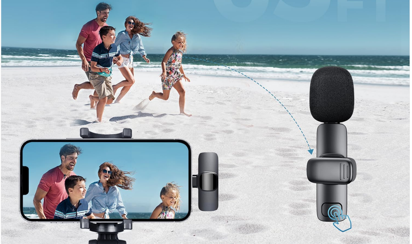
Image: An illustration depicting the microphone's 65-foot ultra-long distance transmission range, showing a family on a beach with the microphone and phone recording from a distance.