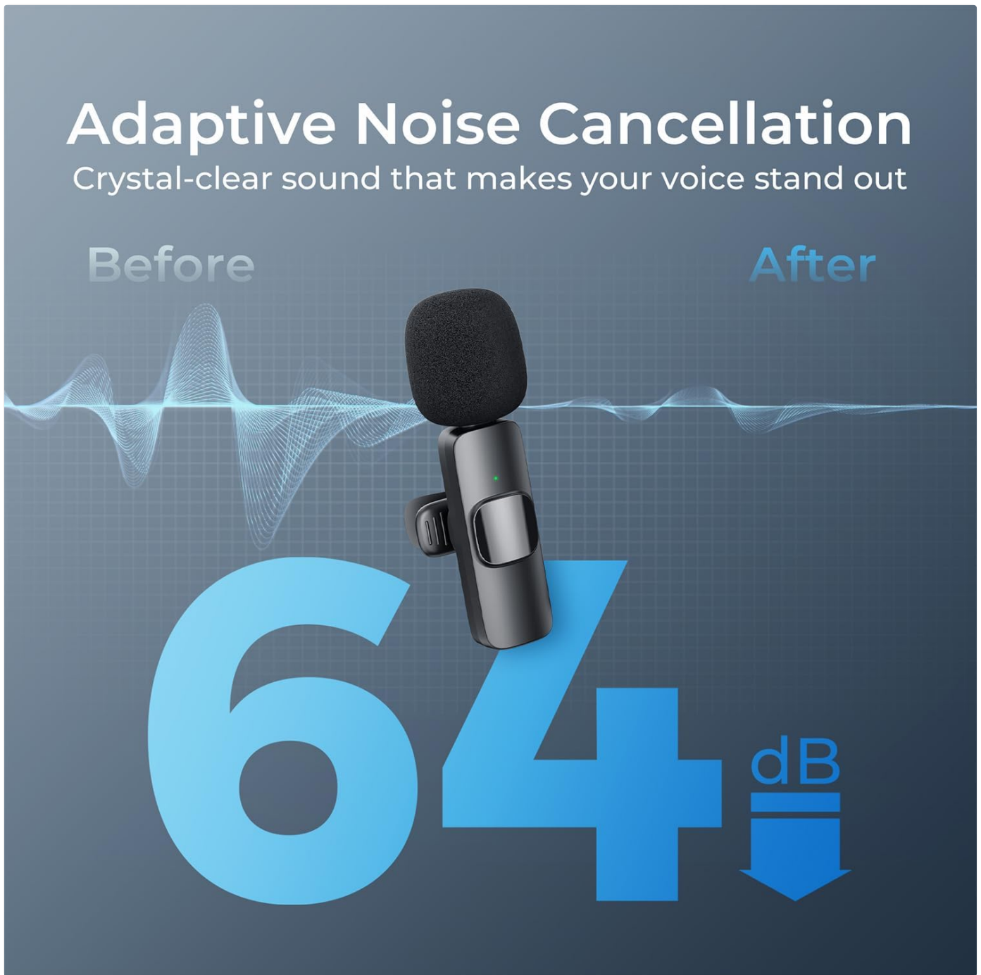
Image: A graphic illustrating the 64 dB adaptive noise cancellation capability of the microphone, showing a "Before" and "After" sound wave comparison.

The YRF Wireless Lavalier Microphone K3 features adaptive noise cancellation technology, designed to reduce ambient background noise by up to 64 dB, ensuring clear audio capture in various environments.