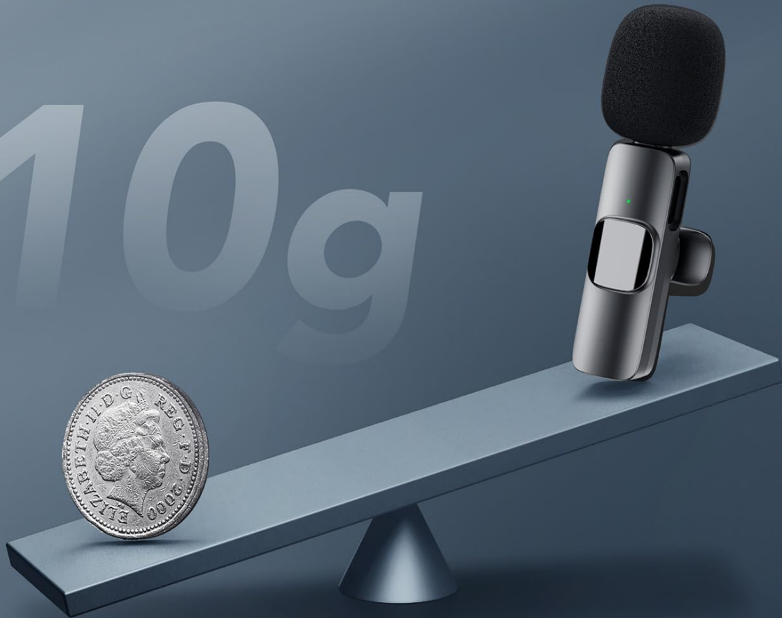
Image: A visual representation of the microphone's light weight, showing it balanced against a coin, indicating it weighs approximately 10 grams.