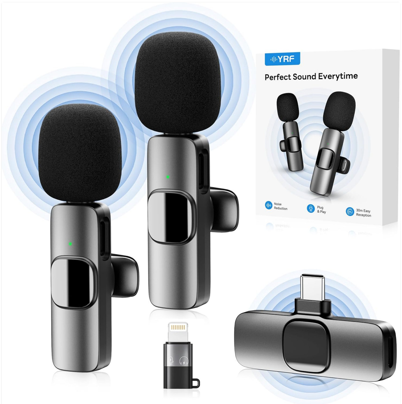
Image: The YRF Wireless Lavalier Microphone K3 system, including two microphones, a USB-C receiver, a Lightning receiver, and the product packaging.