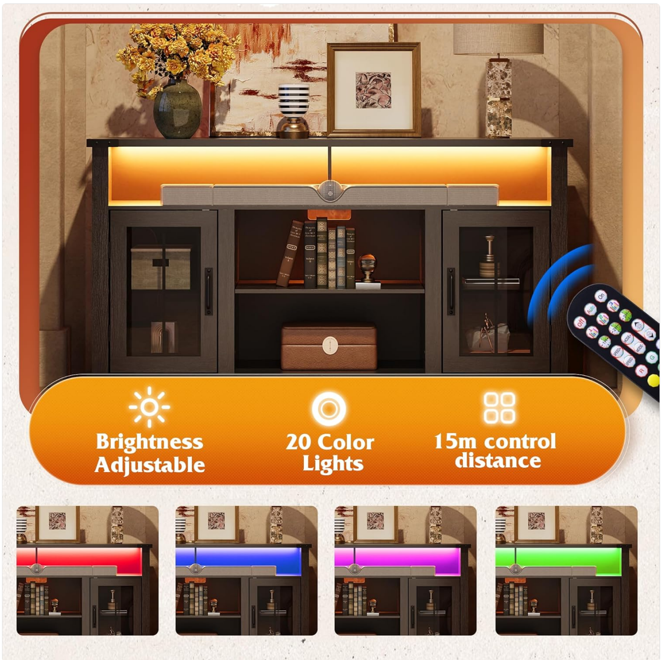
Image: Visual representation of the LED light features, including brightness adjustment, 20 color options, and control distance, along with the remote control.