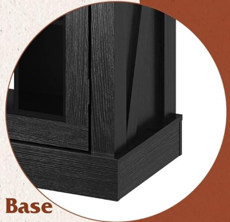
Image: Close-up views highlighting the top open shelf, retro metal decor accents, and the 3-inch thickened base for stability.

3 Inch Thickened Base Provides excellent stability