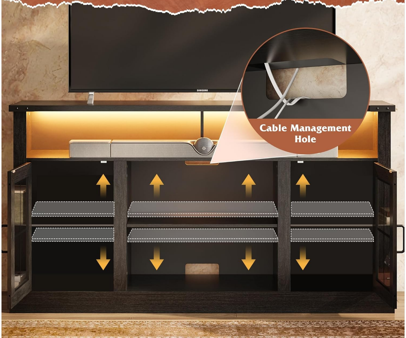
Image: Illustration showing the 3-level adjustable shelves and integrated cable management holes for organized wiring.

Video: A demonstration of the TV stand's features, including its design and practical elements.