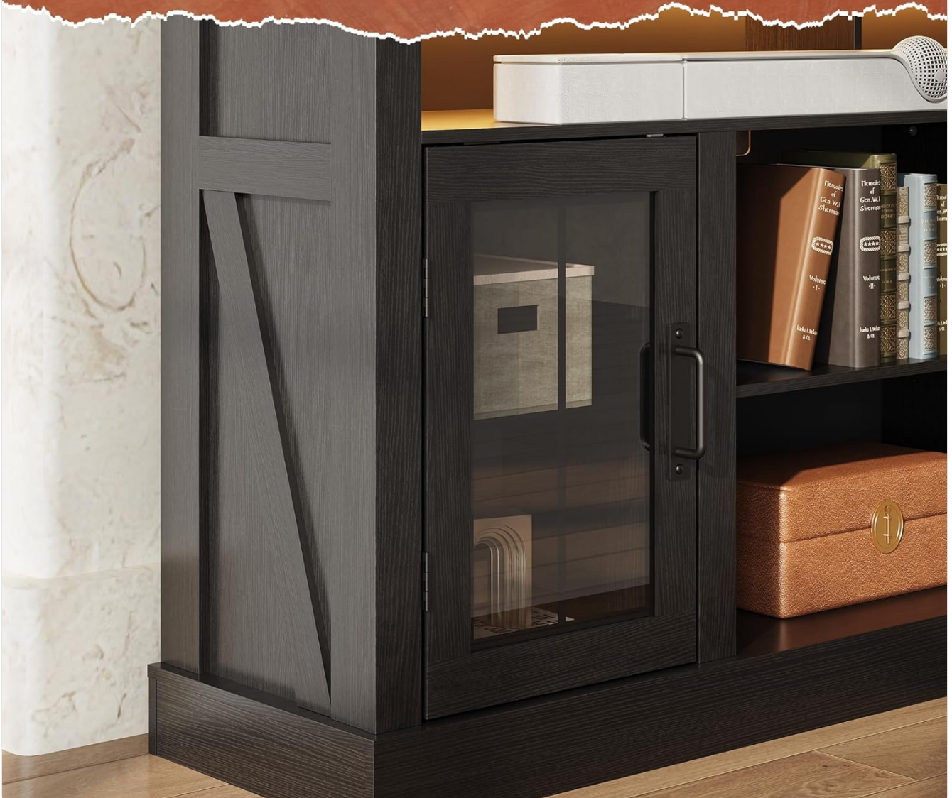
Image: A detailed view of the high-transparency glass cabinet door, designed for unobstructed signal reception for remote-controlled devices.

High-transparency glass, unobstructed signal reception