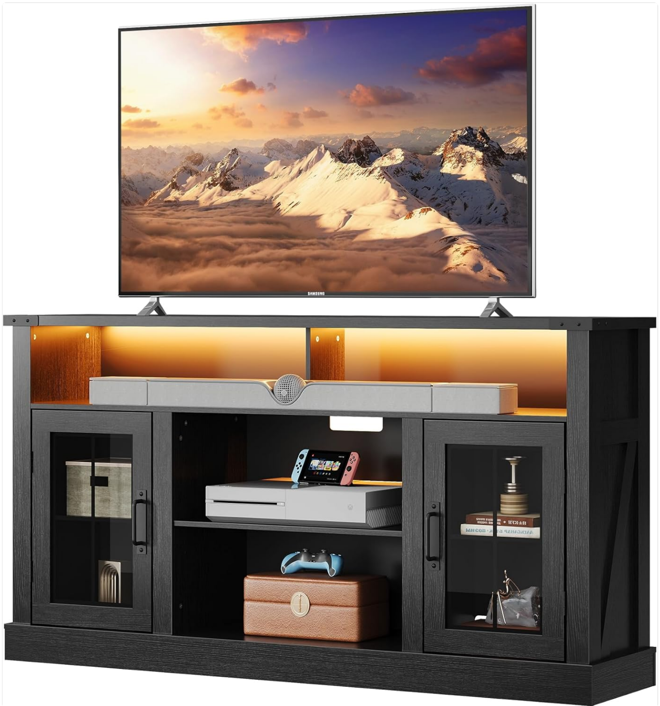
Image: The WLIVE Farmhouse TV Stand in black, featuring a large television on its top surface, showcasing its design and functionality.