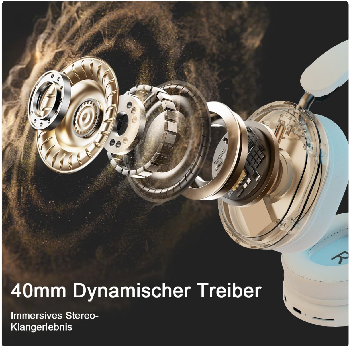
Image: An exploded view of the SUNJOM Inspire headphone earcup, showcasing the internal 40mm dynamic driver responsible for immersive stereo sound.