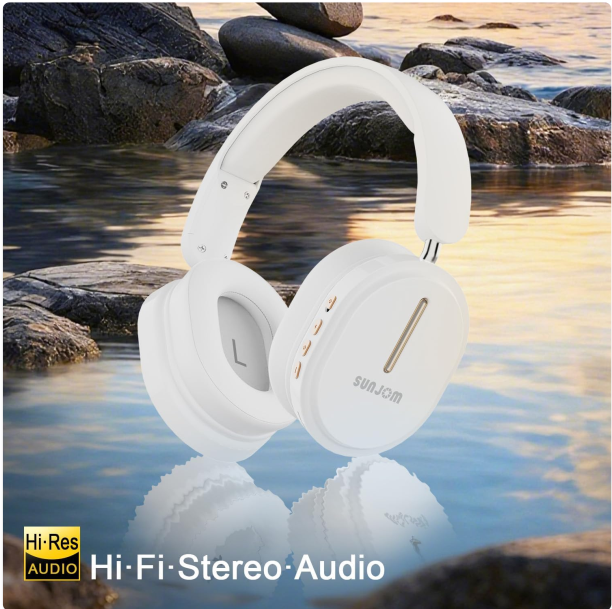
Image: The SUNJOM Inspire headphones in white, positioned over water, with a graphic indicating Hi-Res Audio and Hi-Fi Stereo Audio capabilities.