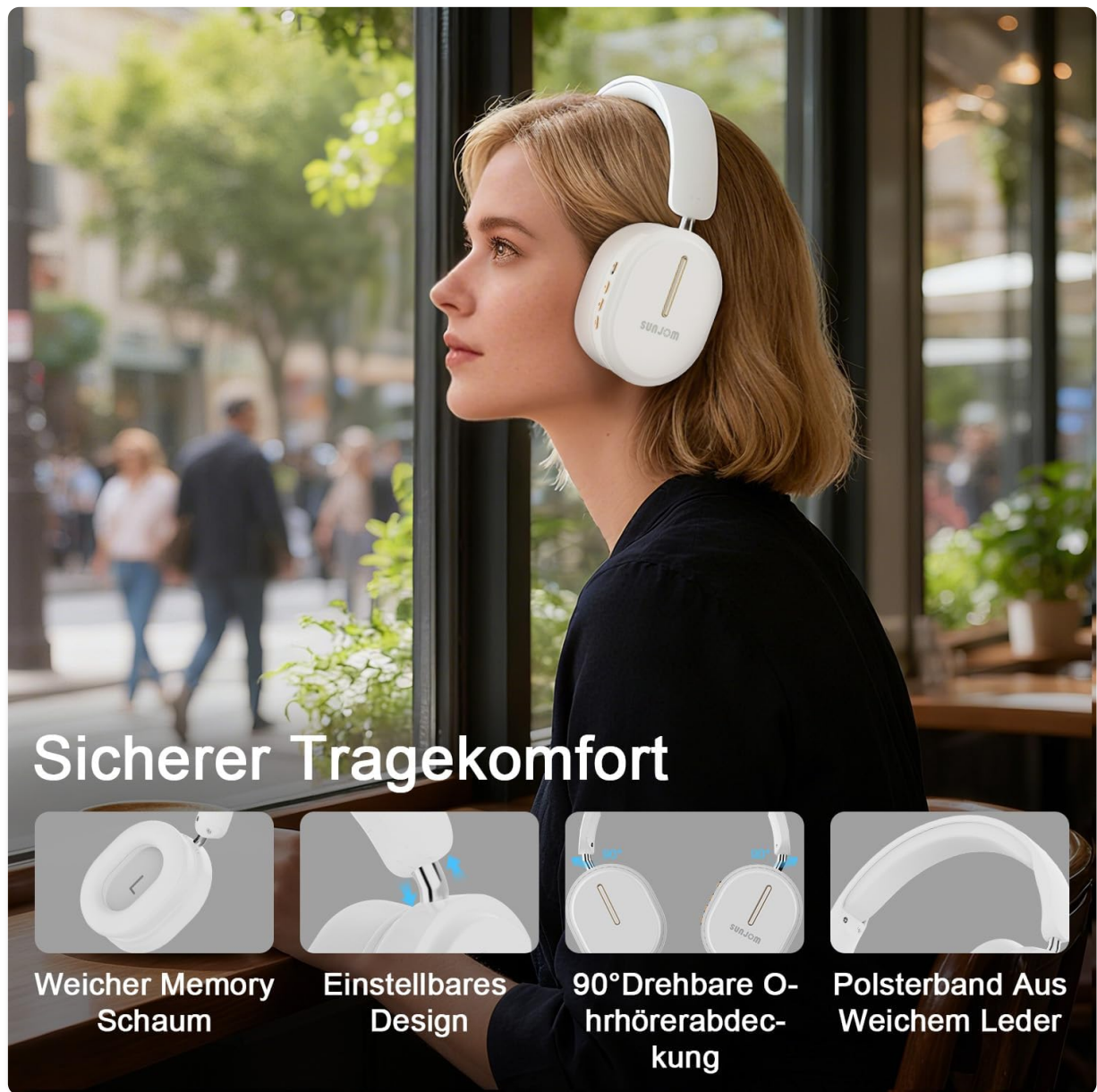
Image: The SUNJOM Inspire headphones highlighting comfort features such as soft memory foam earcups, an adjustable headband, 90-degree rotatable earcups, and a soft leather headband for secure and comfortable wear.