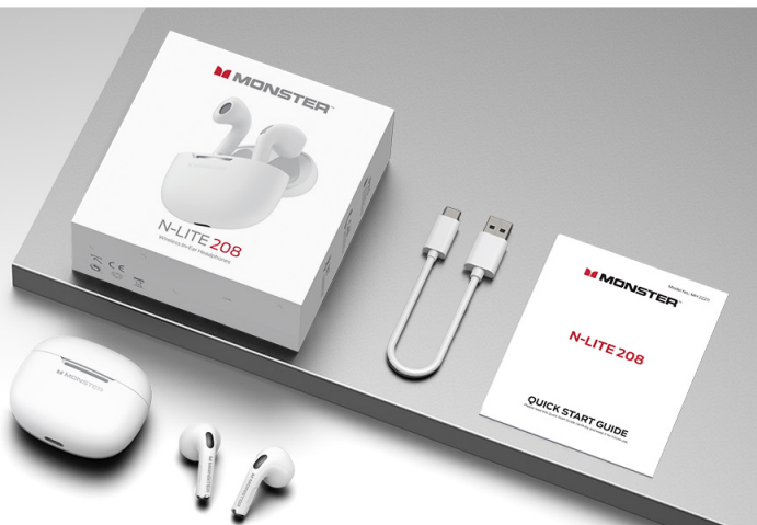
Image: Contents of the Monster N-Lite 208 Wireless Earbuds packaging.

2 X Bluetooth Headphones 1 X Charging Case 1 X USB-C Cable 1 X User Manual