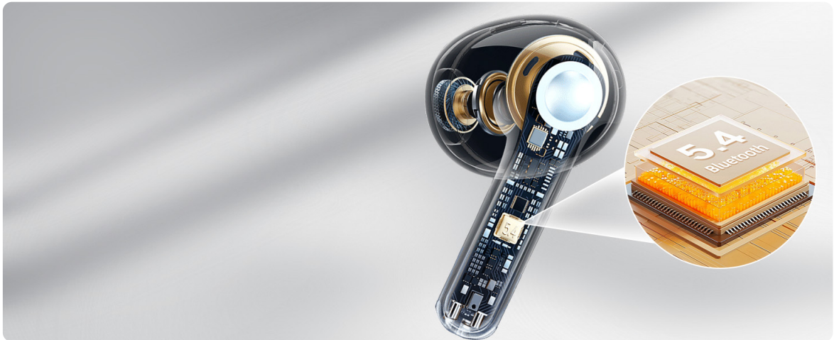
Image: Bluetooth 5.4 technology for stable and efficient connection.