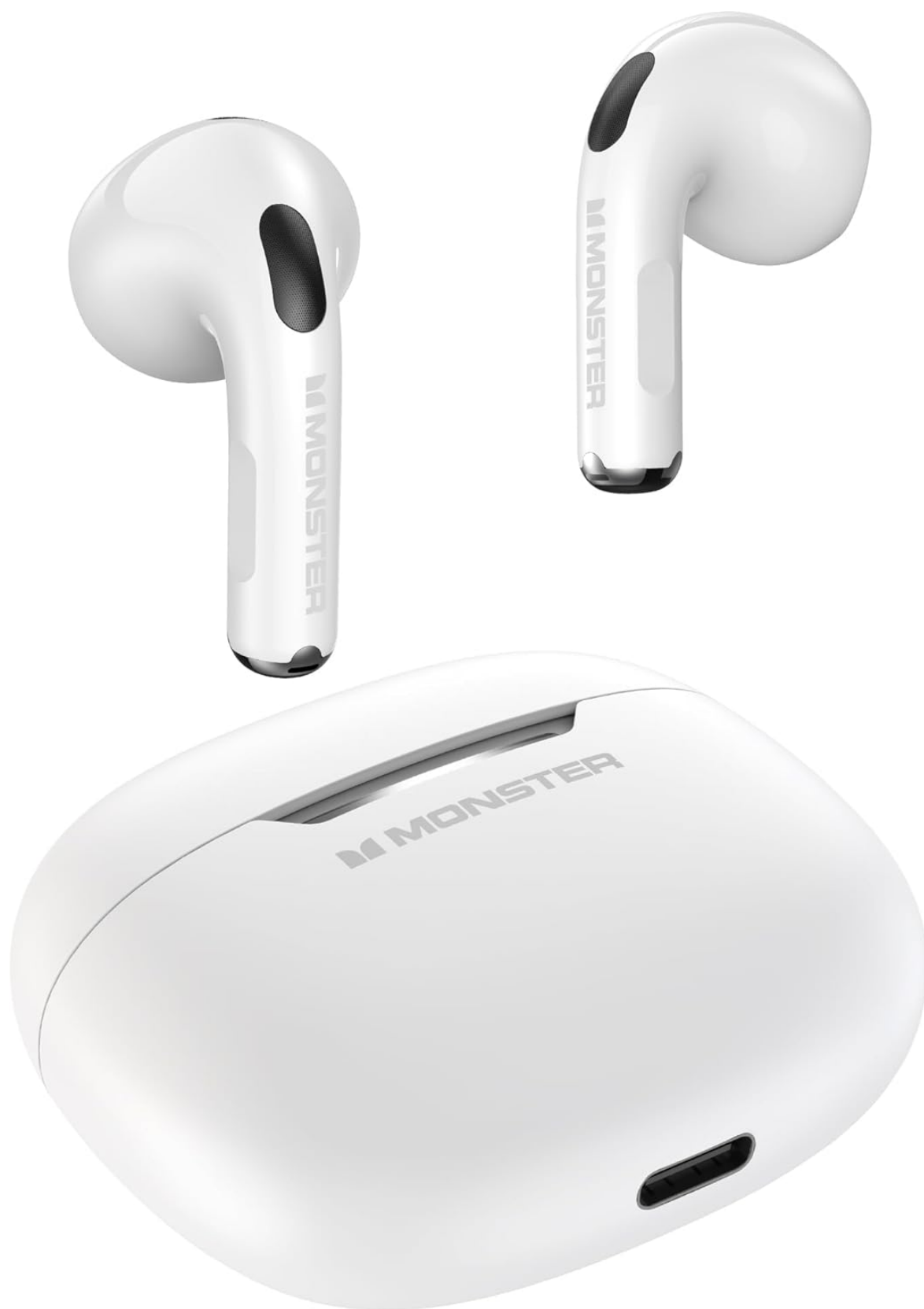
Image: The Monster N-Lite 208 Wireless Earbuds and their charging case.