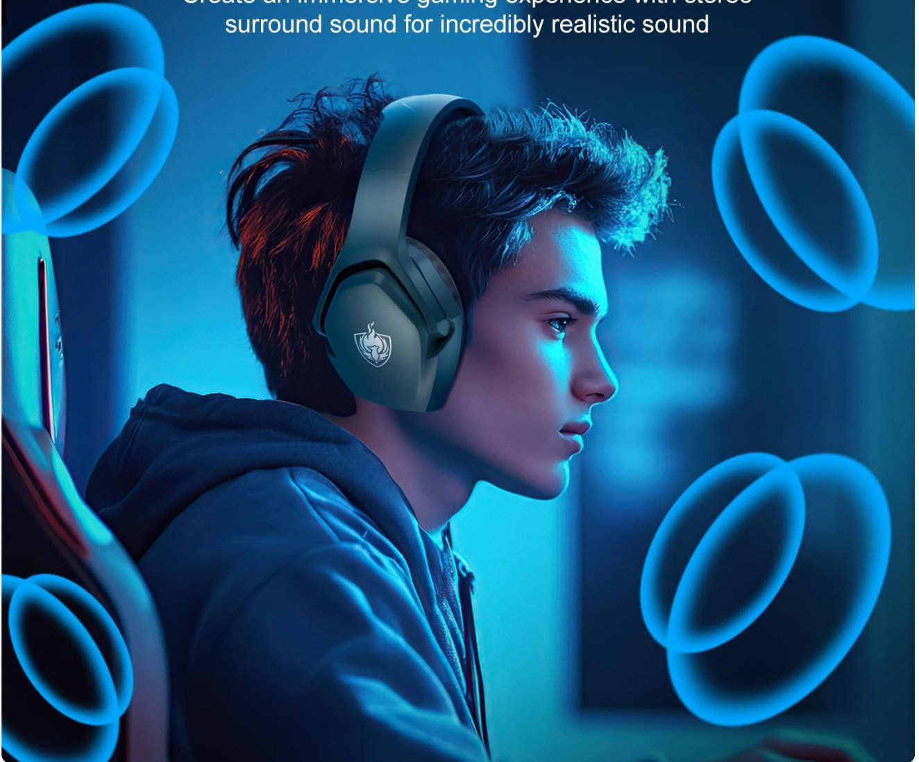
Image: A person wearing the headset, surrounded by visual representations of sound waves, highlighting the 7.1 surround sound feature.

Create an immersive gaming experience with stereo surround sound for incredibly realistic sound