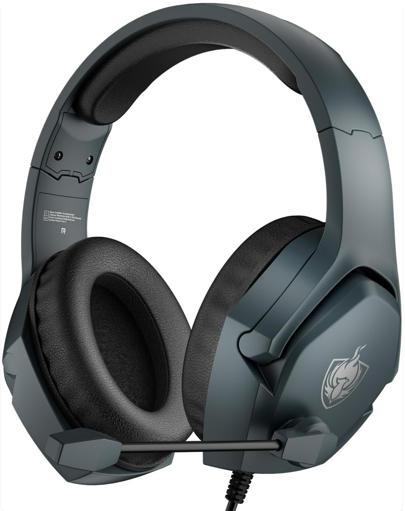
Image: PHOINIKAS Gaming Headset (Grey) with its flexible microphone arm.