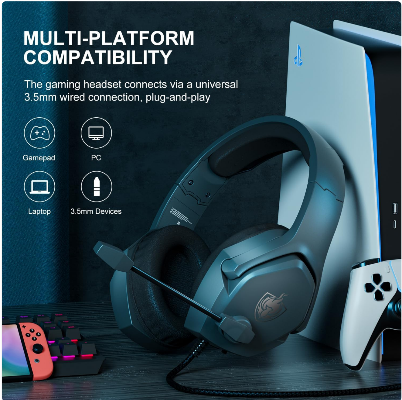
Image: Diagram illustrating the headset's compatibility with gamepads, PCs, laptops, and other 3.5mm devices.