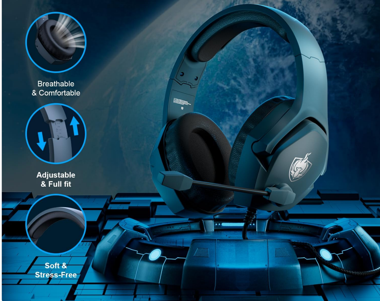
Image: Close-up views of the headset's breathable earcups, adjustable headband, and soft, stress-free padding, highlighting its comfortable design.