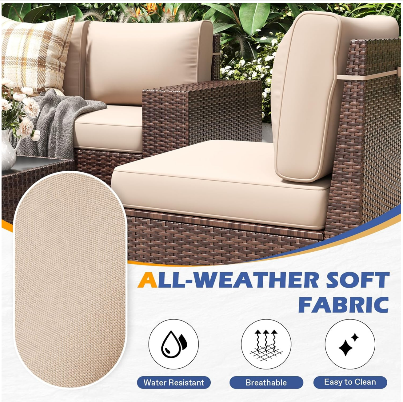
Image 6.2: Detail of the all-weather soft fabric used for the cushions, highlighting its water-resistant, breathable, and easy-to-clean properties.