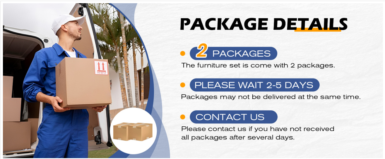
Image 3.1: Illustration of package details, indicating the furniture set ships in two separate boxes.

Note: The furniture set is shipped in 2 packages. These packages may not be delivered at the same time. Please wait 2-5 days for all packages to arrive. If you have not received all packages after several days, please contact customer support.