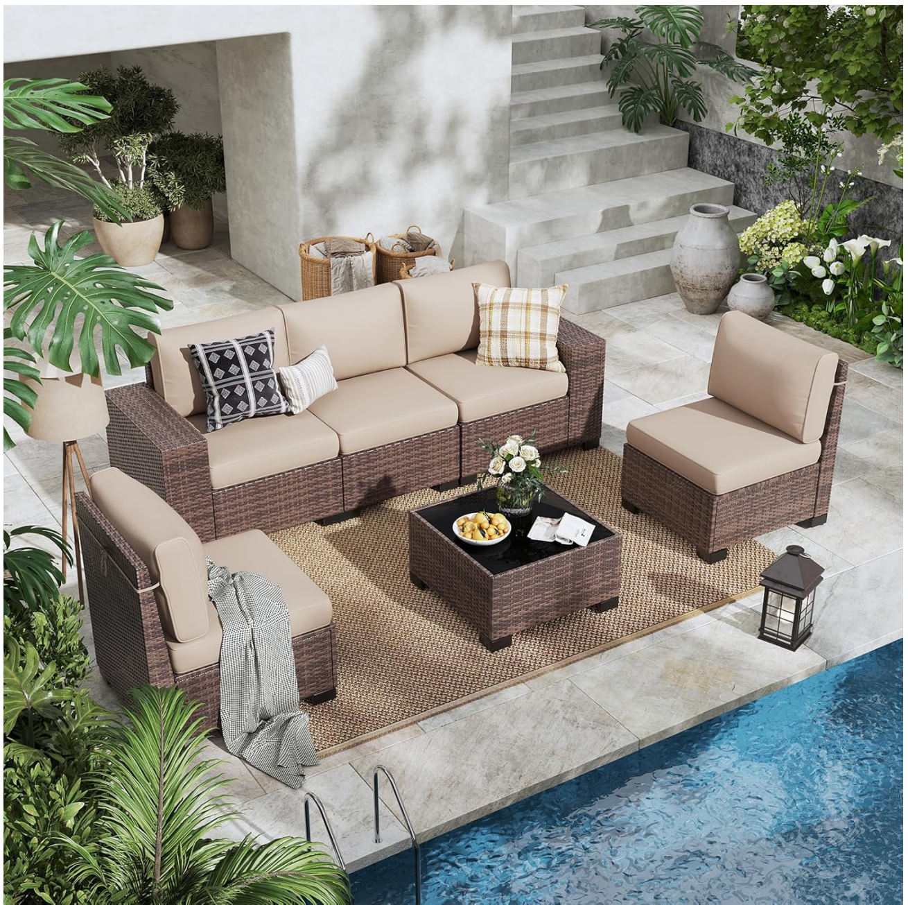
Image 1.1: Overview of the ELPOSUN 6-Piece Outdoor Patio Furniture Set, featuring brown rattan and beige cushions, arranged on a patio next to a pool.