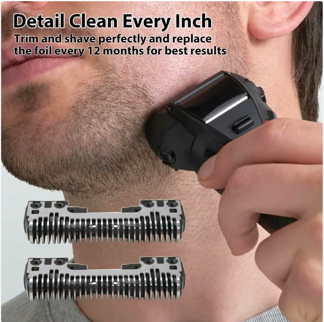
Image: A man meticulously shaving his beard, emphasizing the importance of detailed cleaning and replacing the foil every 12 months for optimal results.

Trim and shave perfectly and replace the foil every 12 months for best results