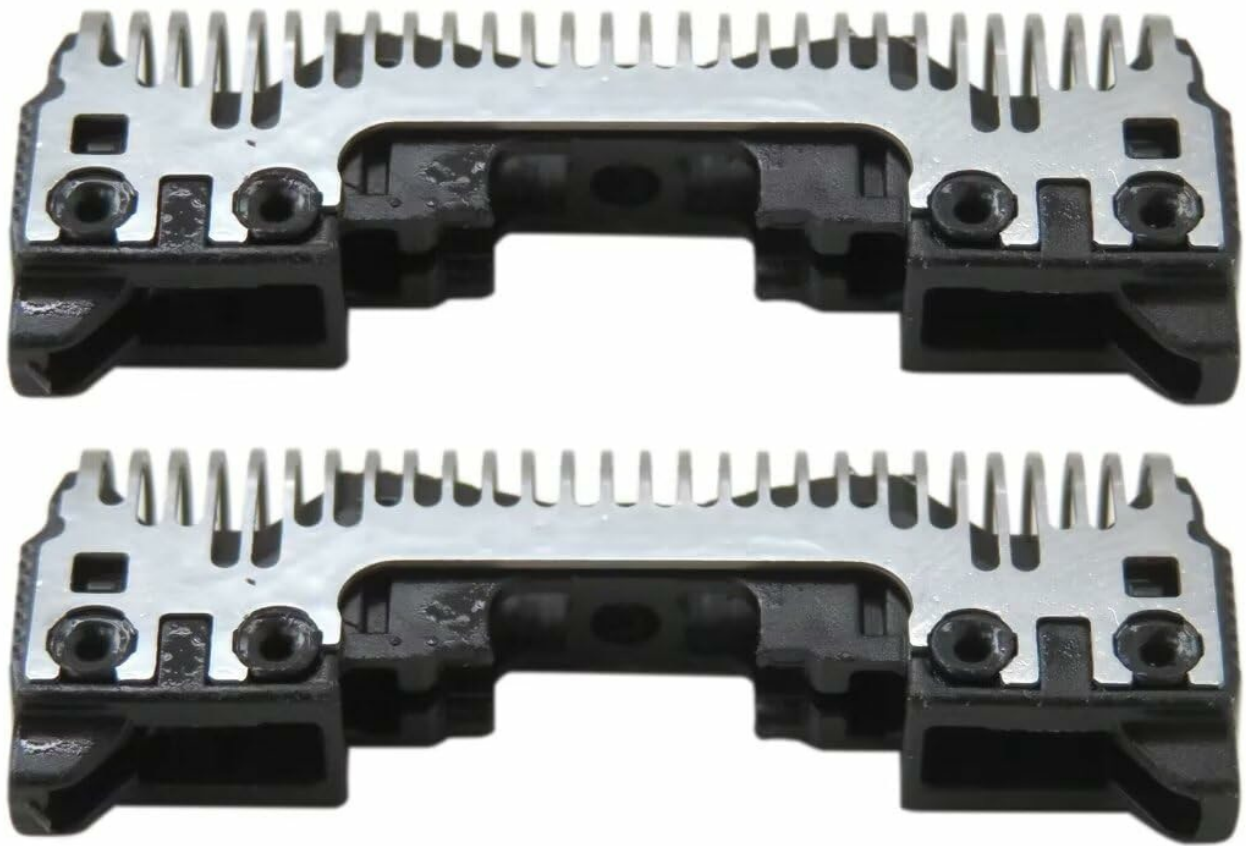
Image: Two YTXDEUS WES9064P/WES9064 replacement inner cutter blades, showcasing their design.