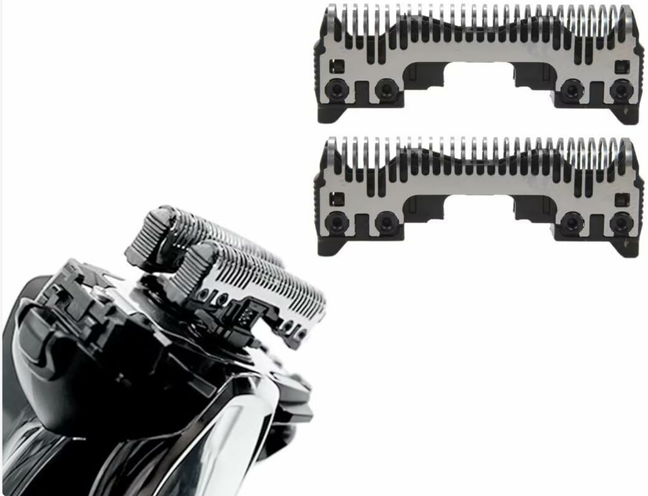
Image: Step-by-step visual guide demonstrating the removal of old blades and insertion of new ones into a shaver head.

Grab the old blades firmly on both ends and pull them straight out of the razor one at a time. To insert the new inner blade, hold the blade at both ends at once and press down until the blade snaps into the razor.