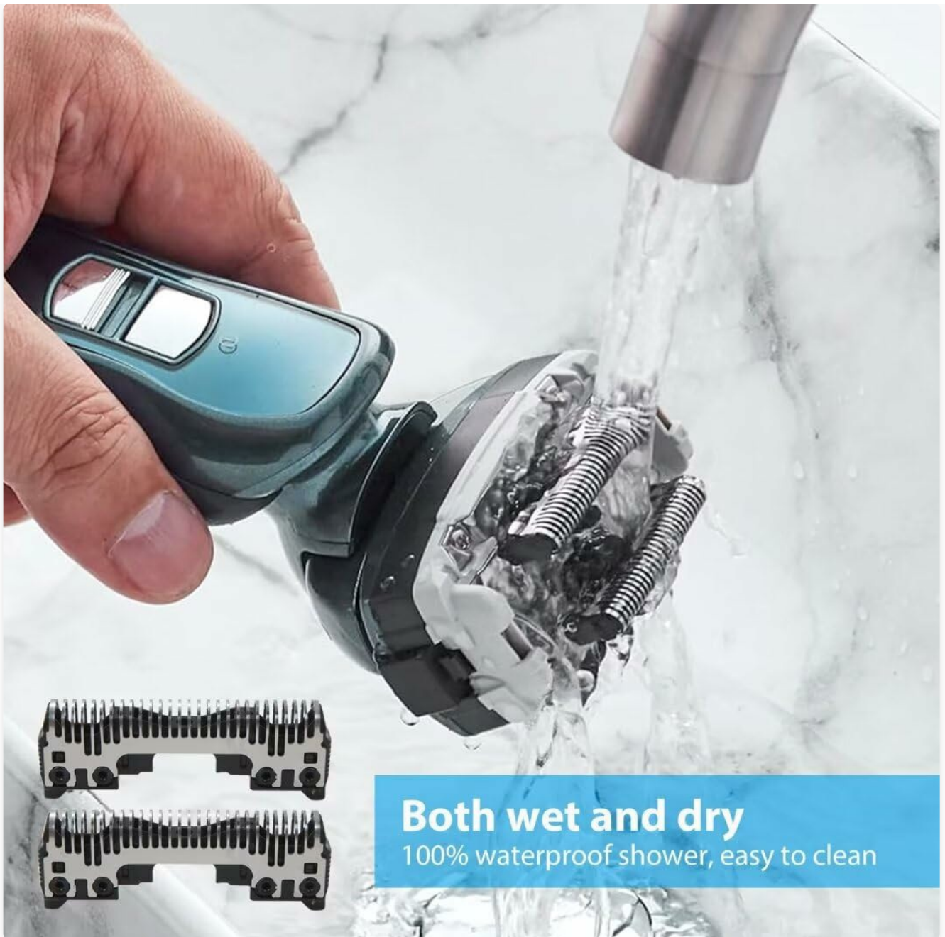
Image: A hand demonstrating rinsing an electric shaver head under a faucet, highlighting its waterproof design and ease of cleaning.