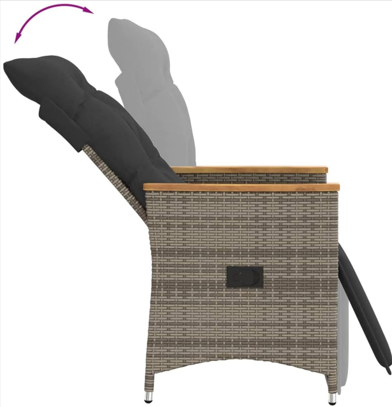
Image 5.3: Visual representation of the chair's reclining movement.