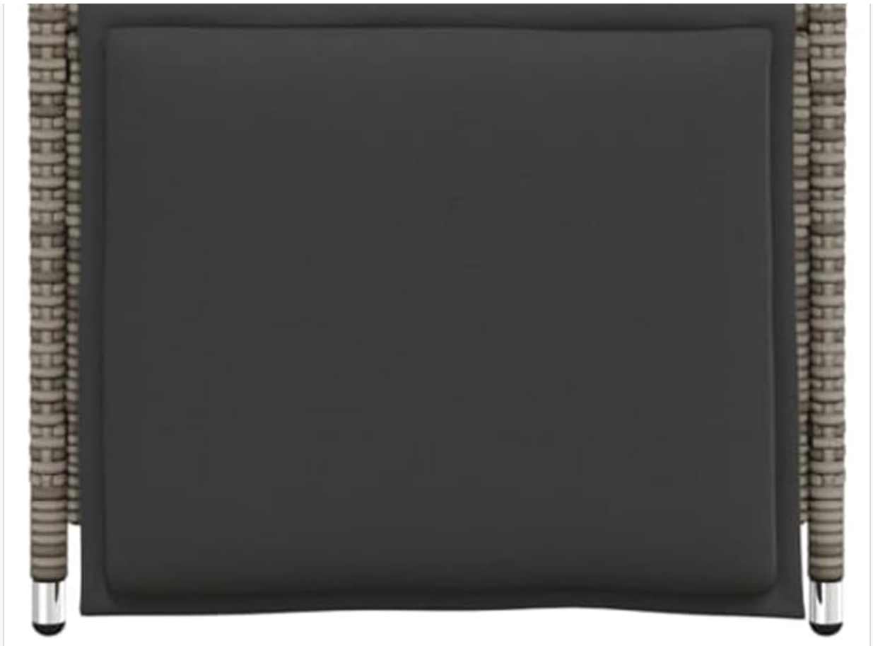
Image 4.1: Front view of the ZEYUAN Reclining Garden Chair, ready for cushion placement.