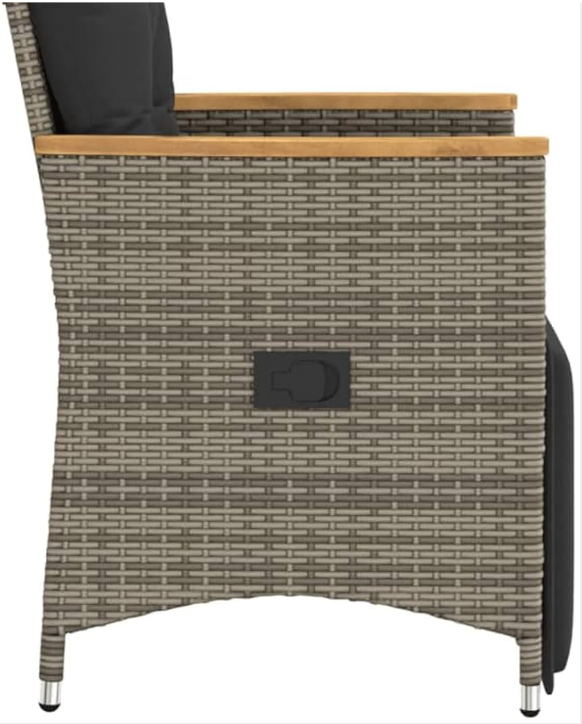
Image 5.1: Side view illustrating the location of the reclining handle.