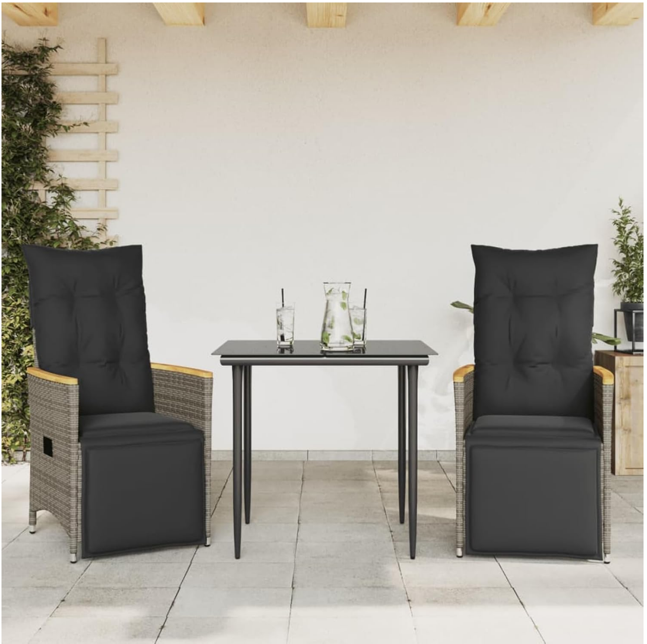
Image 1.1: Overview of the ZEYUAN Reclining Garden Chairs set on a patio.