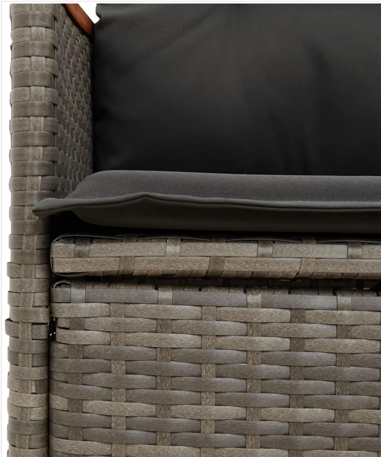
Image 6.1: Detail of the cushion and polyrattan material, highlighting areas for cleaning.