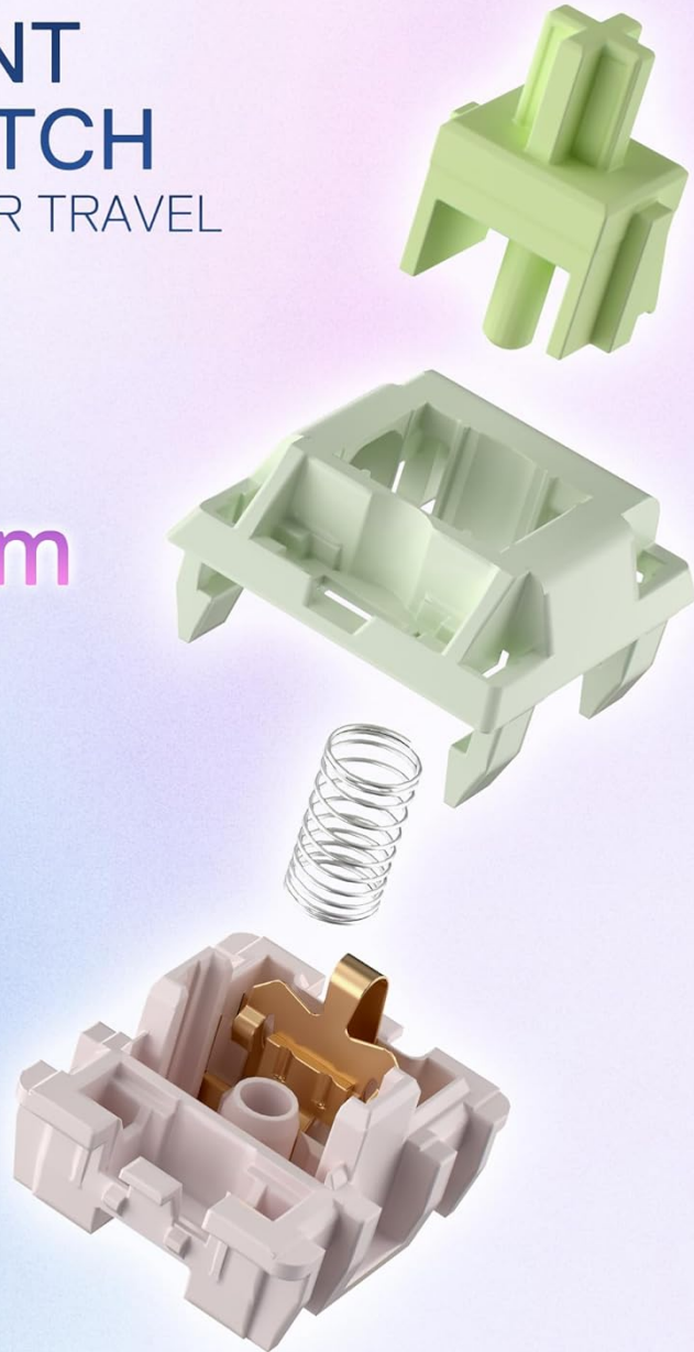
Image: Detailed specifications for the Custom Mint Mambo Switch, including actuation travel (2.0±0.5 mm), actuation force (40±10 gf), and total travel (3.60 mm).