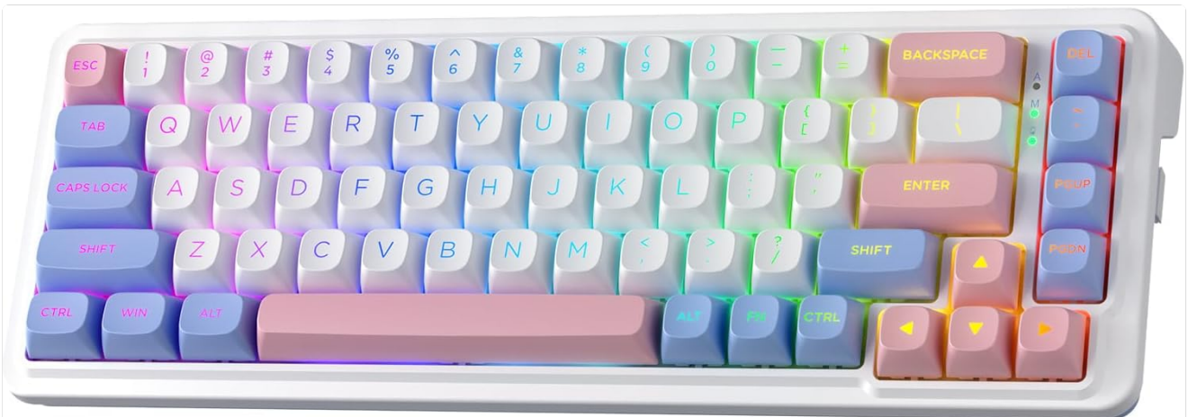
Image: The Redragon K709 PRO keyboard, showcasing its compact 65% layout and vibrant RGB backlighting with pink, blue, and white keycaps.

The Redragon K709 PRO is a compact 65% wireless gaming keyboard designed for enhanced typing comfort and performance. Featuring a gasket-mounted structure and 5-layer noise dampening, it provides a soft, quiet, and responsive typing experience. This keyboard supports tri-mode connectivity (USB-C wired, Bluetooth, and 2.4GHz wireless) and is equipped with hot-swappable Mint Mambo linear switches and durable PBT keycaps. This manual provides essential information for setting up, operating, maintaining, and troubleshooting your K709 PRO keyboard.