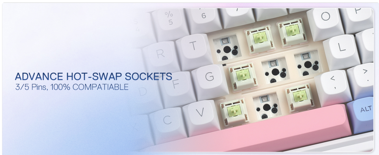
Image: A close-up view of the Redragon K709 PRO's hot-swappable sockets, showing switches removed and ready for replacement.