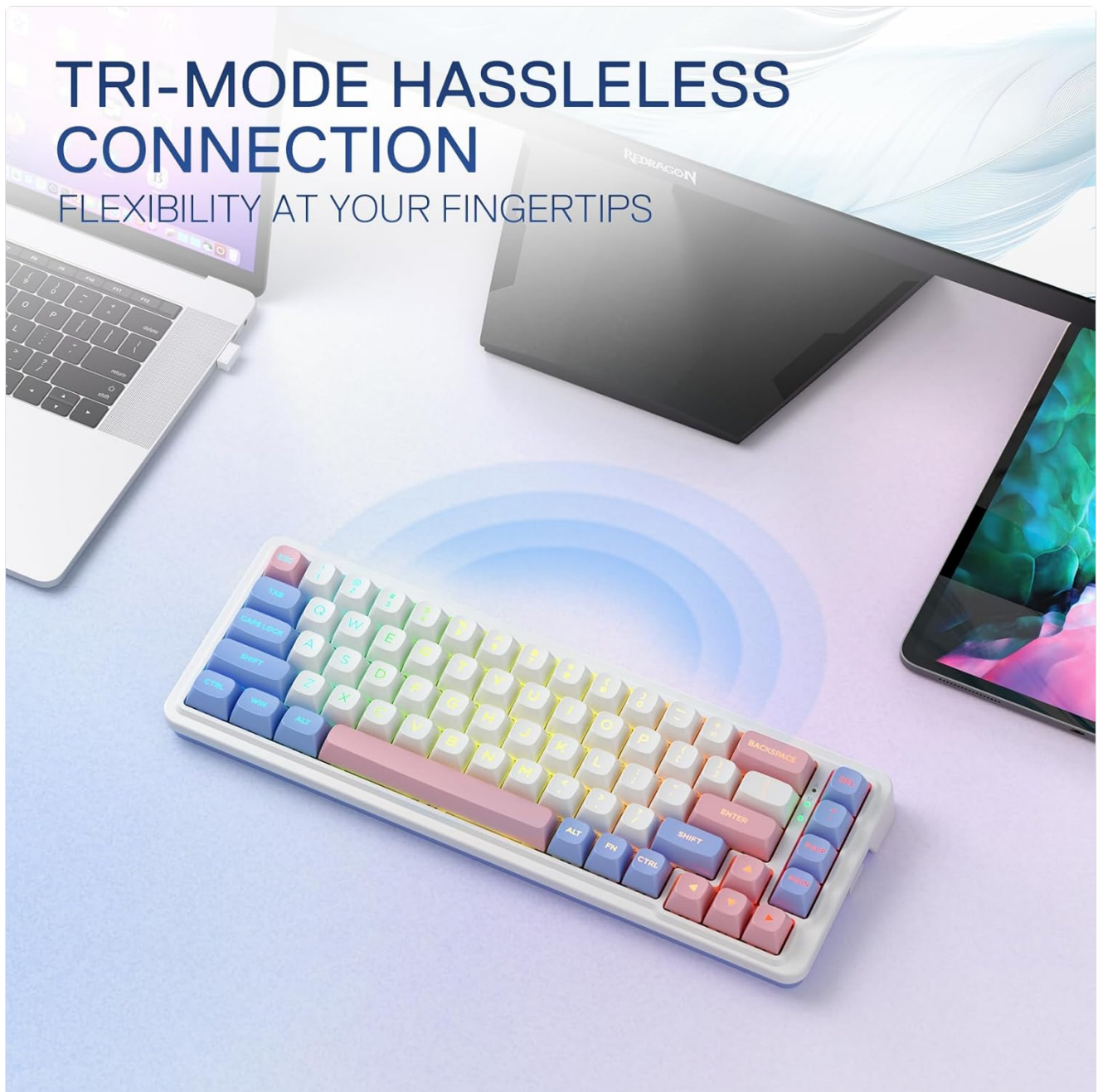
Image: The Redragon K709 PRO keyboard demonstrating its tri-mode connection capability, shown connected to a laptop, tablet, and desktop setup.