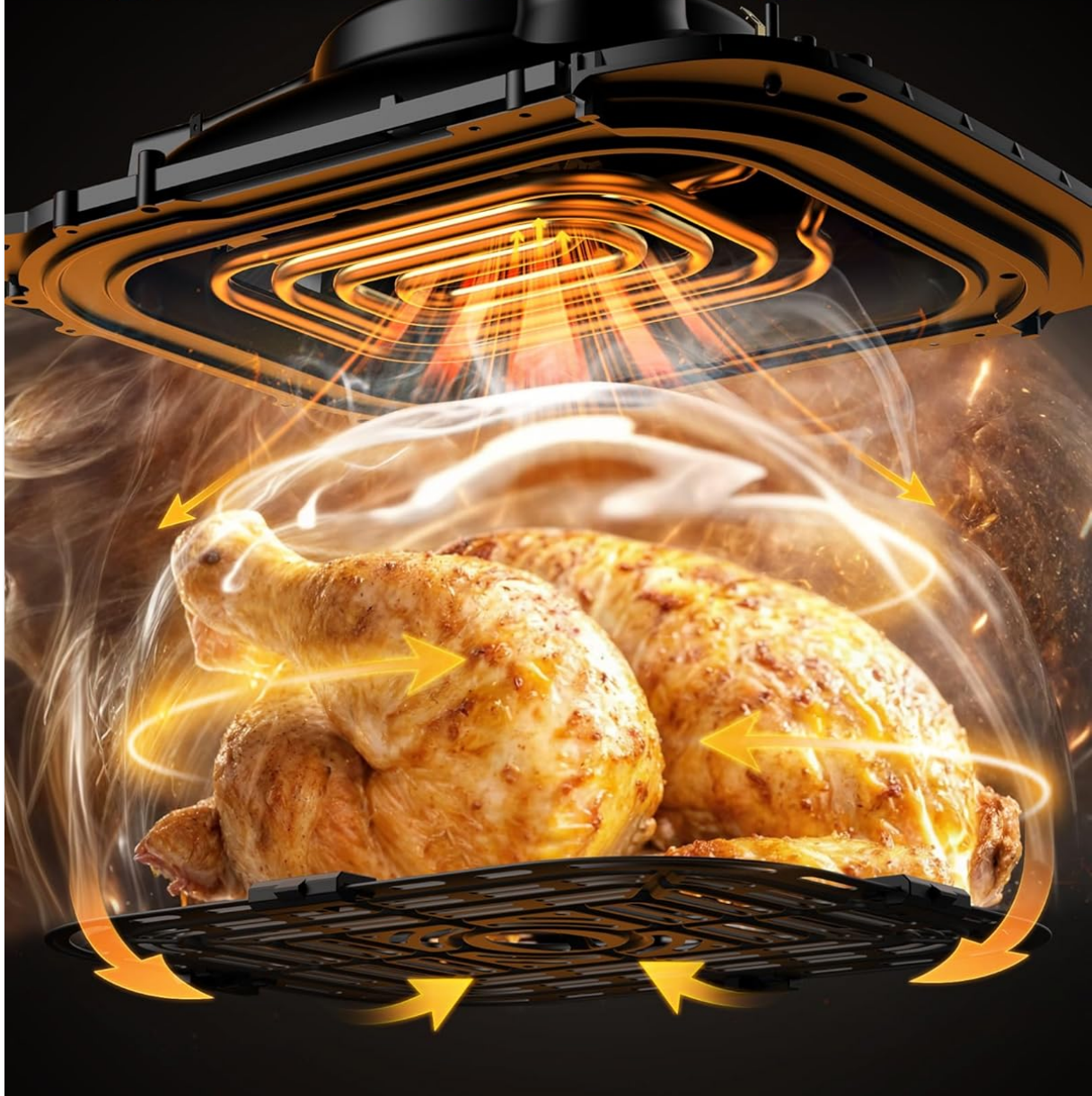
Figure 2: Internal view illustrating the 360° hot air circulation technology for even cooking.