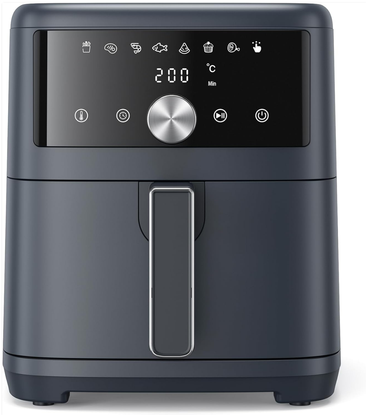
Figure 1: Front view of the Innsky Airfryer AFT06009, showcasing its sleek design, LED touch screen, and central control dial.