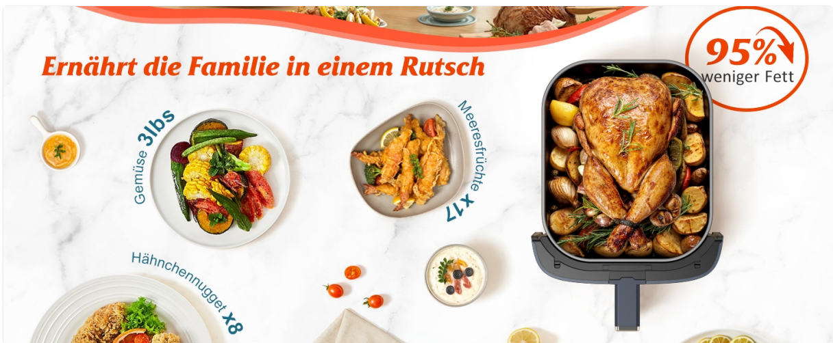
Figure 8: Example cooking settings for vegetables and meat.