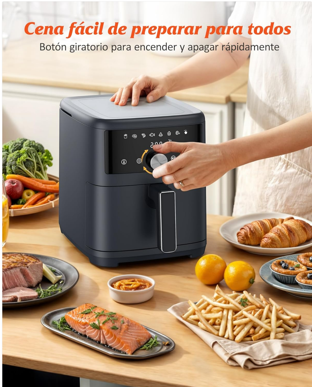
Figure 4: Adjusting settings using the central control dial.