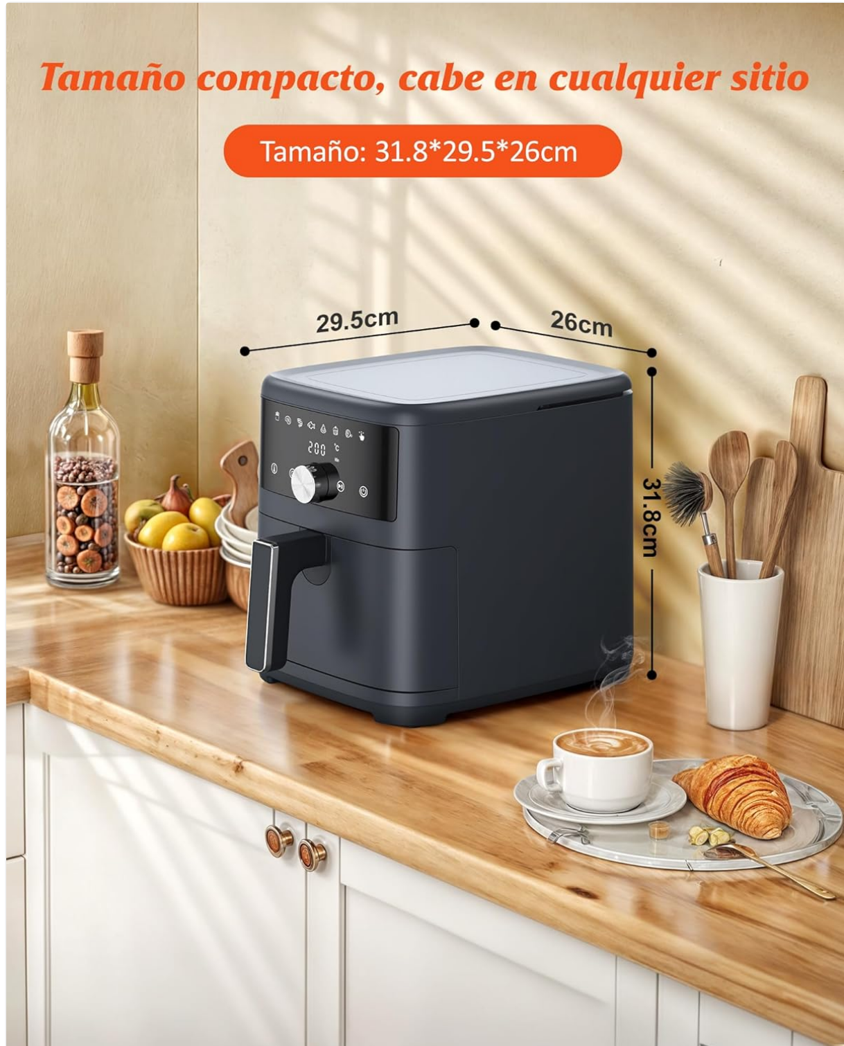
Figure 3: Recommended placement and dimensions for the Innsky Airfryer AFT06009.