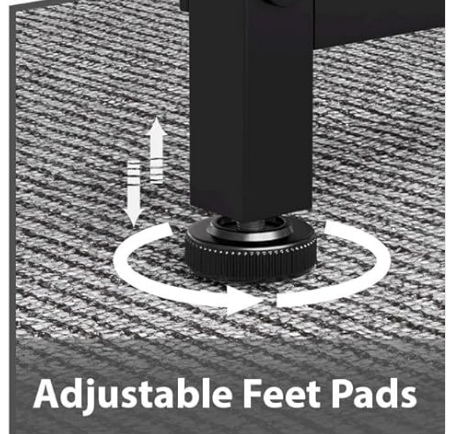
Adjustable Foot Pads

Image: A visual representation of the versatile under-desk storage, demonstrating how the shelves can be utilized to house a computer mainframe or adjusted to store books, files, and other personal items, optimizing your workspace.