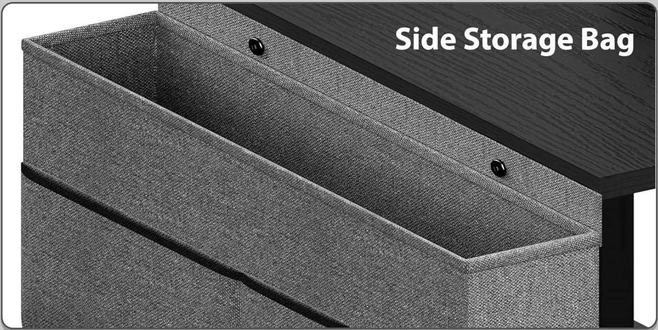
Image: A closer look at the movable monitor stand, which can be repositioned as needed, and the practical side storage bag, offering convenient access to frequently used items.