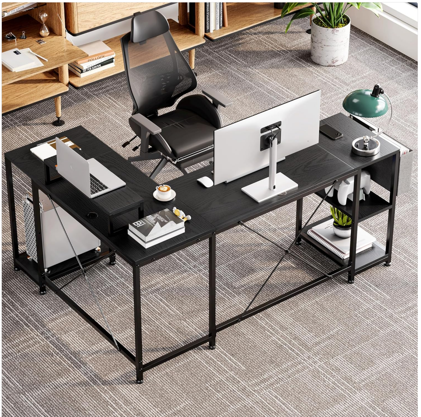
Image: Detailed views of the desk's practical features, including a cable management grommet for organized wiring, sturdy iron hooks for hanging headphones or bags, and adjustable feet pads for stability on various floor surfaces.