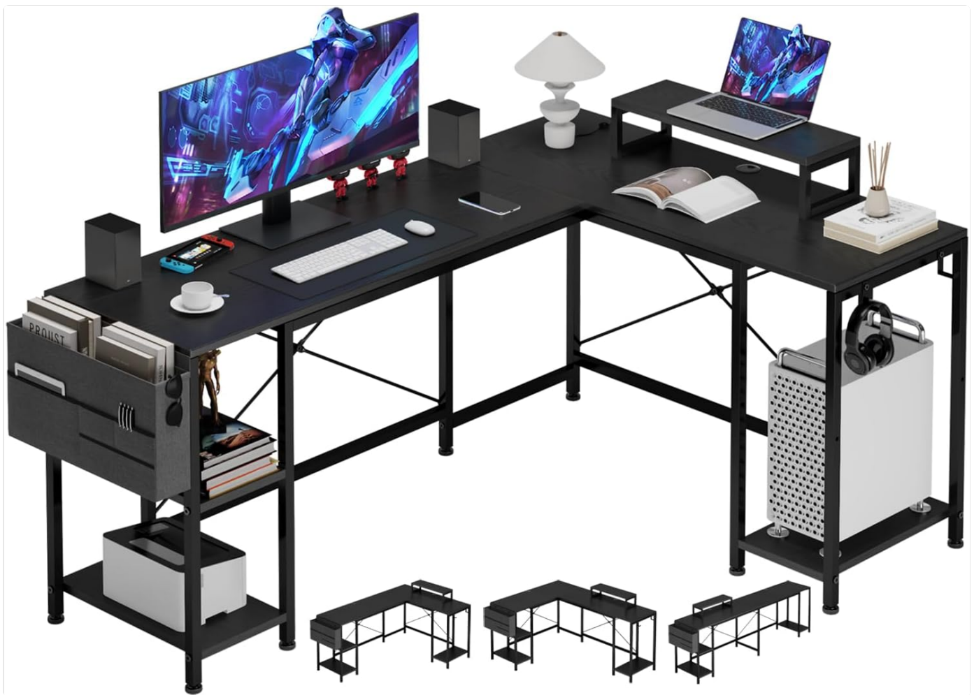
Image: The GIKPAL 59-inch L Shaped Computer Desk, showcasing its spacious design, integrated monitor stand, and various storage options, including a side storage bag and shelves. The desk is set up with a computer monitor, laptop, and other office accessories.