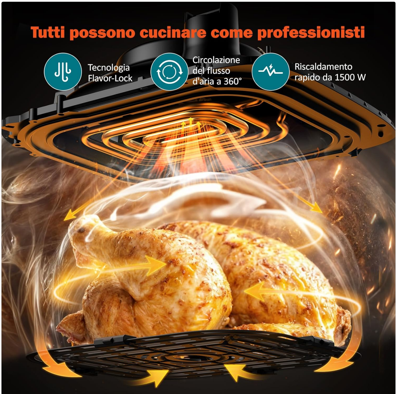
Figure 6: Air Circulation for Even Cooking

The air fryer will automatically pause cooking when the basket is pulled out. Once the basket is reinserted, cooking will resume with the remaining time and temperature settings.