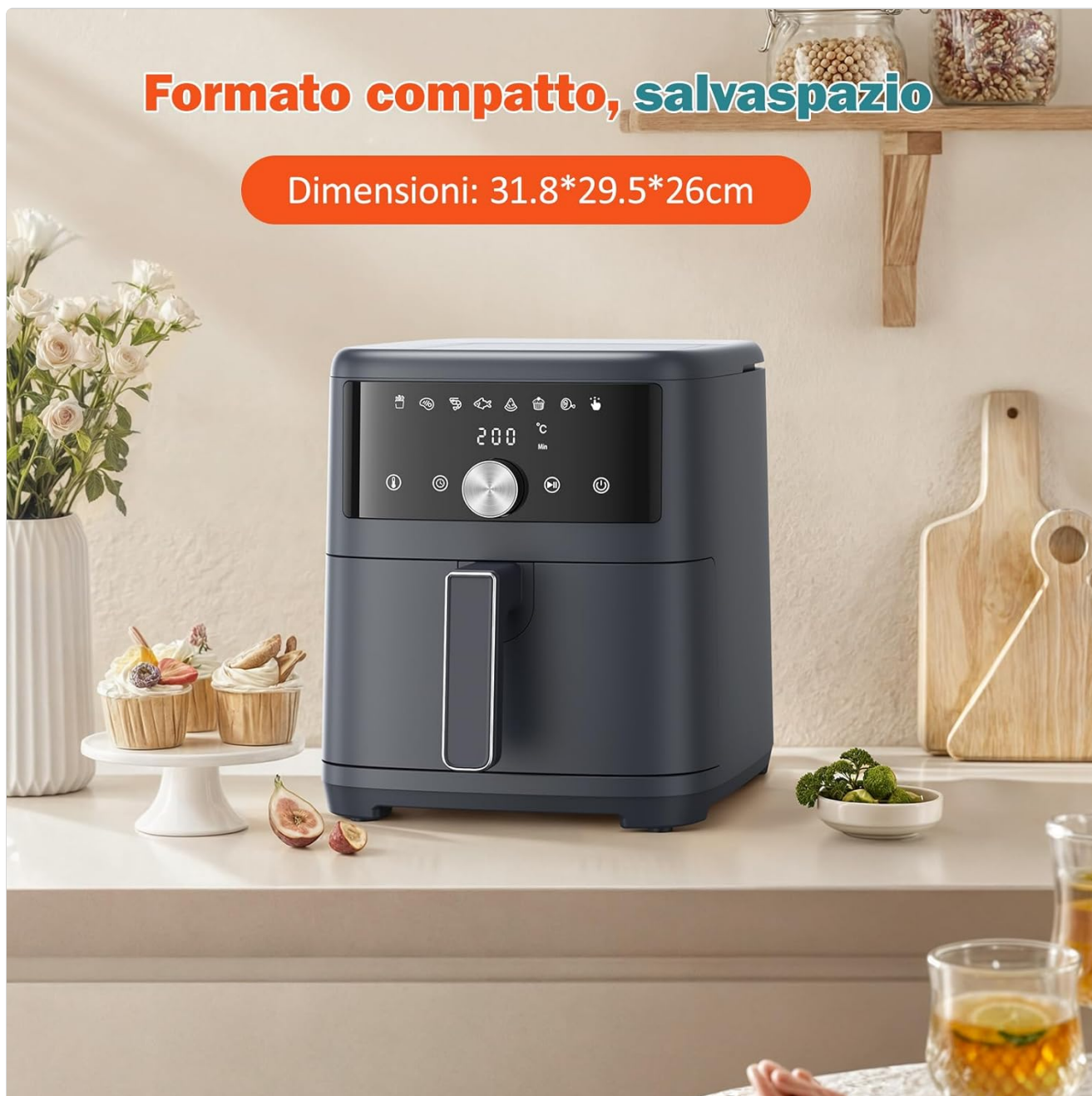
Figure 4: Compact Design and Dimensions