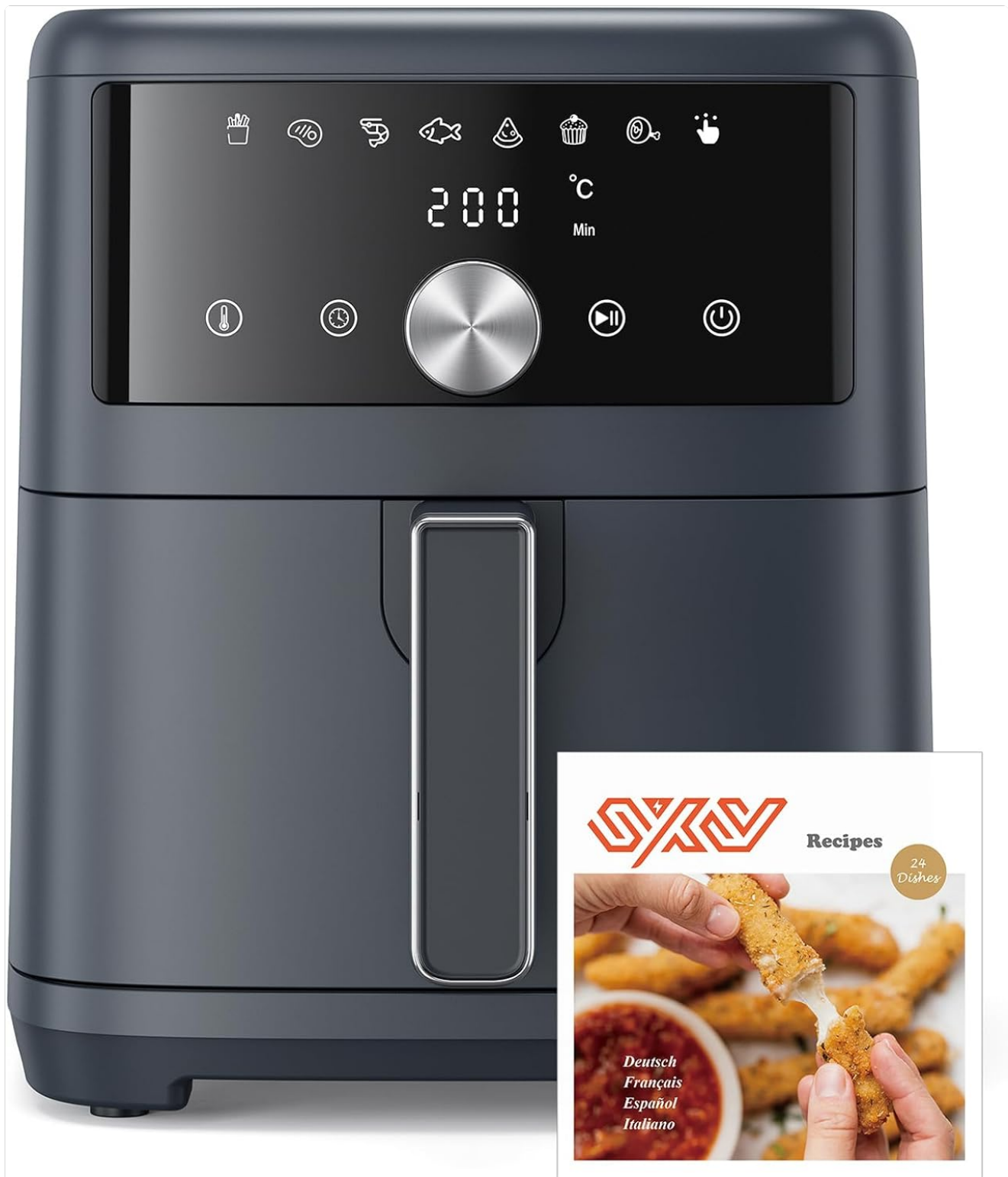
Figure 1: InnSky 6L Air Fryer