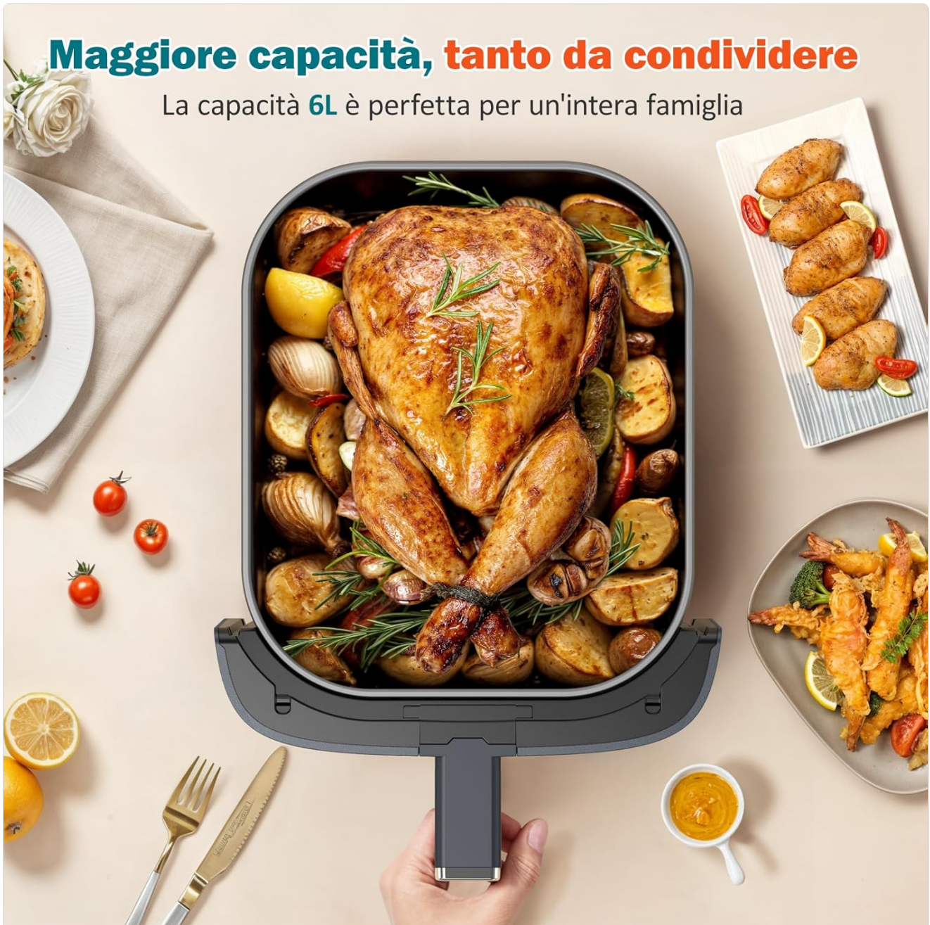
Figure 3: Large 6L Capacity for Family Meals

La capacità 6L è perfetta per un'intera famiglia