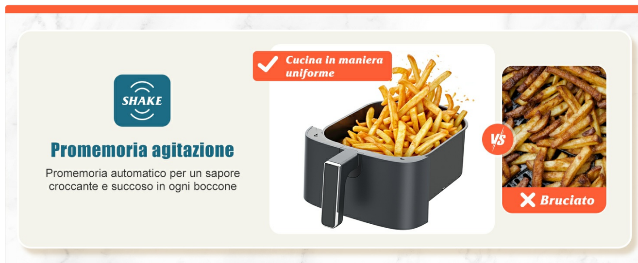
Figure 5: Shake Reminder for Even Cooking

For certain foods, the air fryer may prompt you to shake the basket halfway through the cooking process to ensure even cooking and crispiness. When the 'SHAKE' icon appears on the display, pull out the basket, gently shake the contents, and then reinsert the basket. The cooking will resume automatically.