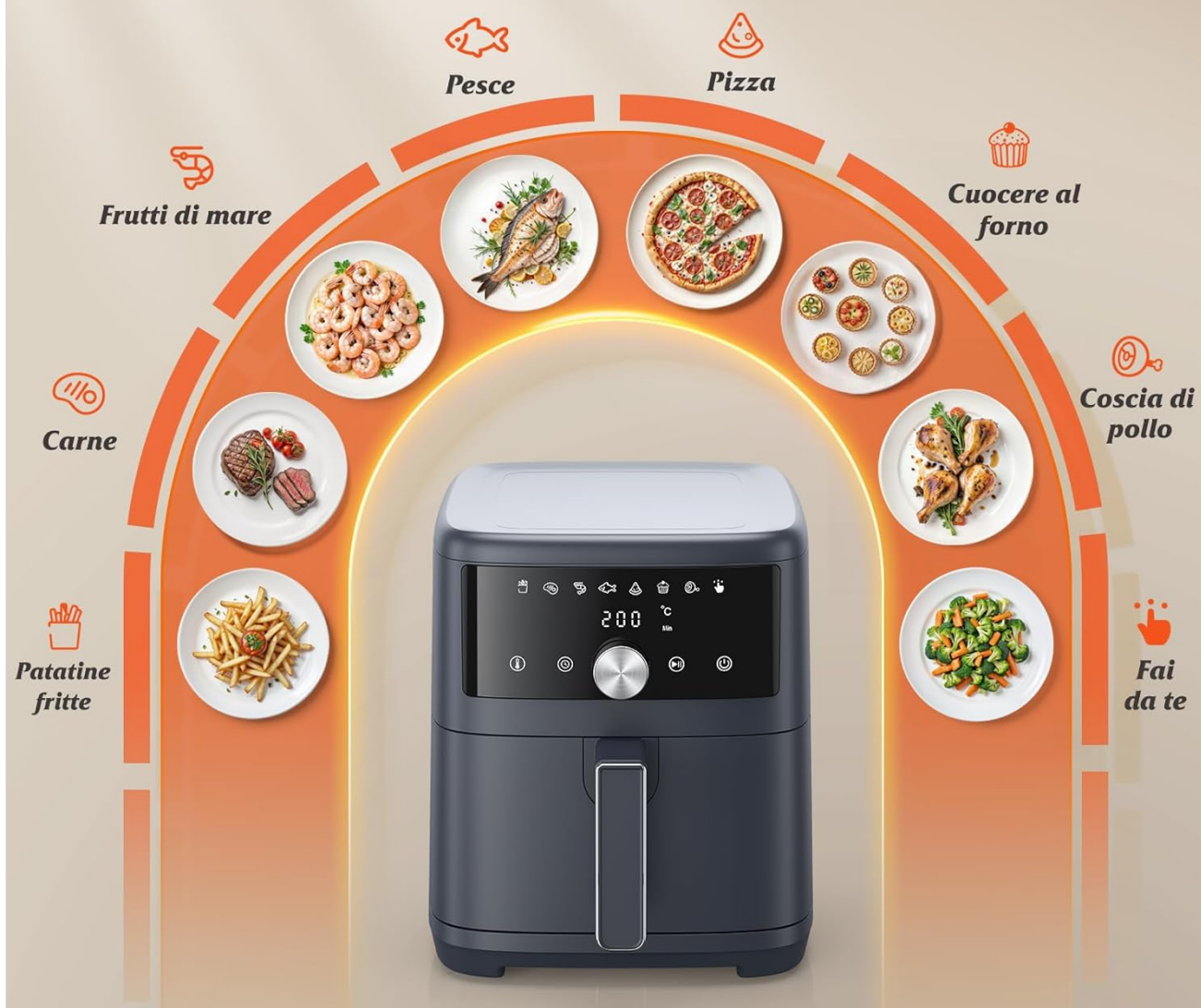
Figure 2: Control Panel with 7 Customizable Presets

7 preset personalizzabili per un avvio rapido