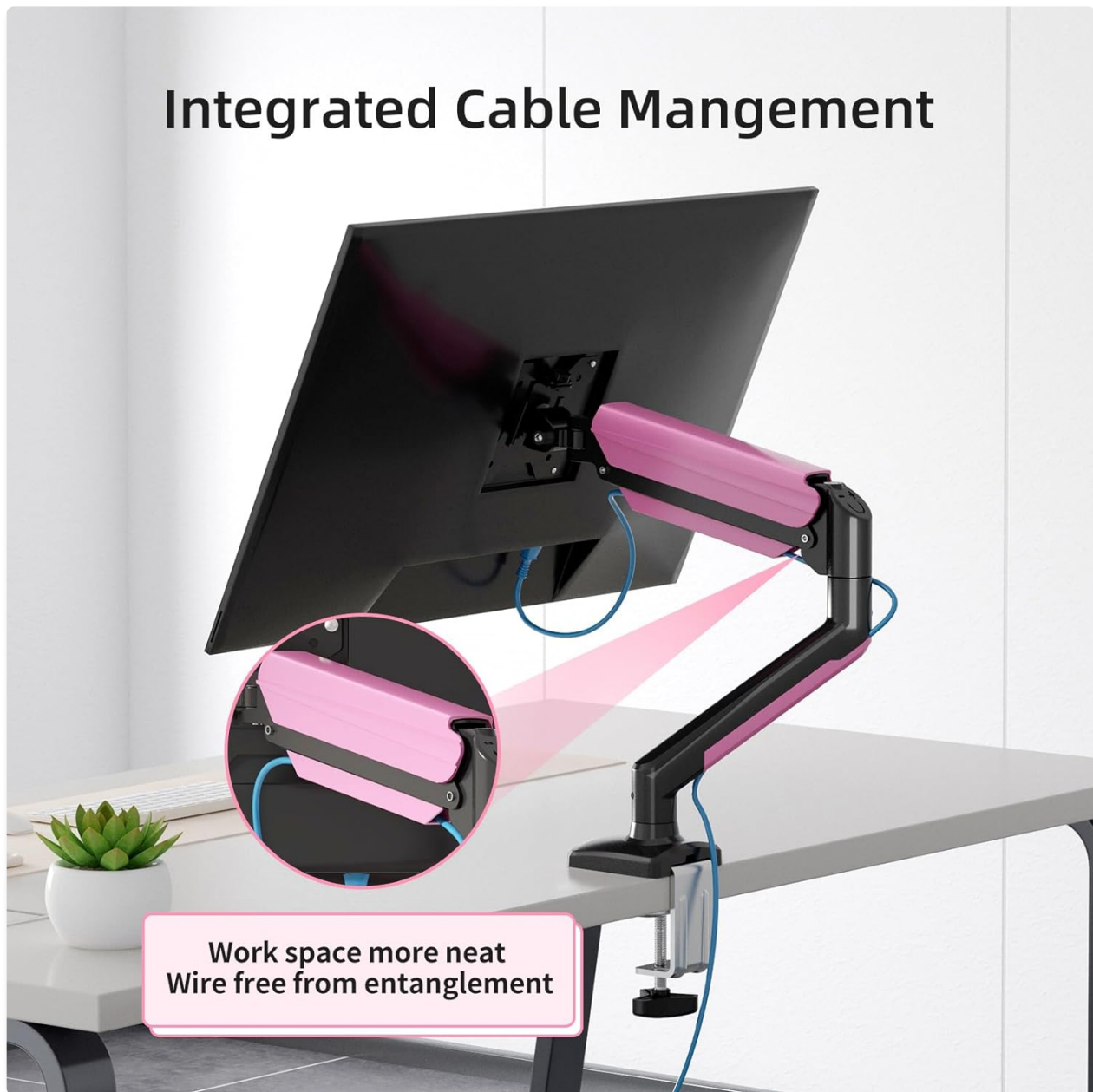
Image 6: The monitor arm demonstrating its integrated cable management system, keeping wires neat and free from entanglement.

your monitor cables through the designated channels on the arm to prevent clutter and tangles.