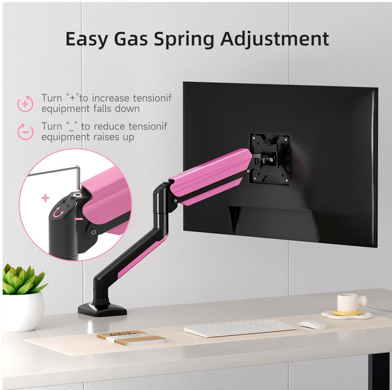
Image 5: Close-up view of the gas spring adjustment mechanism on the suptek monitor arm, indicating '+' for increasing tension and '-' for decreasing tension.

Your browser does not support the video tag.