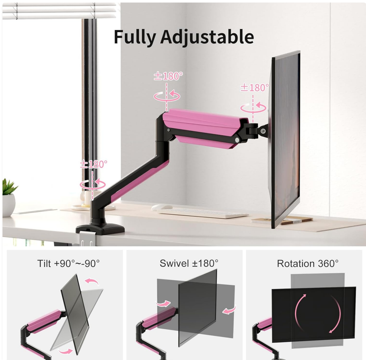
Image 4: The monitor arm demonstrating its full range of motion, including 360° rotation, \pm 180^\circ swivel, and \pm 180^\circ tilt.