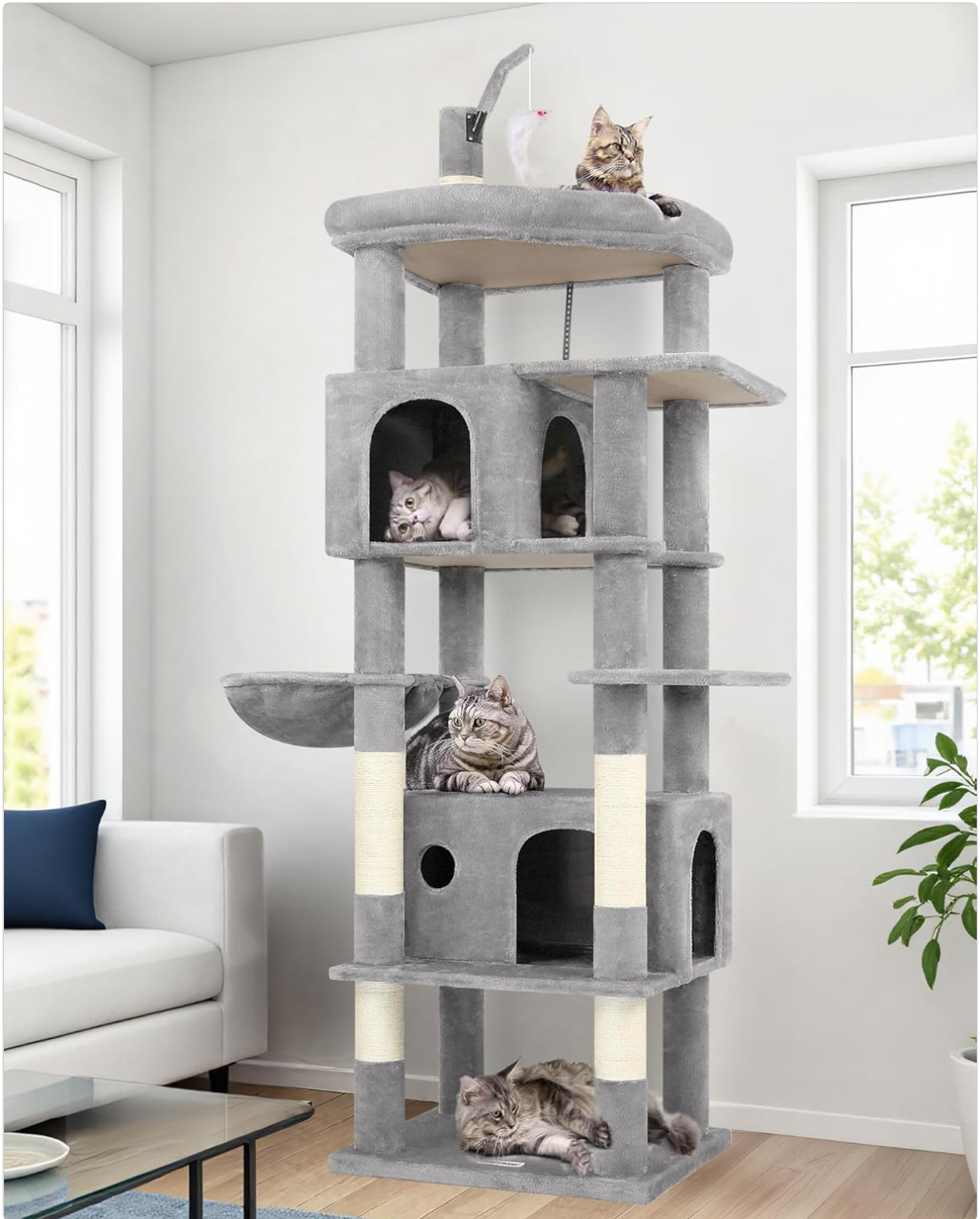
Image: The Globlazer Large Cat Tree Tower F74B, a multi-level structure with various platforms, condos, and scratching posts, occupied by several cats in a modern living room setting.

Video: An overview of the Globlazer F74B Large Cat Tree, showcasing its features and multiple cats interacting with the structure. This video highlights the various levels, condos, scratching posts, and perches, demonstrating its suitability for active and resting cats.