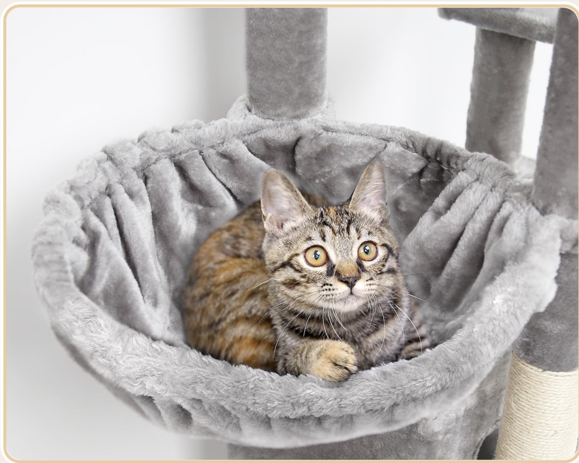
Image: A cat nestled in the large hanging basket, highlighting the comfort and stability of this feature for relaxation.