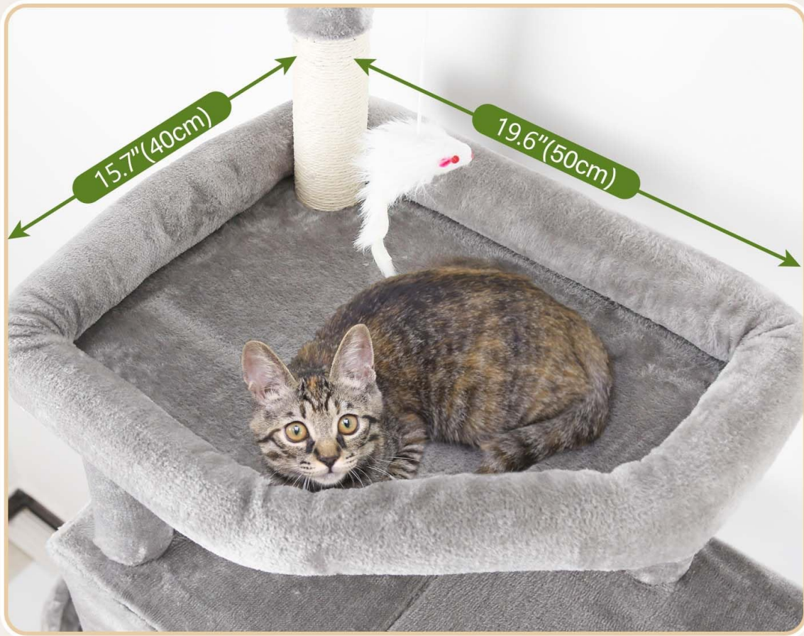
Image: A cat comfortably resting on the oversized top perch of the cat tree, demonstrating the spacious area for observation and relaxation.

Provides a spacious area for observation, rest, and play, allowing cats to freely roll and relax