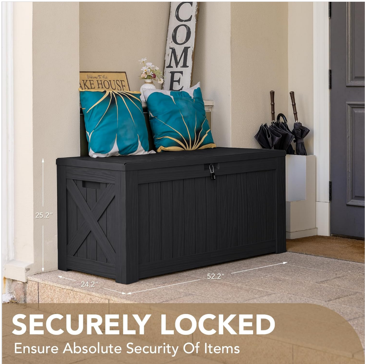
Image: The deck box with its dimensions and the securely lockable feature visible, ensuring item safety.