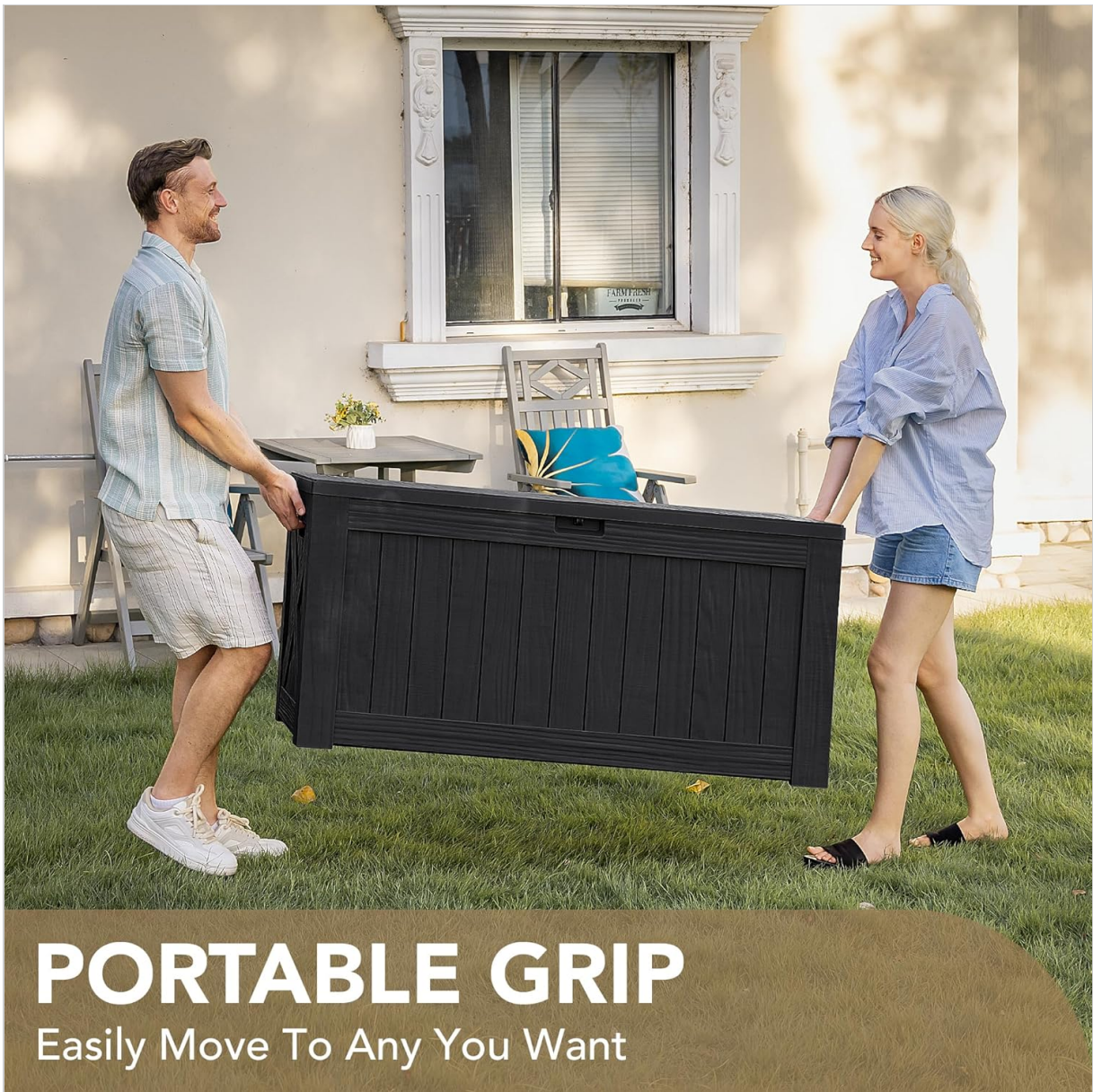
Image: The deck box being easily moved by two individuals using its portable grip handles on the sides.

Your browser does not support the video tag.