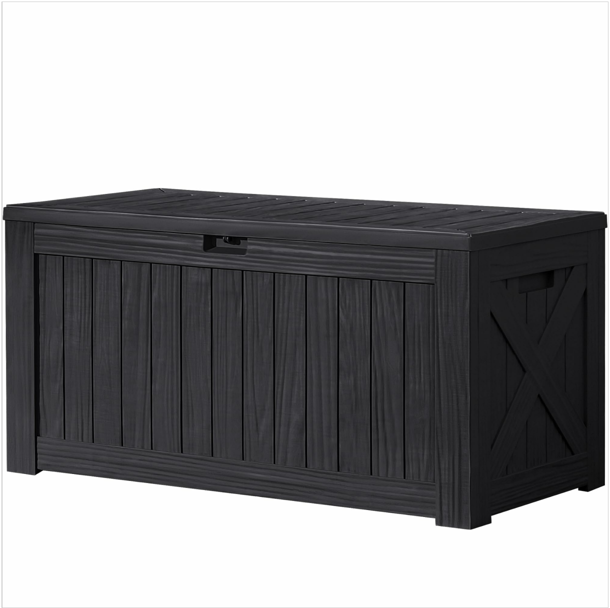
Image: The Devoko 120 Gallon Deck Box, showcasing its sleek black finish and generous size in an outdoor setting.