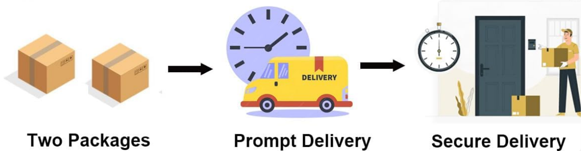
Image: Delivery process illustrating that the product ships in two packages, potentially arriving on different days.