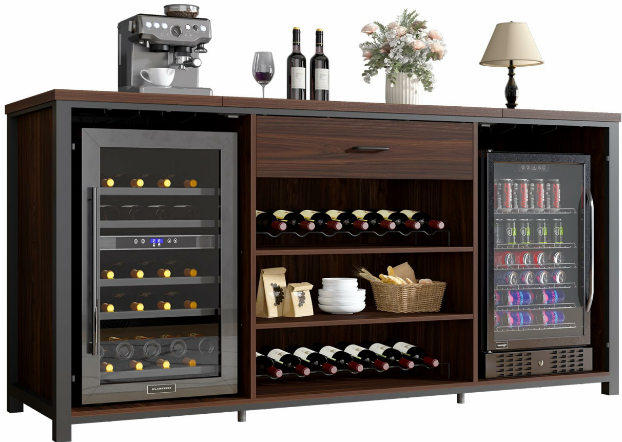
Image: The LVB 70-Inch Walnut Bar Cabinet, showcasing its design and storage capabilities, including a dedicated space for a refrigerator.