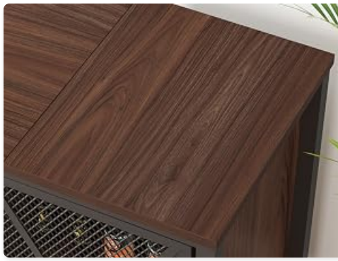
Image: Close-up of the walnut wood grain, highlighting the material's aesthetic.