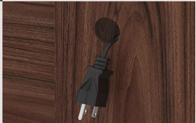
Image: Detailed view of the storage drawer, adjustable shelves, and cable management feature.