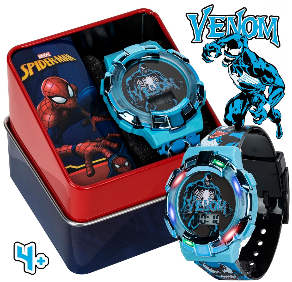
Figure 2: The Marvel Venom Kids Watch presented in its themed tin box.