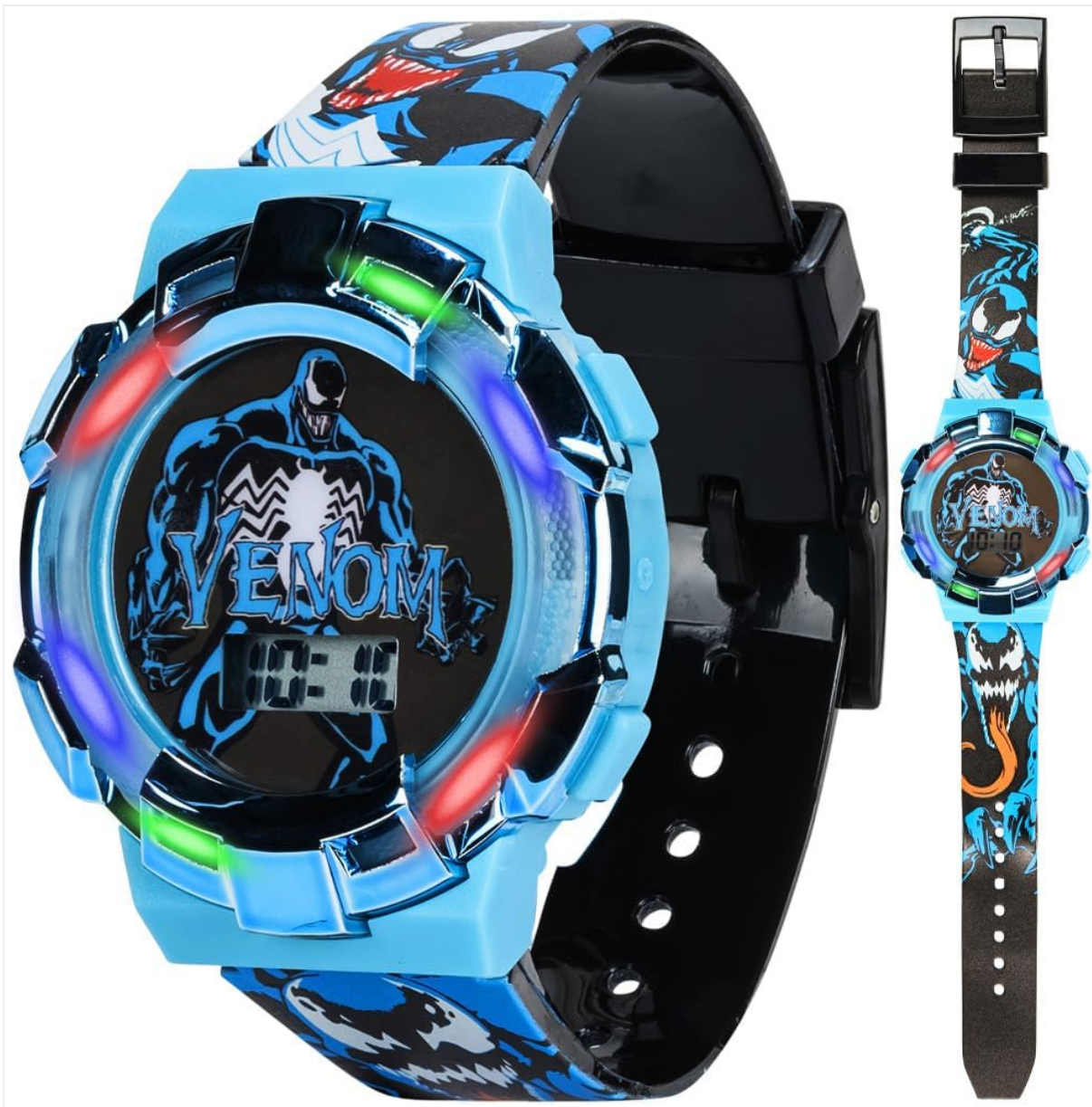
Figure 1: Front view of the Marvel Venom Kids Watch, displaying the LCD screen and light-up bezel.