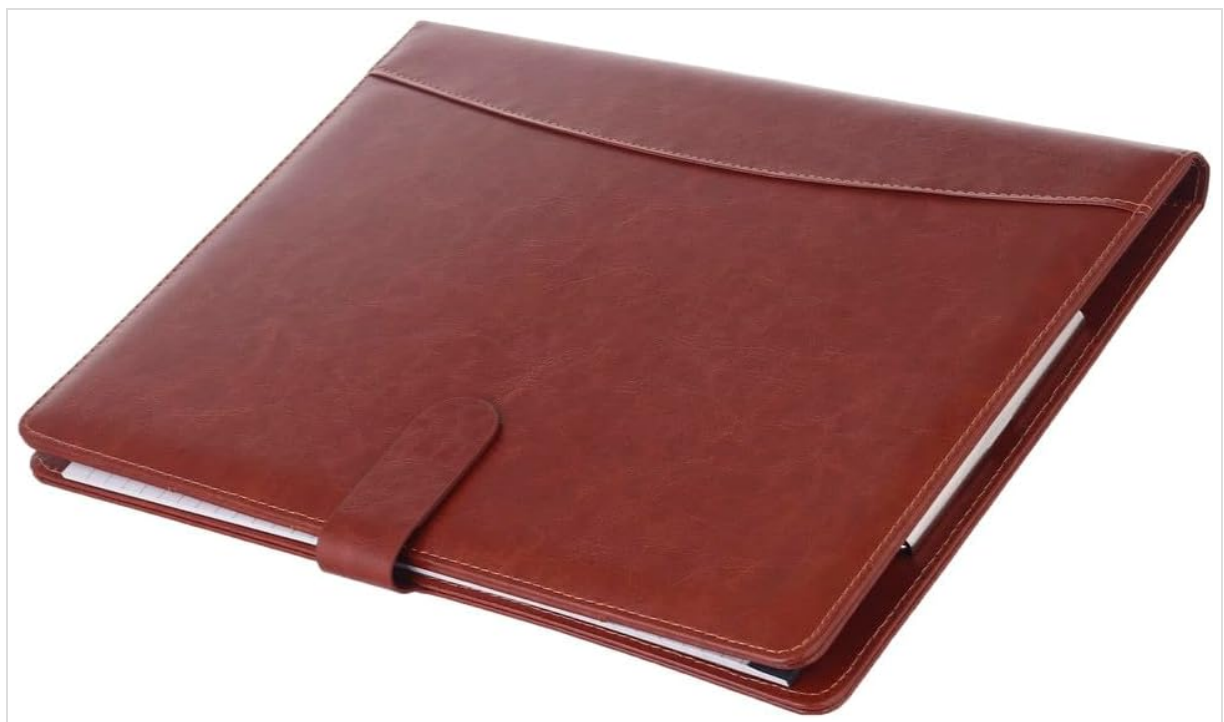
Figure 2: Angled view of the closed 3A SX816 Leather Portfolio, highlighting its slim profile and textured leather finish.