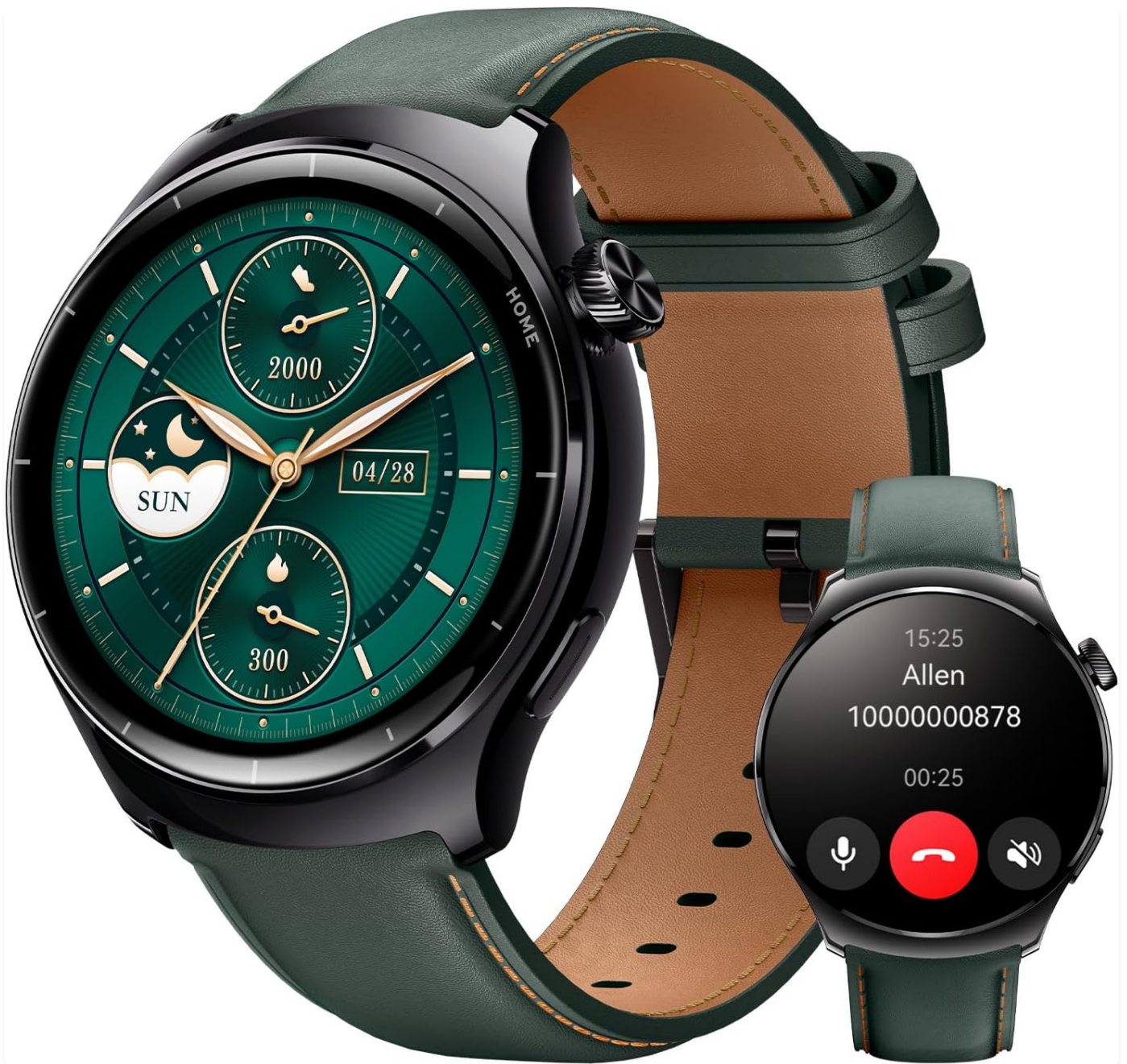
Image: The Mibro Lite3 Pro Smartwatch in dark green, displaying its main interface and a simulated incoming call screen.