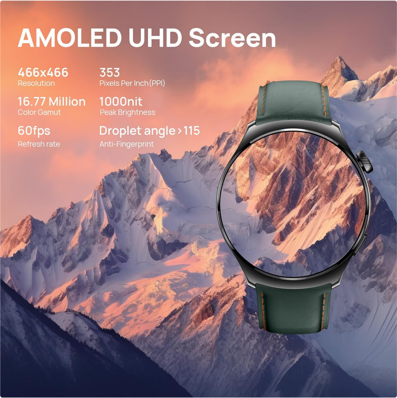
Image: Close-up of the Mibro Lite3 Pro Smartwatch screen, highlighting its AMOLED UHD display features such as resolution, PPI, color gamut, brightness, refresh rate, and anti-fingerprint coating.

The Mibro Lite3 Pro features a vibrant 1.32-inch AMOLED UHD touchscreen for intuitive interaction. Swipe across the screen to navigate through menus, notifications, and widgets. Press the side button to return to the home screen or access the app list.