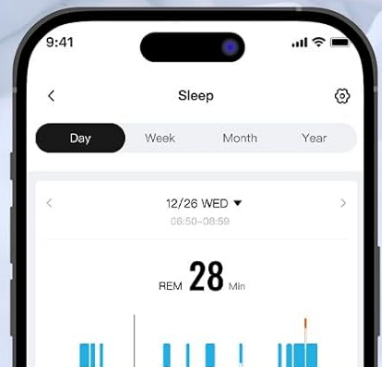
Image: A person sleeping with the Mibro Lite3 Pro Smartwatch on their wrist, demonstrating its scientific sleep monitoring features and app interface for sleep data.