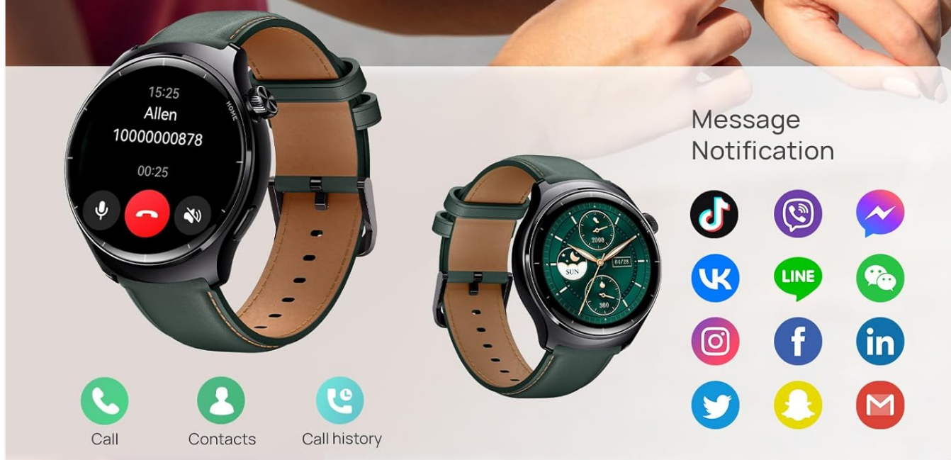
Image: The Mibro Lite3 Pro Smartwatch showing its Bluetooth calling functionality and various app icons for message notifications.