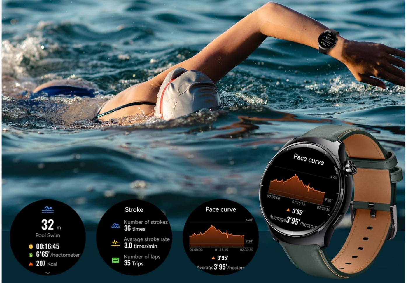
Image: A swimmer wearing the Mibro Lite3 Pro Smartwatch, demonstrating its 5ATM water resistance for activities like swimming, handwashing, and rain exposure.