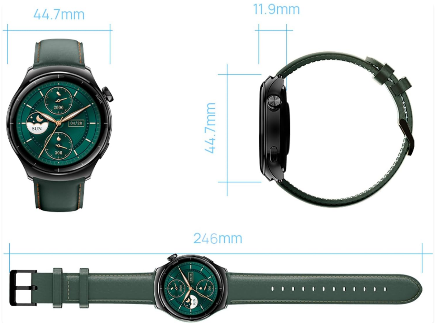
Image: Technical diagram illustrating the dimensions of the Mibro Lite3 Pro Smartwatch, including its diameter, thickness, and total length with the strap.