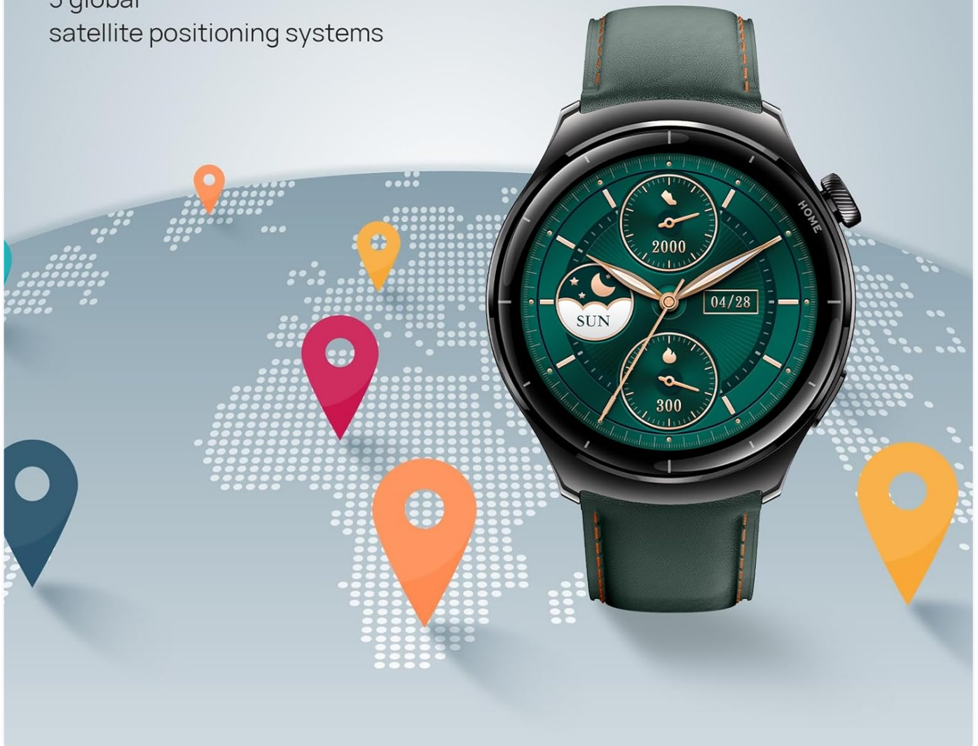
Image: The Mibro Lite3 Pro Smartwatch overlaid on a world map, illustrating its global satellite positioning system capabilities with multiple pin locations.