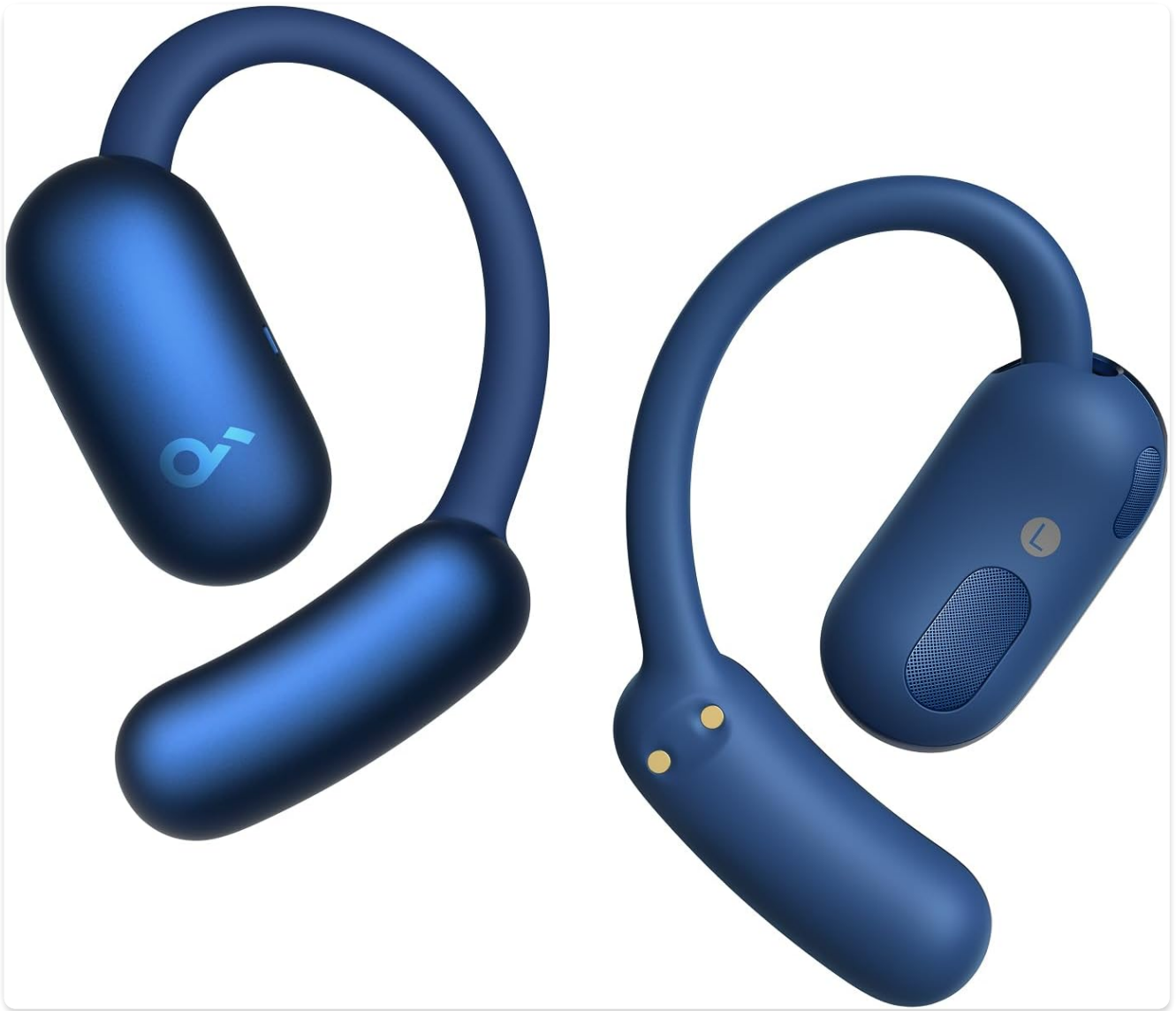
Image: The Soundcore AeroFit 2 headphones, showcasing their open-ear design and sleek blue finish.