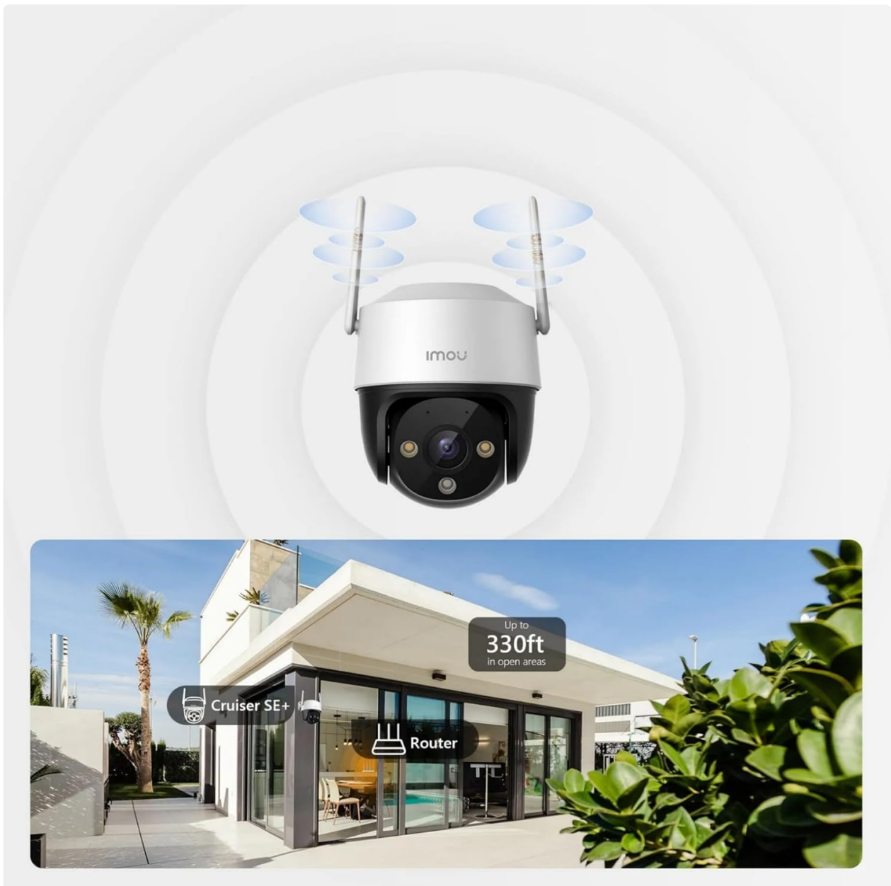
Figure 3: Side view of the camera, highlighting the dual antennas for stable Wi-Fi connectivity.