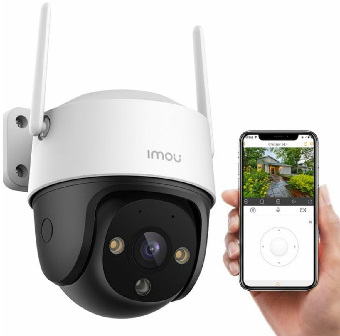
Figure 2: The camera's smart tracking and active deterrence features in action, showing human detection and an active deterrent light.