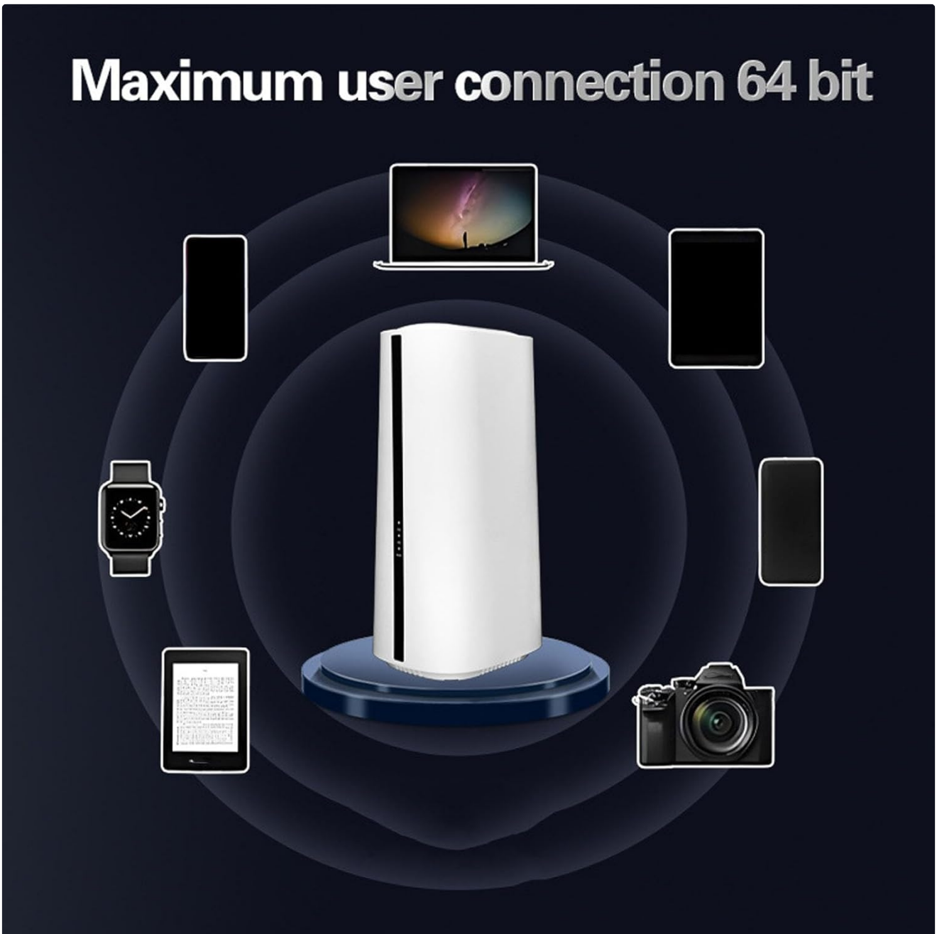
Image: The router providing connectivity to multiple devices, demonstrating its capacity for up to 64 users.