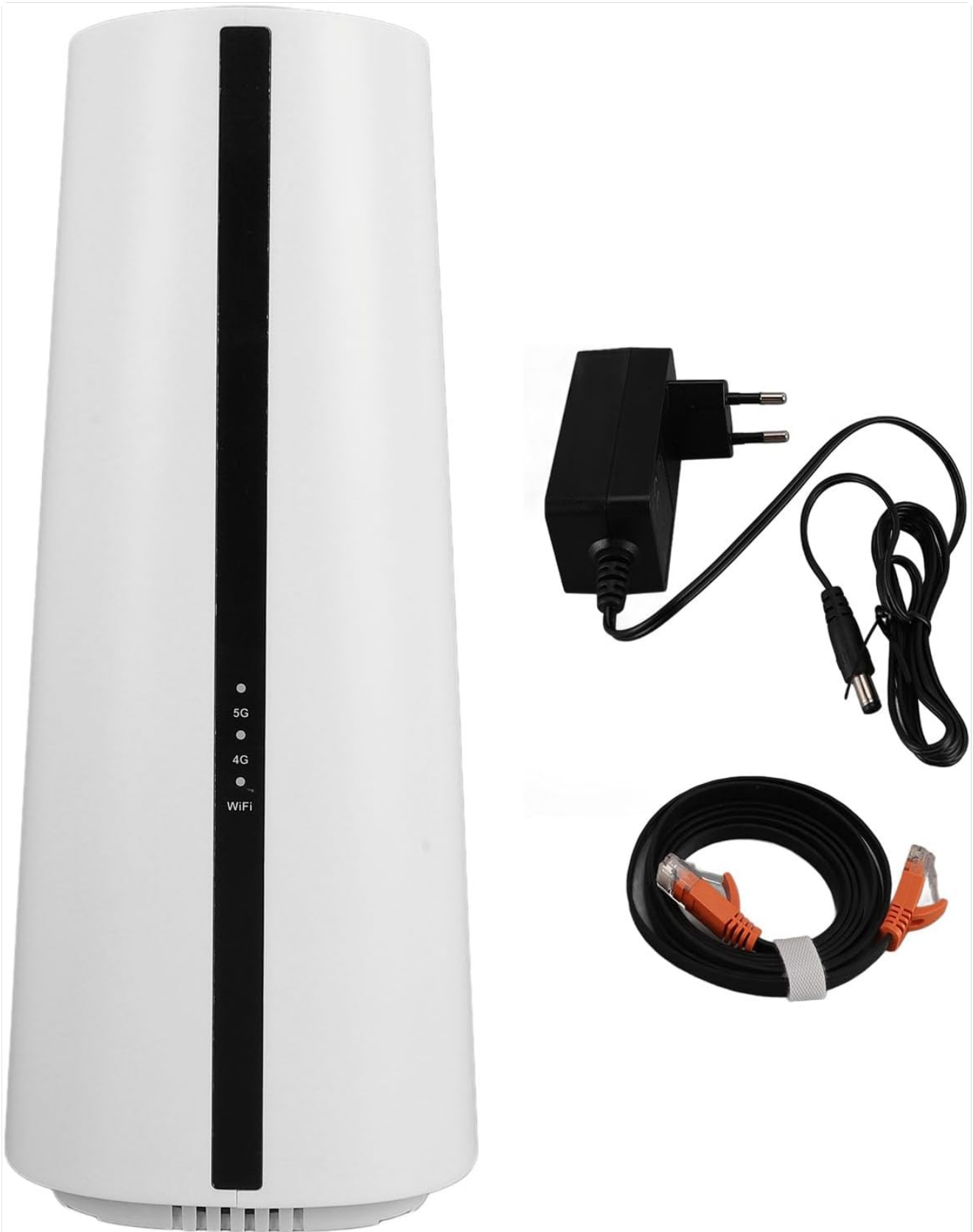
Image: GOWENIC 5G CPE Router with its power cord and network cable.