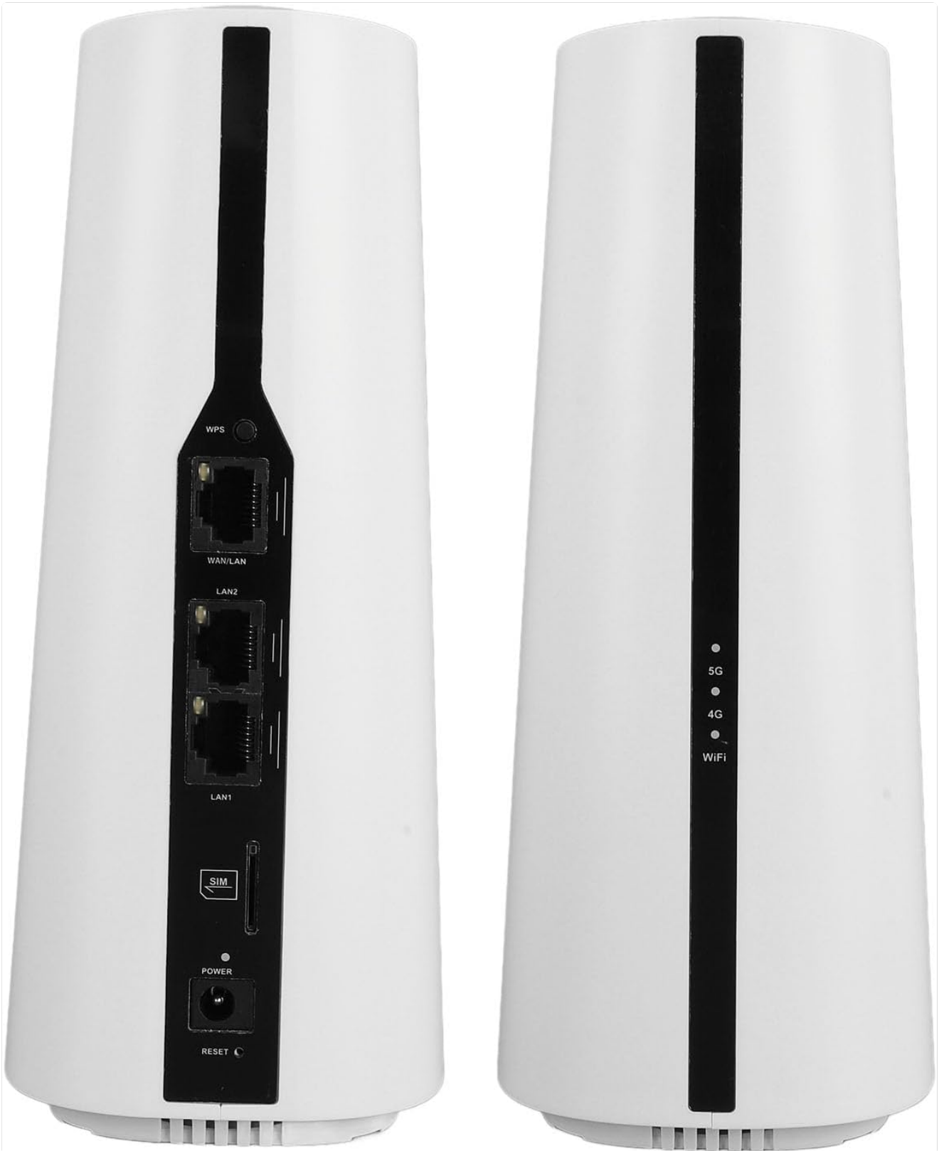
Image: The GOWENIC 5G CPE Router, ready for setup.