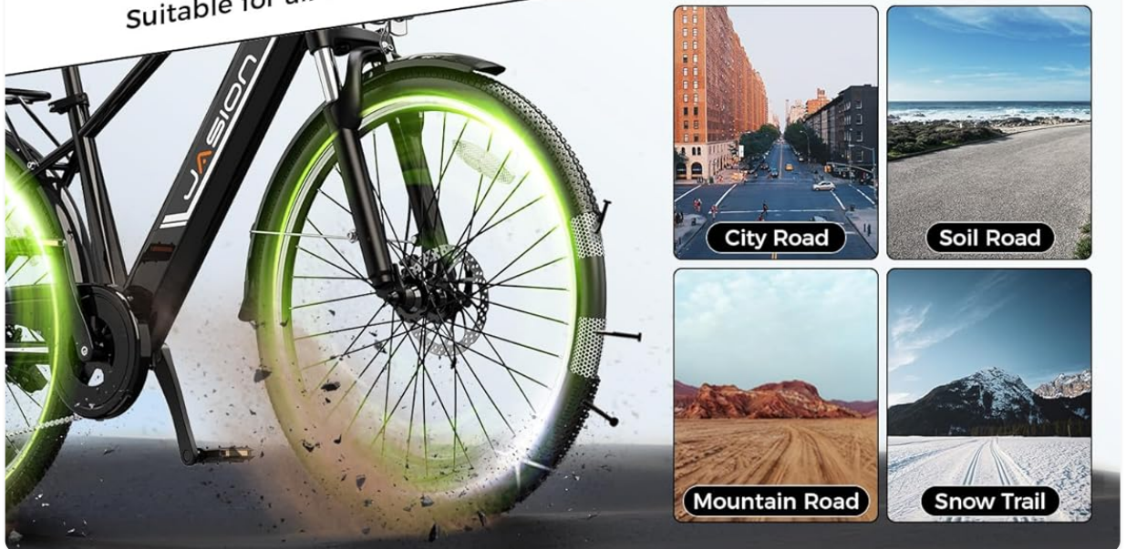
Image: A detailed view of the Jasion Roamer/ST Electric Bike's front suspension fork, emphasizing its lockable and shock-absorbing capabilities for a comfortable ride across diverse terrains.

Suitable for all terrains and providing a comfortable riding experience.