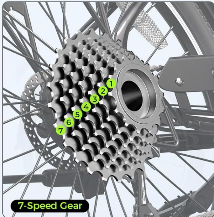
Image: A close-up diagram illustrating various components of the Jasion Roamer/ST Electric Bike, such as the Shimano transmission, adjustable seat, sturdy fenders, crank protection, and the 7-speed gear system.