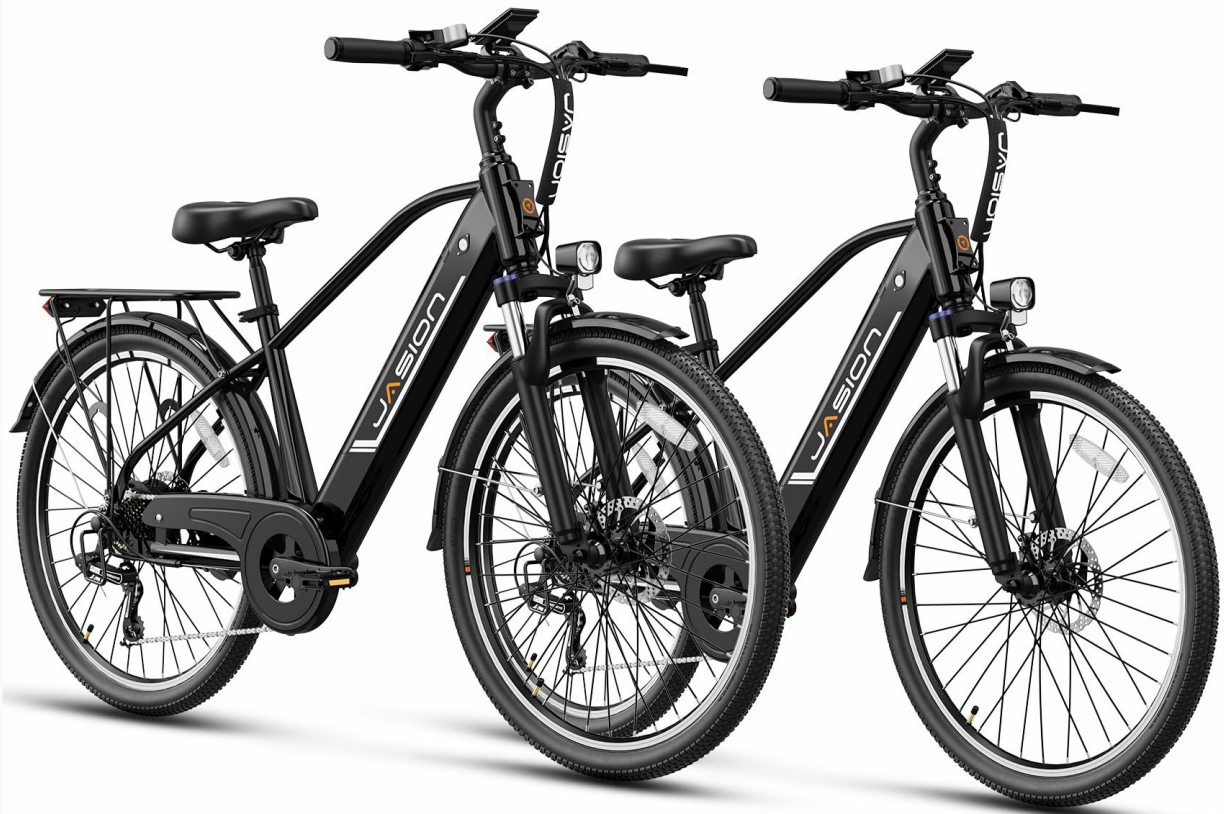
Image: A complete view of the Jasion Roamer/ST Electric Bike, showcasing its overall design and key features such as the frame, wheels, and seat.