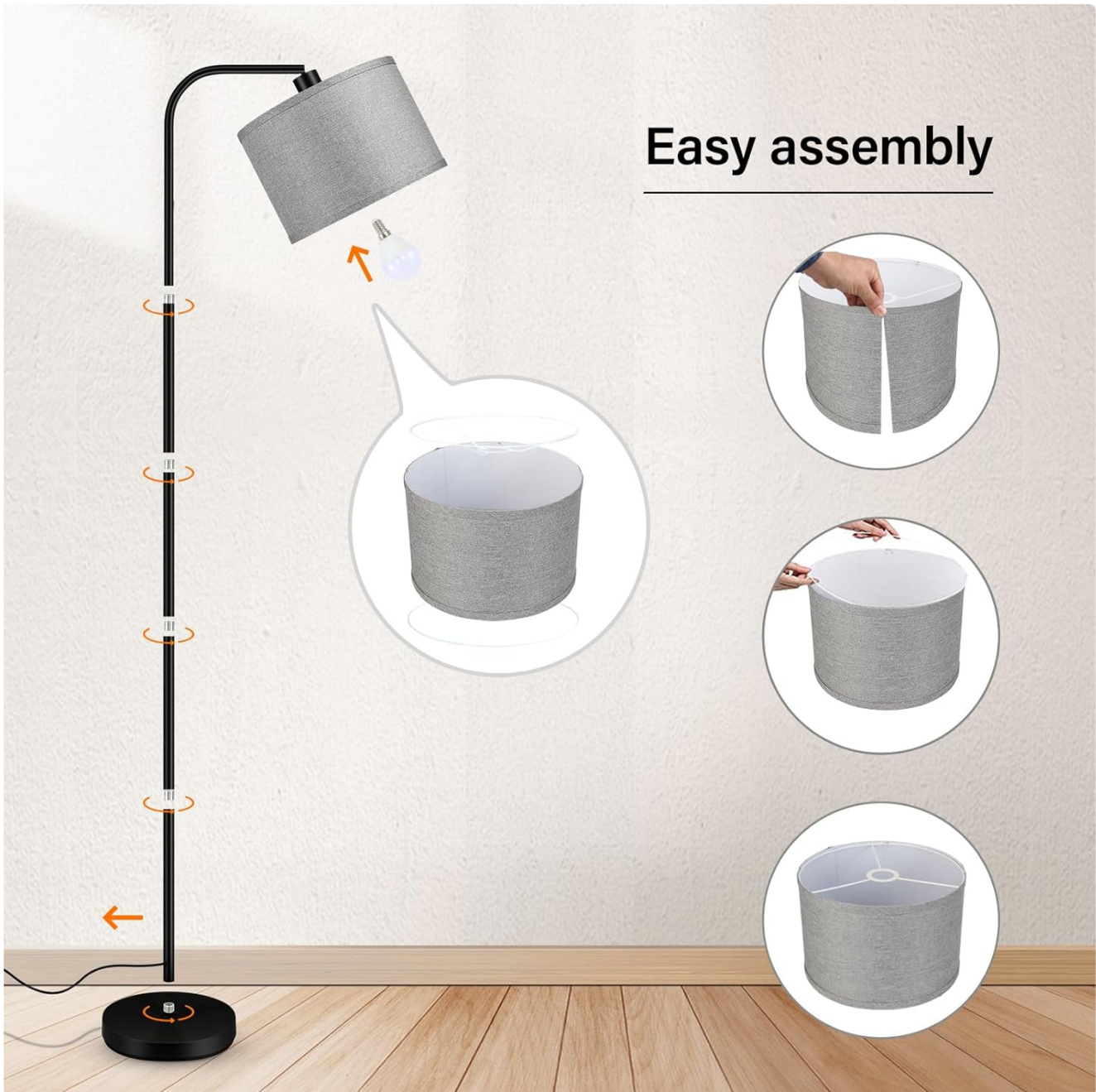
Visual guide illustrating the assembly process, including installing the lampshade, screwing poles together, attaching to the base, and inserting the bulb.